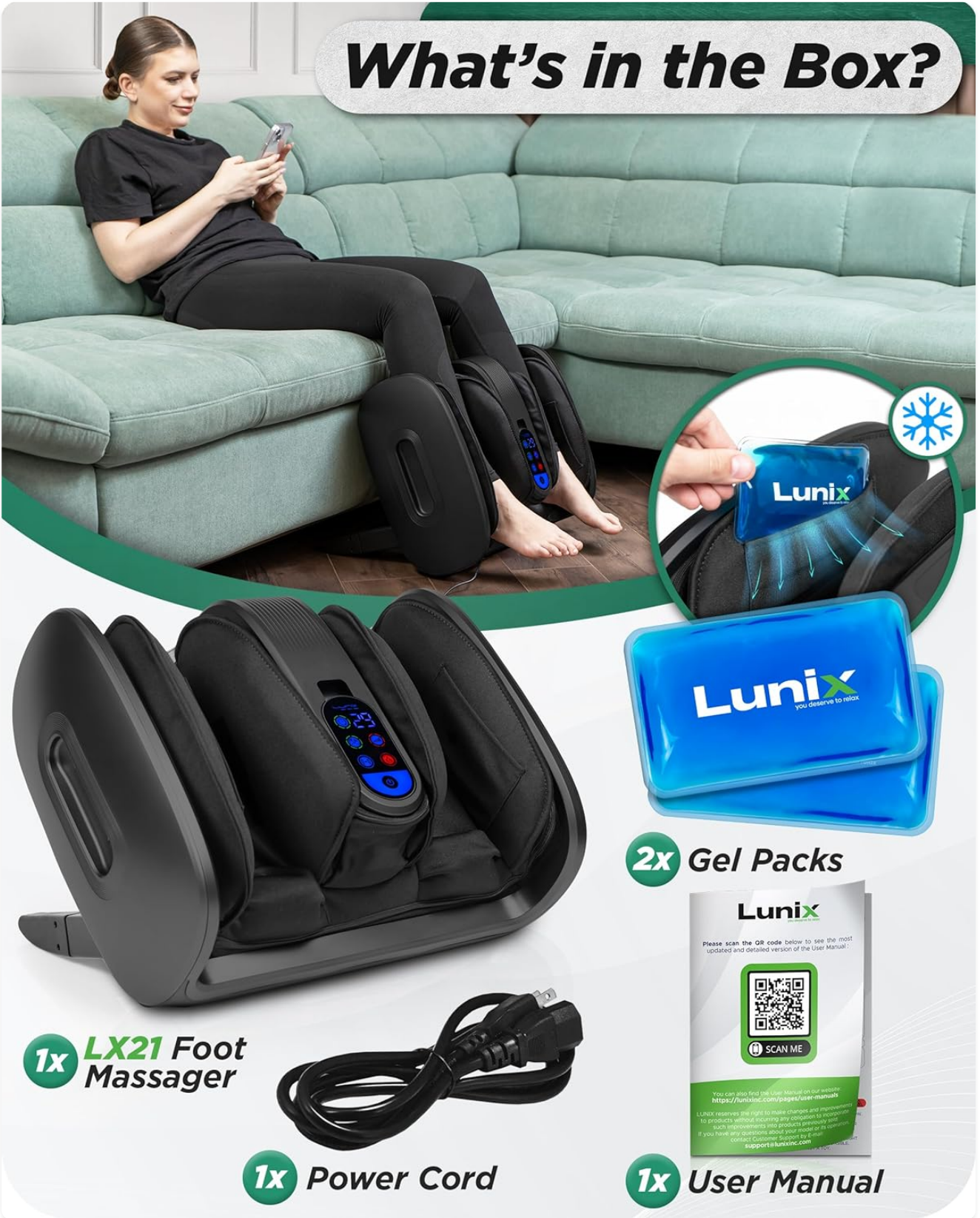
Figure 2.1: What's in the Box? The LX21 Foot Massager, 2x Gel Packs, 1x Power Cord, and 1x User Manual.