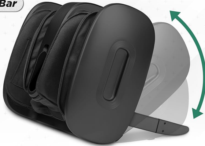
Figure 3.6: Adjustable Angle Bar. Easily change the angle for optimal comfort.