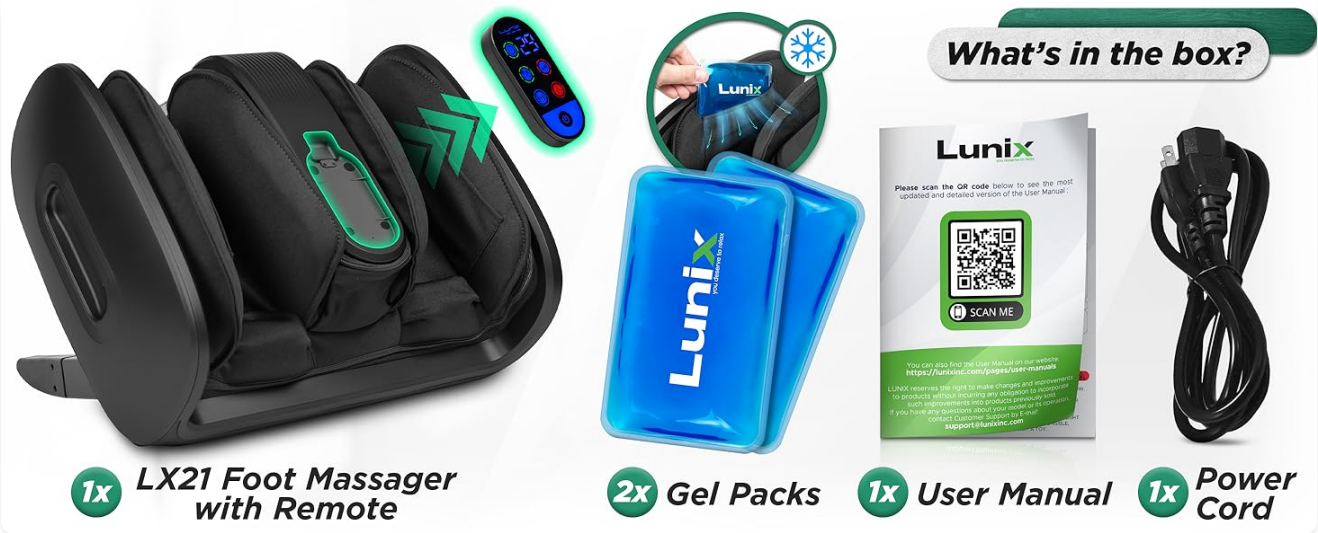
Figure 3.4: Cold Therapy. Gel packs can be pre-cooled and inserted for a refreshing massage.