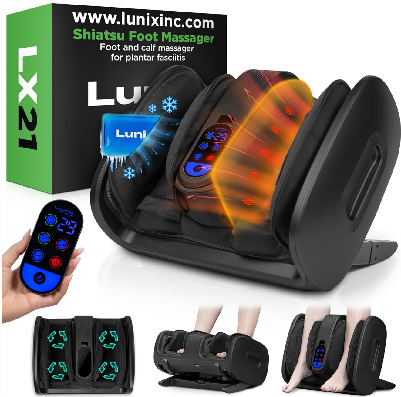
Figure 3.1: The Luni LX21 Massager in use, highlighting its design for both foot and calf massage.