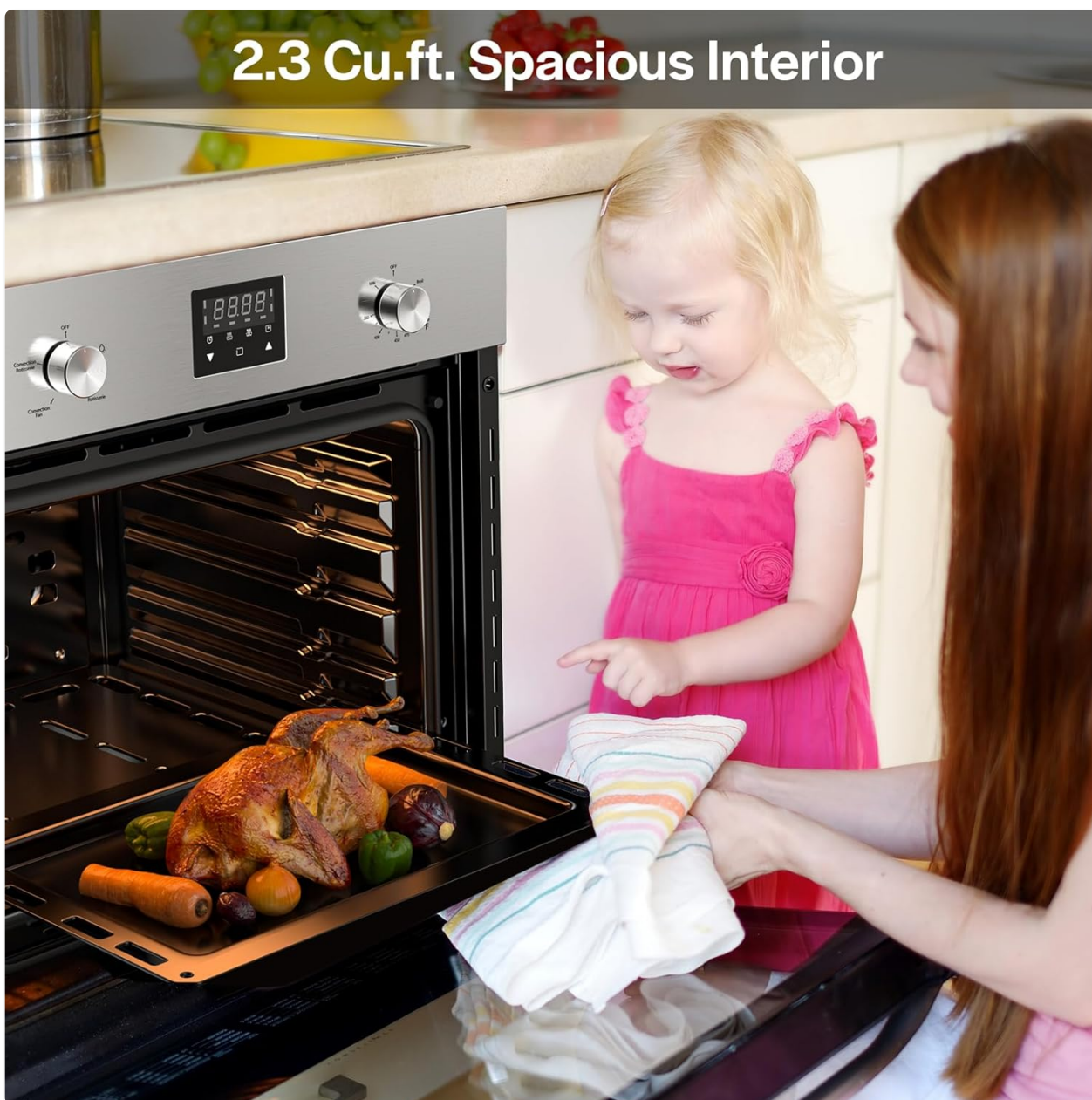
Figure 5.4: Spacious 2.3 Cu.ft. Interior with Multiple Rack Positions.

The oven features five rack positions, allowing flexibility for various cooking needs and dish sizes.