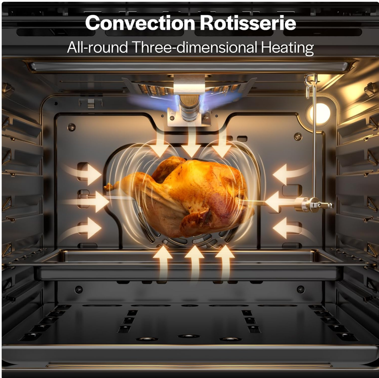
Figure 5.2: Convection Rotisserie Function in Action.