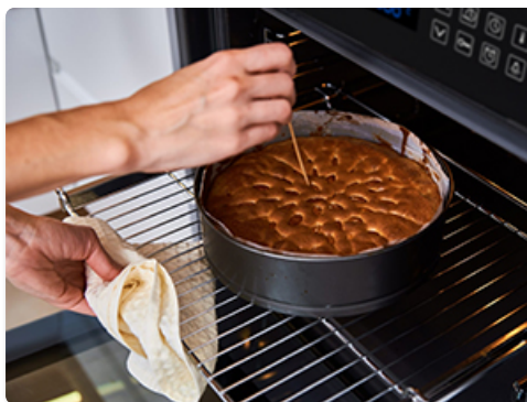
Figure 5.3: Baking with the Empava Oven.