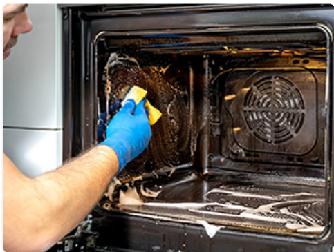
Figure 6.1: Cleaning the Oven Interior.