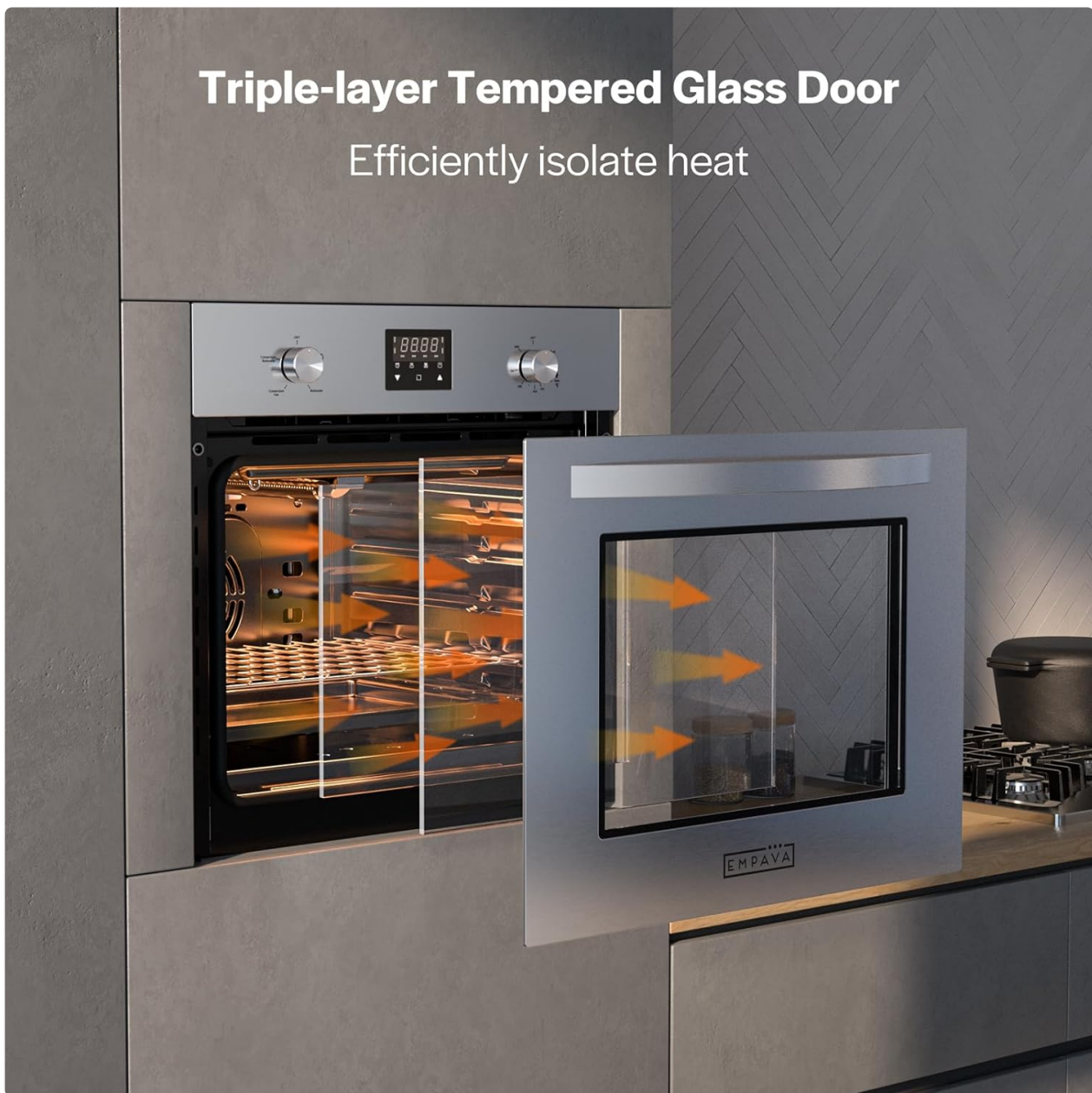
Figure 3.3: Triple-layer Tempered Glass Door for Thermal Isolation.