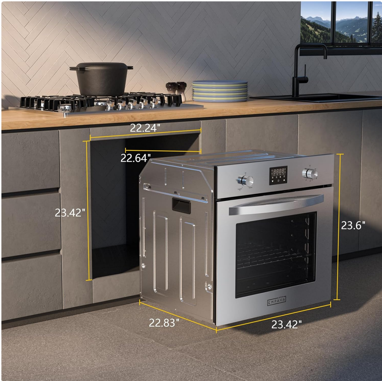
Figure 4.1: Product Dimensions for Installation.