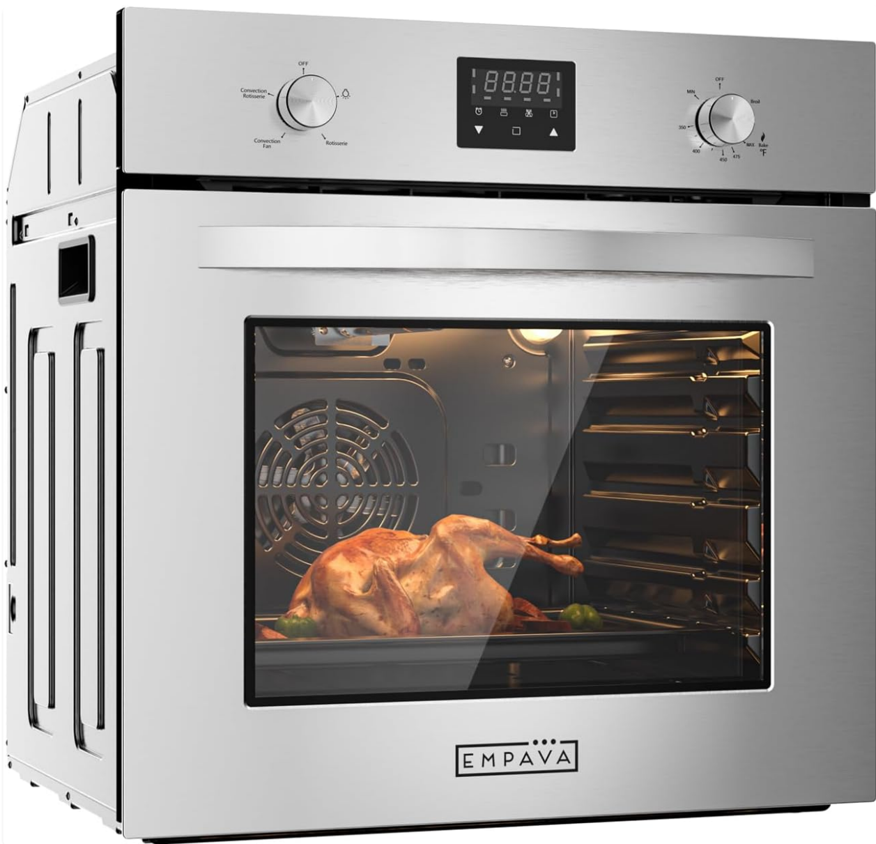
Figure 1.1: Empava 24-inch Single Gas Wall Oven.