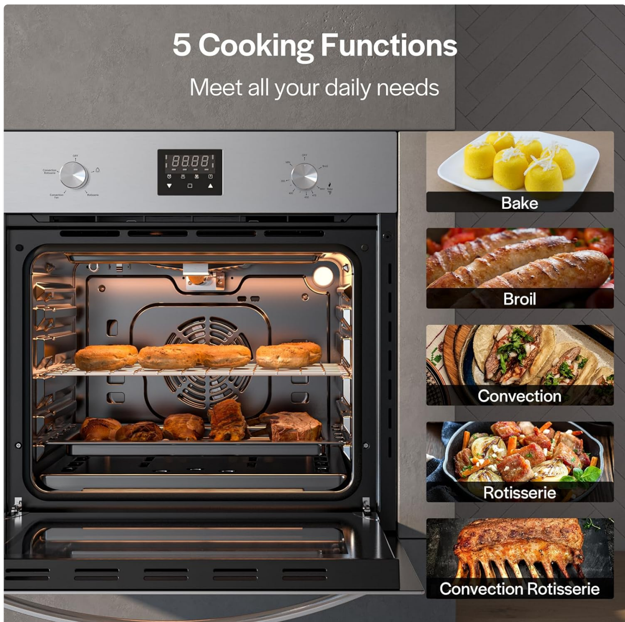
Figure 3.1: Overview of the 5 Cooking Functions.