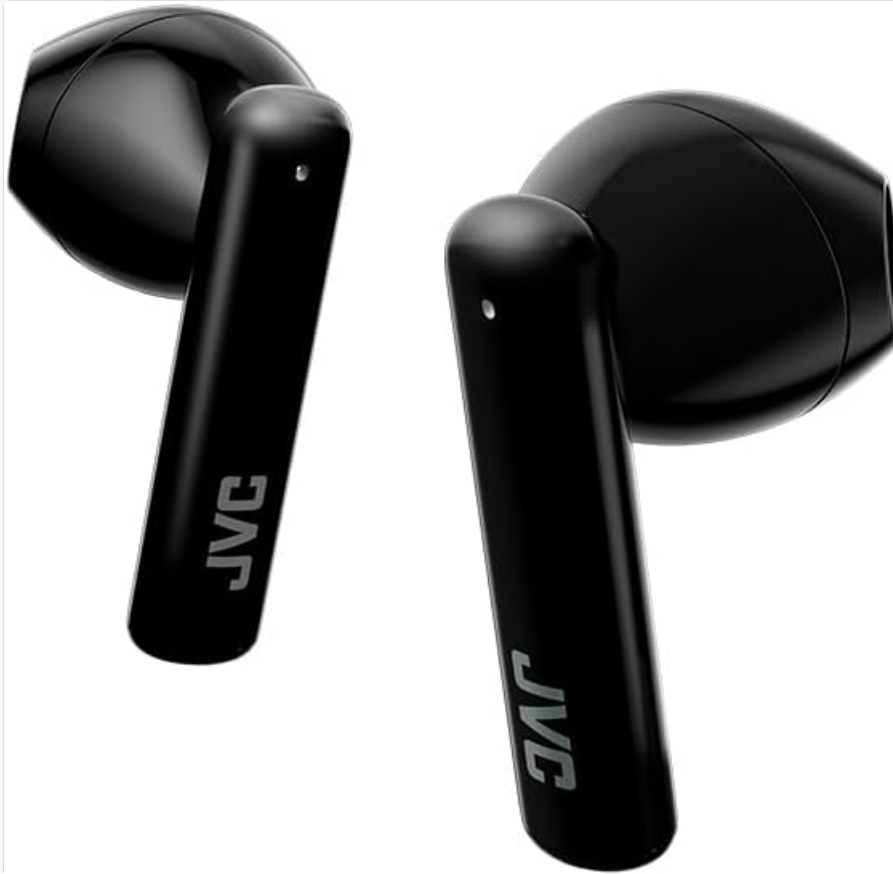
Image: The JVC HAA4TB True Wireless Earbuds, shown in black, highlighting their sleek design.