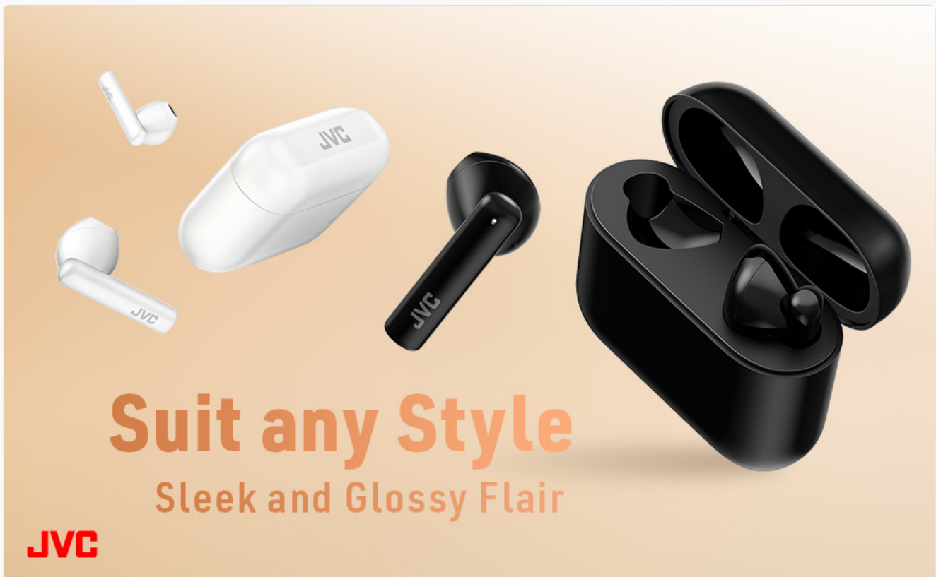
Image: The JVC HAA4TB earbuds inside their charging case, illustrating the compact and portable design.