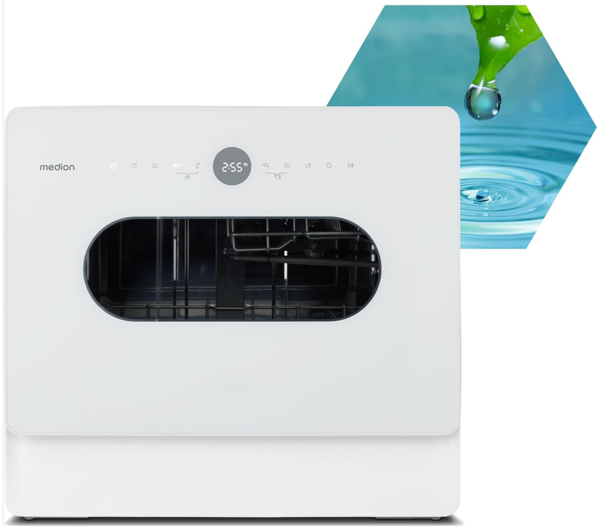
Figure 8: Illustrating the reduced water consumption of 7.8 liters per Eco wash cycle.

Solo 7,8 litri d'acqua per ciclo di lavaggio Eco