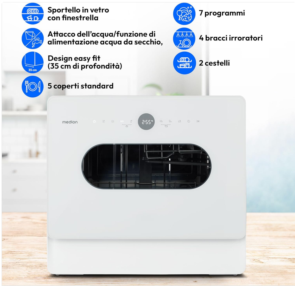
Figure 2: Overview of key features including glass door, 7 programs, bucket function, 4 spray arms, 2 baskets, and 5 place settings.