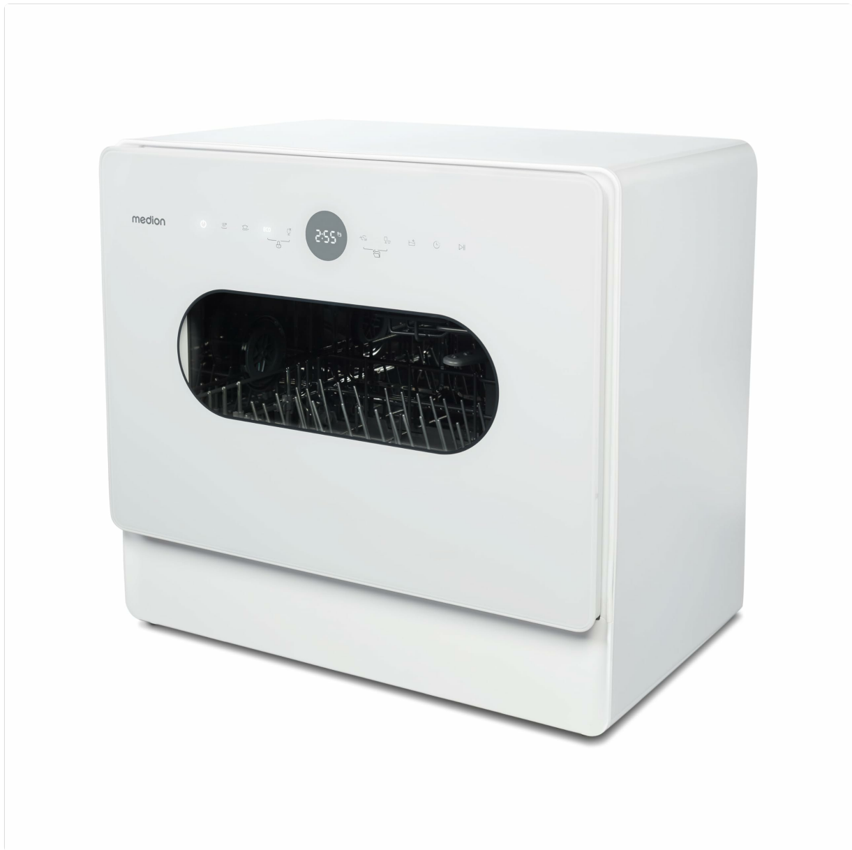
Figure 1: MEDION Mini Dishwasher DWT51, front view.