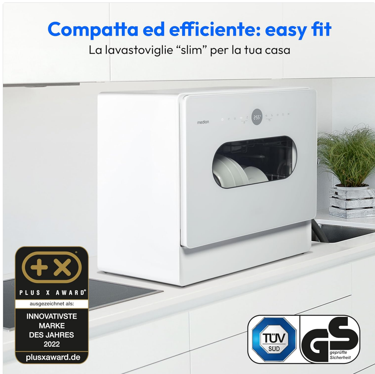
Figure 3: The MEDION Mini Dishwasher DWT51 in a kitchen setting, highlighting its compact and efficient design.

ventilation and access. The compact design allows for placement in various kitchen environments.