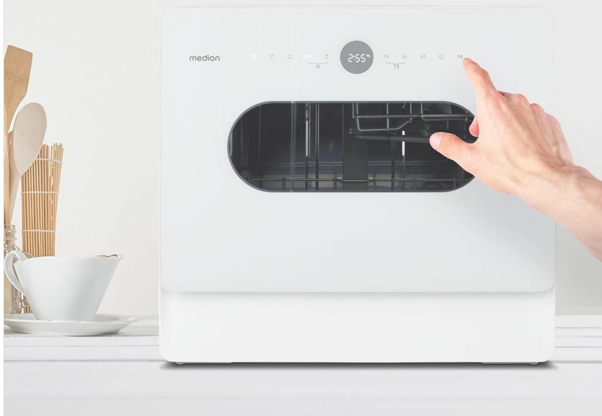
Figure 6: The intuitive touch control panel and LED display for convenient operation.

Sportello in vetro di alta qualità con display a LED e pannello touch con comandi intuitivi