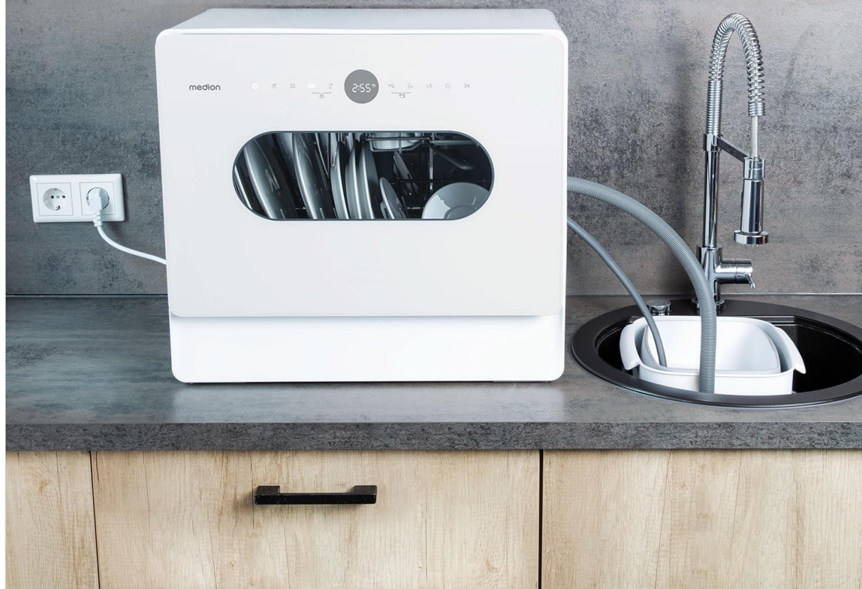
Figure 5: The dishwasher operating using the bucket function, demonstrating its independence from a fixed water supply.