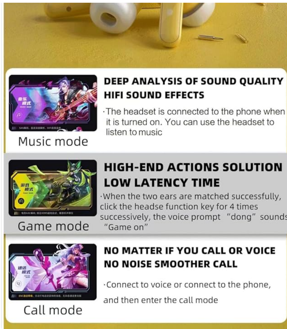
Image: Depiction of the DUDAO U16H earbuds' 360-degree stereo sound quality and different modes: Music mode, Game mode (highlighting low latency), and Call mode (emphasizing clear calls).