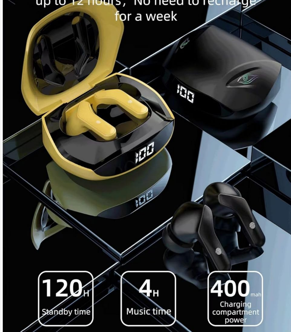
Image: Illustration of the DUDAO U16H earbuds and charging case, highlighting the long continuous listening time and battery capacity (120H standby, 4H music time per charge, 400mAh case power).

With the charging compartment you can listen to songs continuously for up to 12 hours, No need to recharge for a week