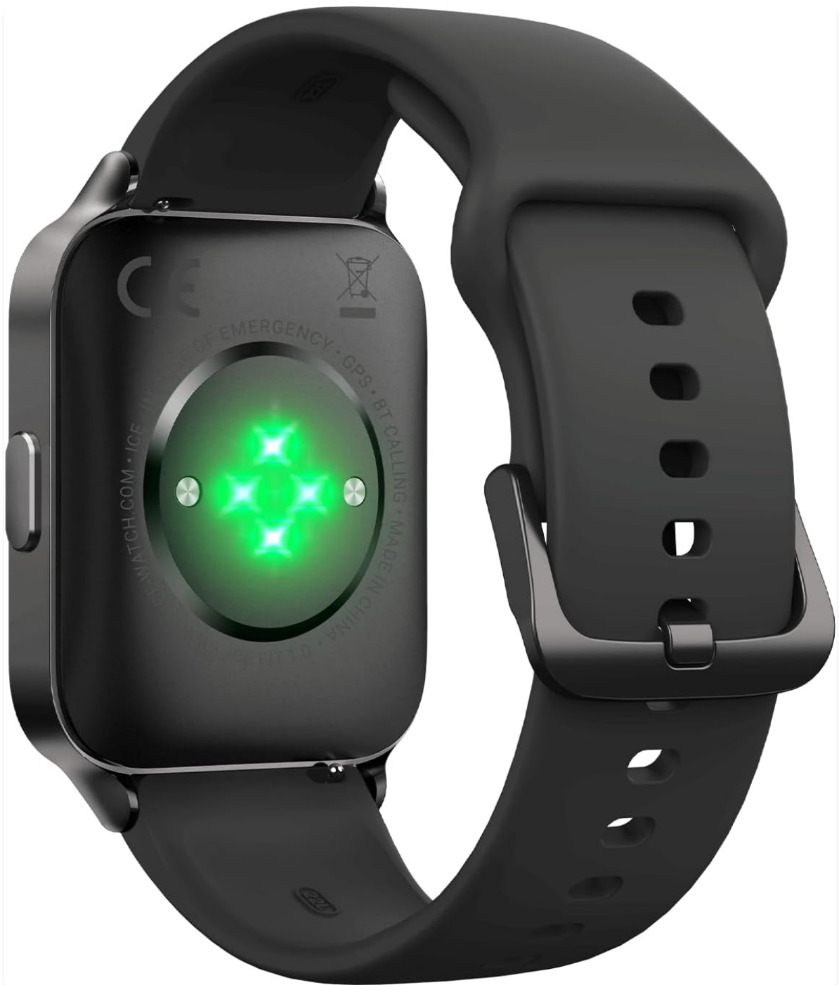
The back of the smartwatch, featuring the optical heart rate sensors.