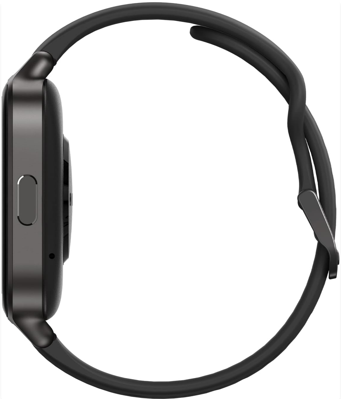
Side view of the smartwatch, highlighting the physical button and charging area.