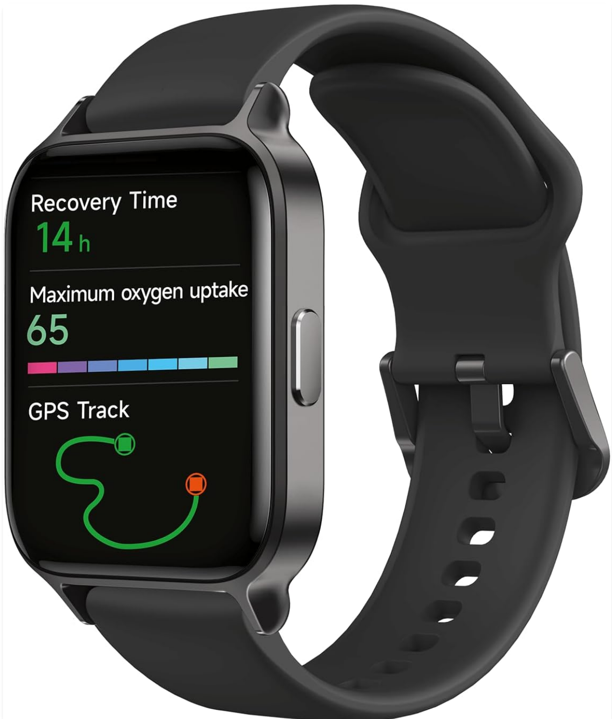
The smartwatch display showing fitness metrics like recovery time and GPS tracking.