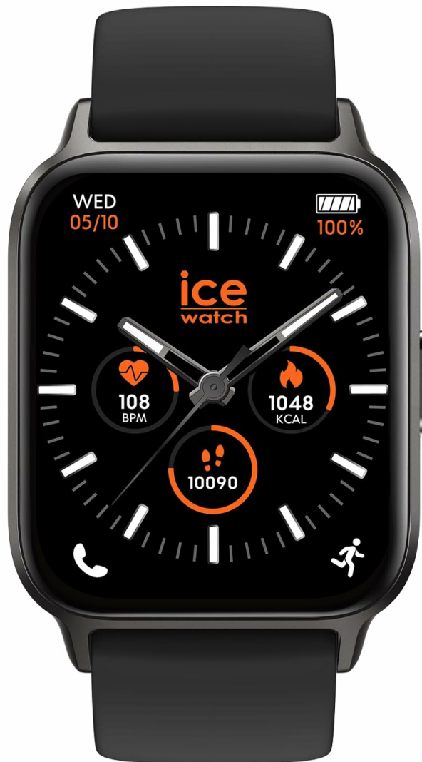
Front view of the Ice-Watch ICE fit 1.0 Black AMOLED Smartwatch.