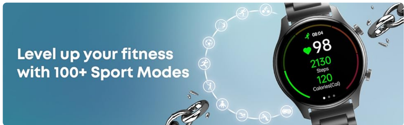
Image: The Fastrack Astor FR2 Pro displaying fitness data, surrounded by icons representing over 100 sport modes.