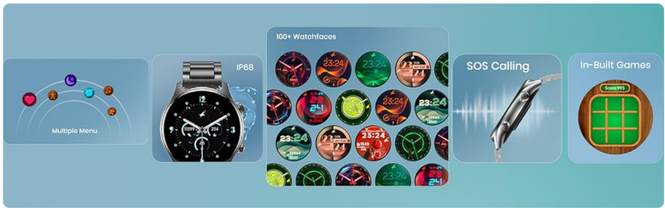
Image: A collage showing multiple menu options, IP68 rating, various watch faces, SOS Calling, and in-built games on the Fastrack Astor FR2 Pro.