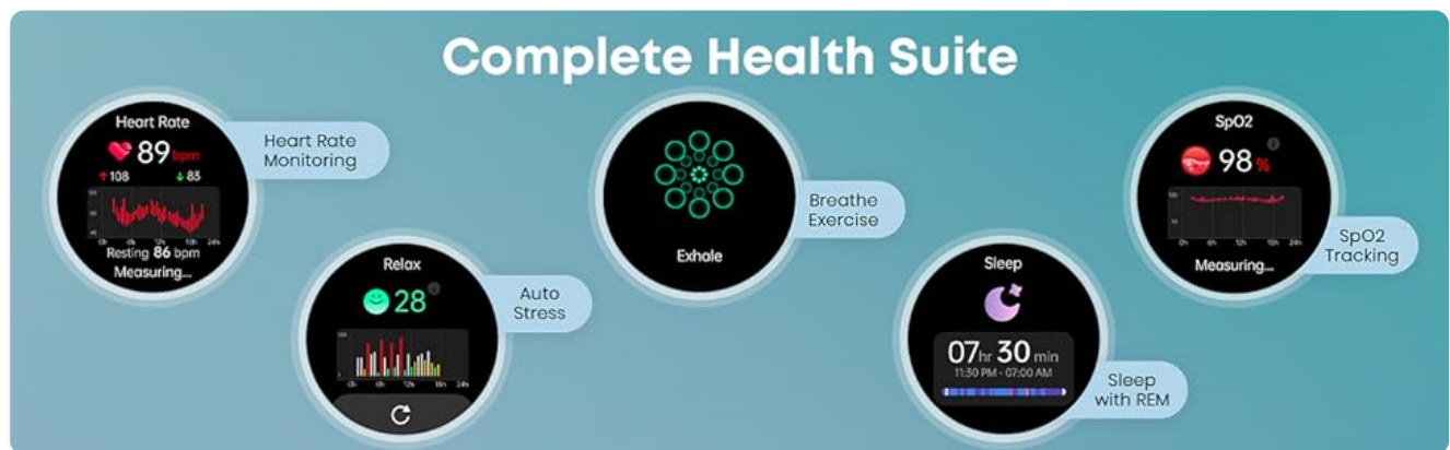
Image: Visual representation of the Fastrack Astor FR2 Pro's complete health suite, including Heart Rate Monitoring, SpO2 Tracking, Breathe Exercise, Auto Stress, and Sleep with REM.