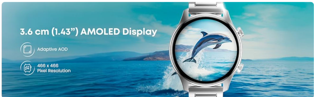
Image: The 1.43-inch AMOLED display of the Fastrack Astor FR2 Pro, showcasing its adaptive AOD and 466x466 pixel resolution.