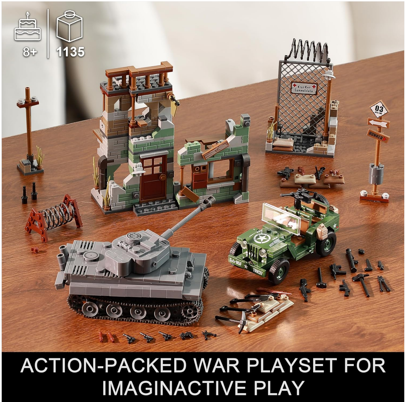
Figure 4: The set is designed for action-packed imaginative play.