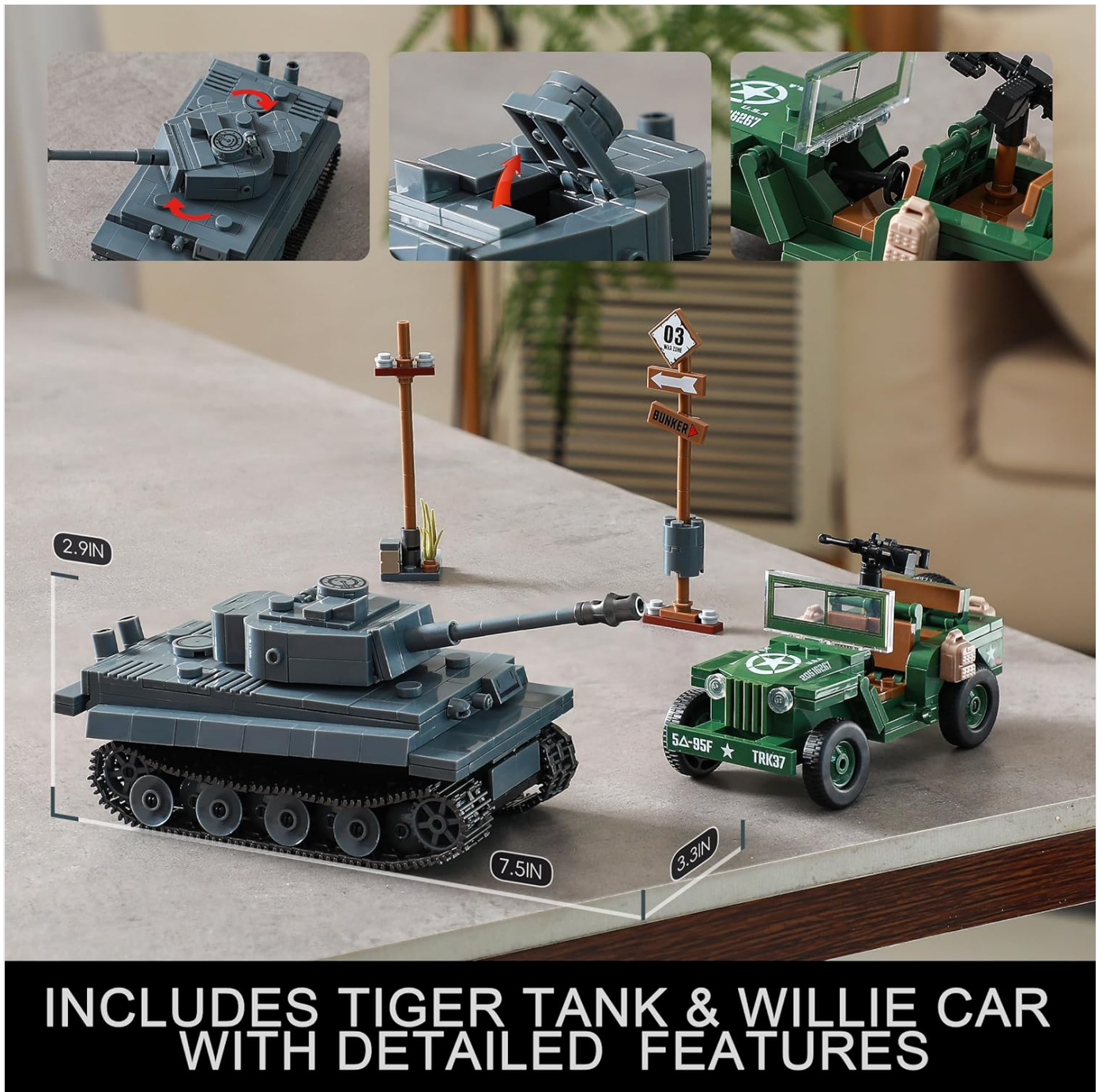
Figure 6: Product dimensions and detailed features of the tank and jeep.