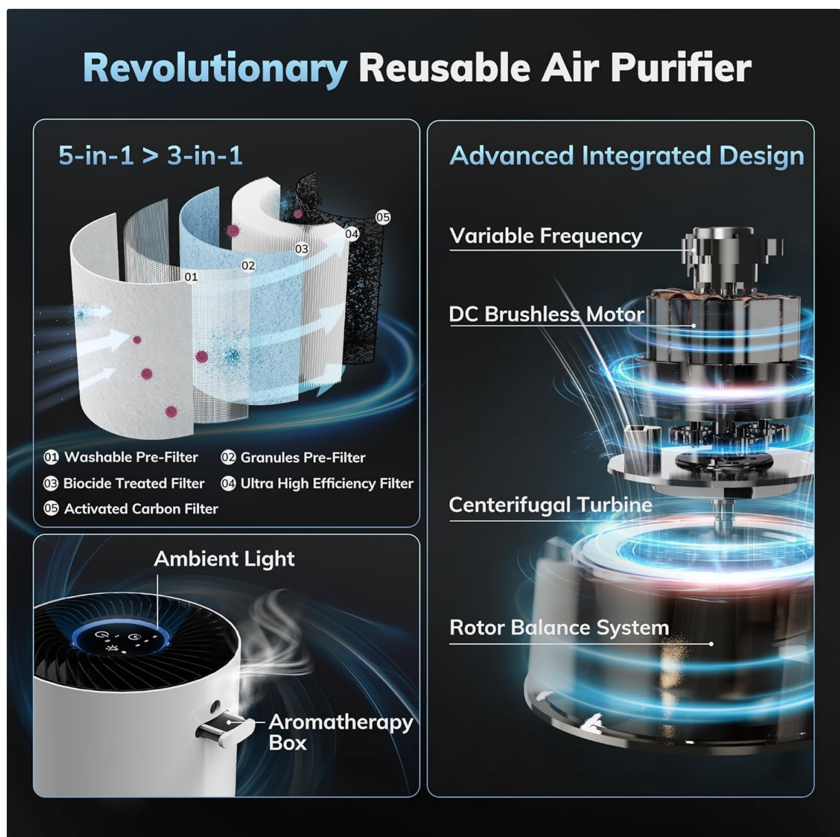
Image 2.2: Diagram illustrating the 5-in-1 filter, DC brushless motor, centrifugal turbine, aroma box, and ambient light features.