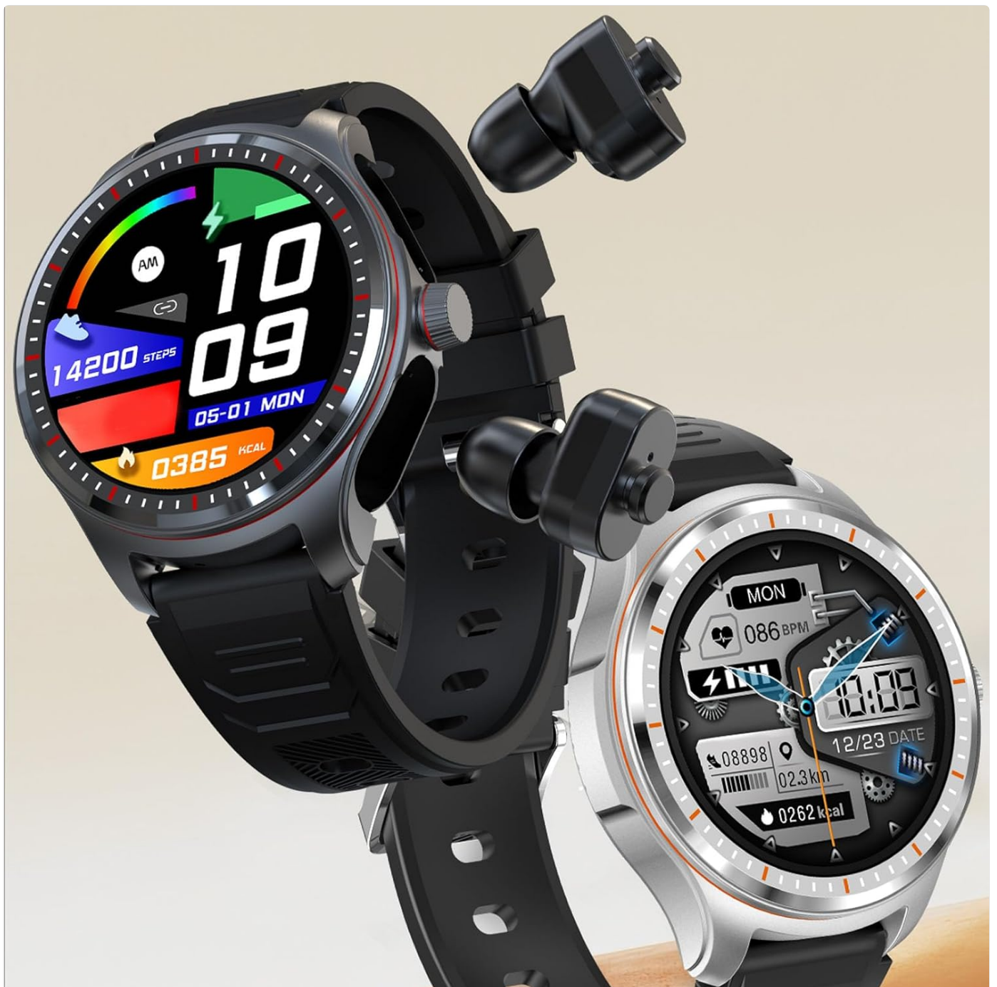
Figure 3: The smartwatch with its integrated earbuds, shown both attached and detached from the watch.