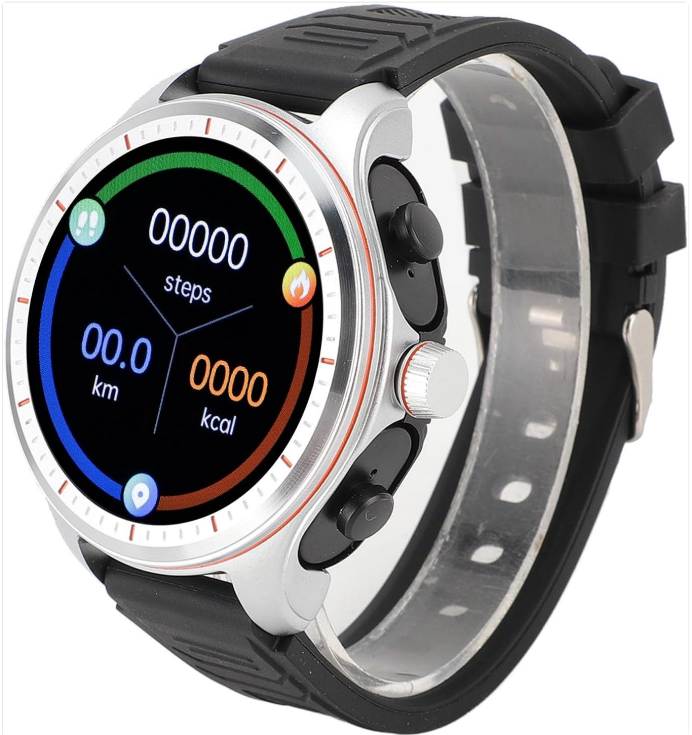
Figure 2: Front view of the smartwatch displaying fitness metrics like steps, distance, and calories burned.