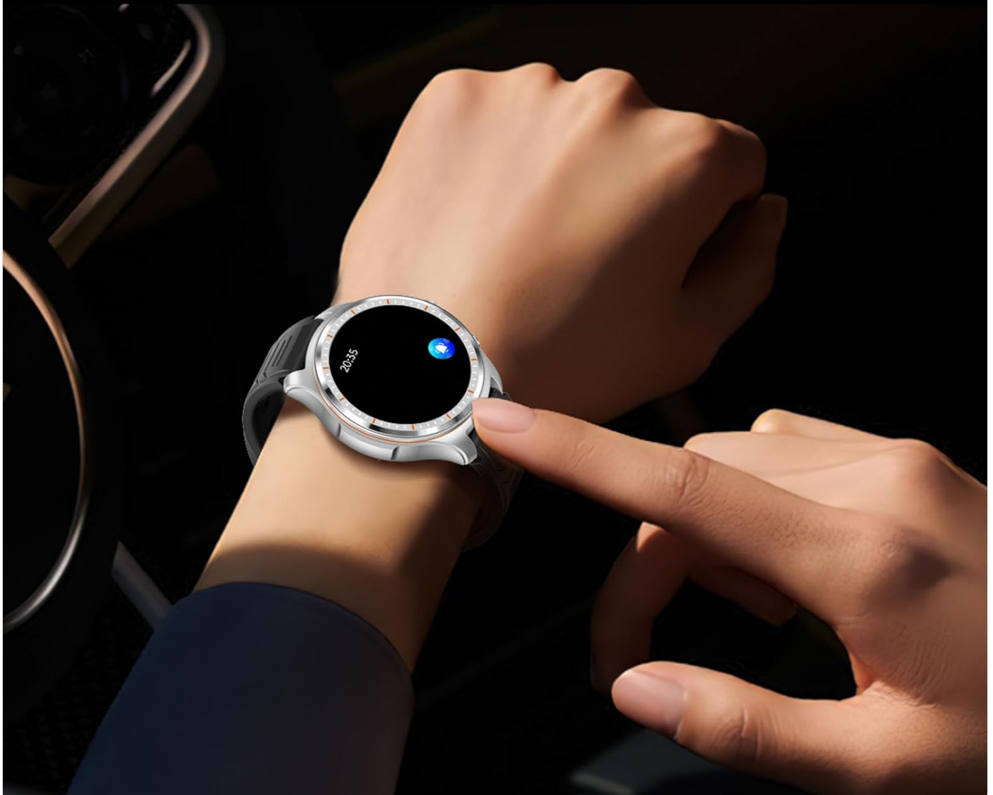
Figure 7: A user interacting with the smartwatch, demonstrating its touch control for various functions including sports modes.

Sensitive touch control, can control the watch, touch to control music playback, switching songs, etc.