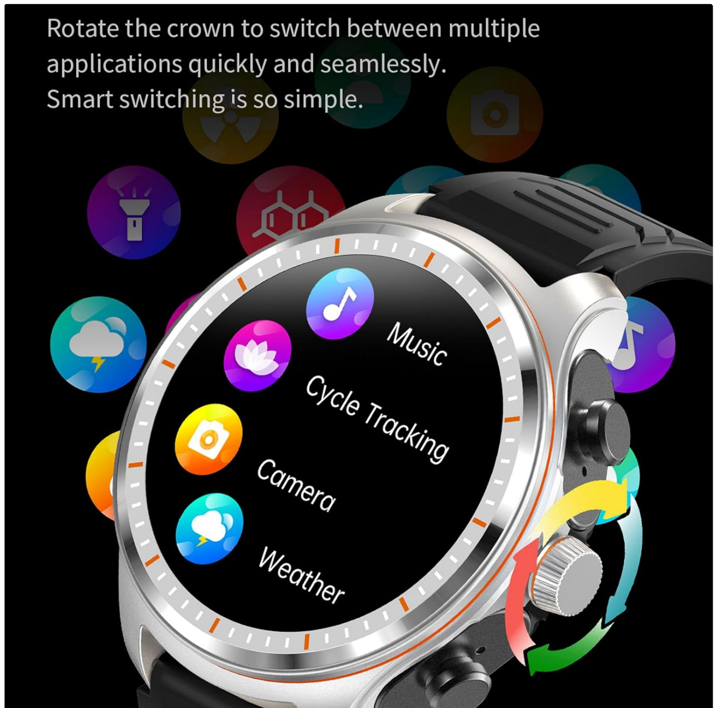
Figure 5: The smartwatch display showing various application icons and an illustration of how to use the rotary crown for navigation.