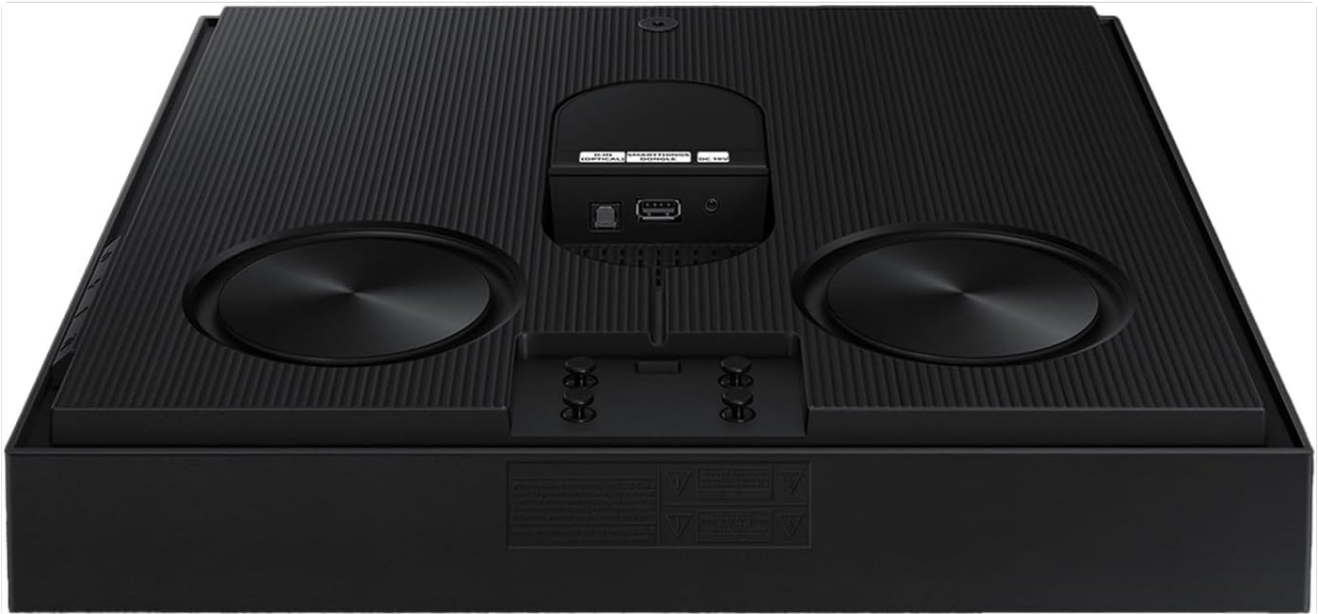
Figure 4.1: Rear Panel Connections