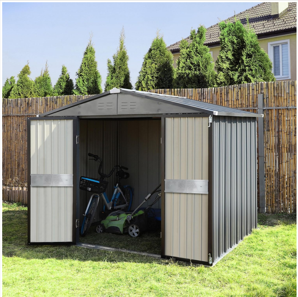
Image 2.1: VEIKOU 8x10FT Outdoor Storage Shed with doors open, showcasing its spacious interior.