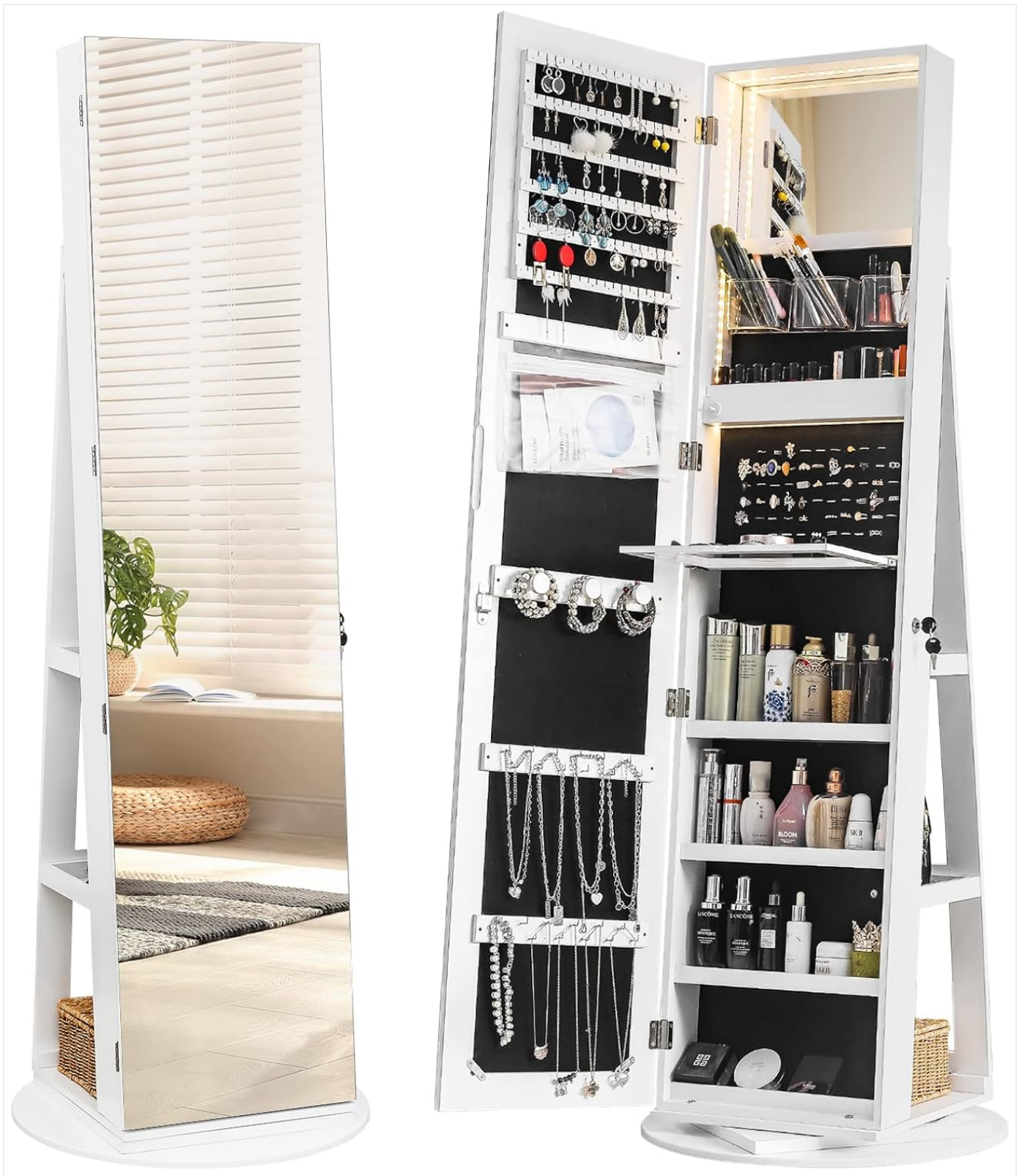
Figure 1: Overview of the Generic Full Length Mirror Jewelry Cabinet, showcasing its full-length mirror and internal storage compartments when opened.