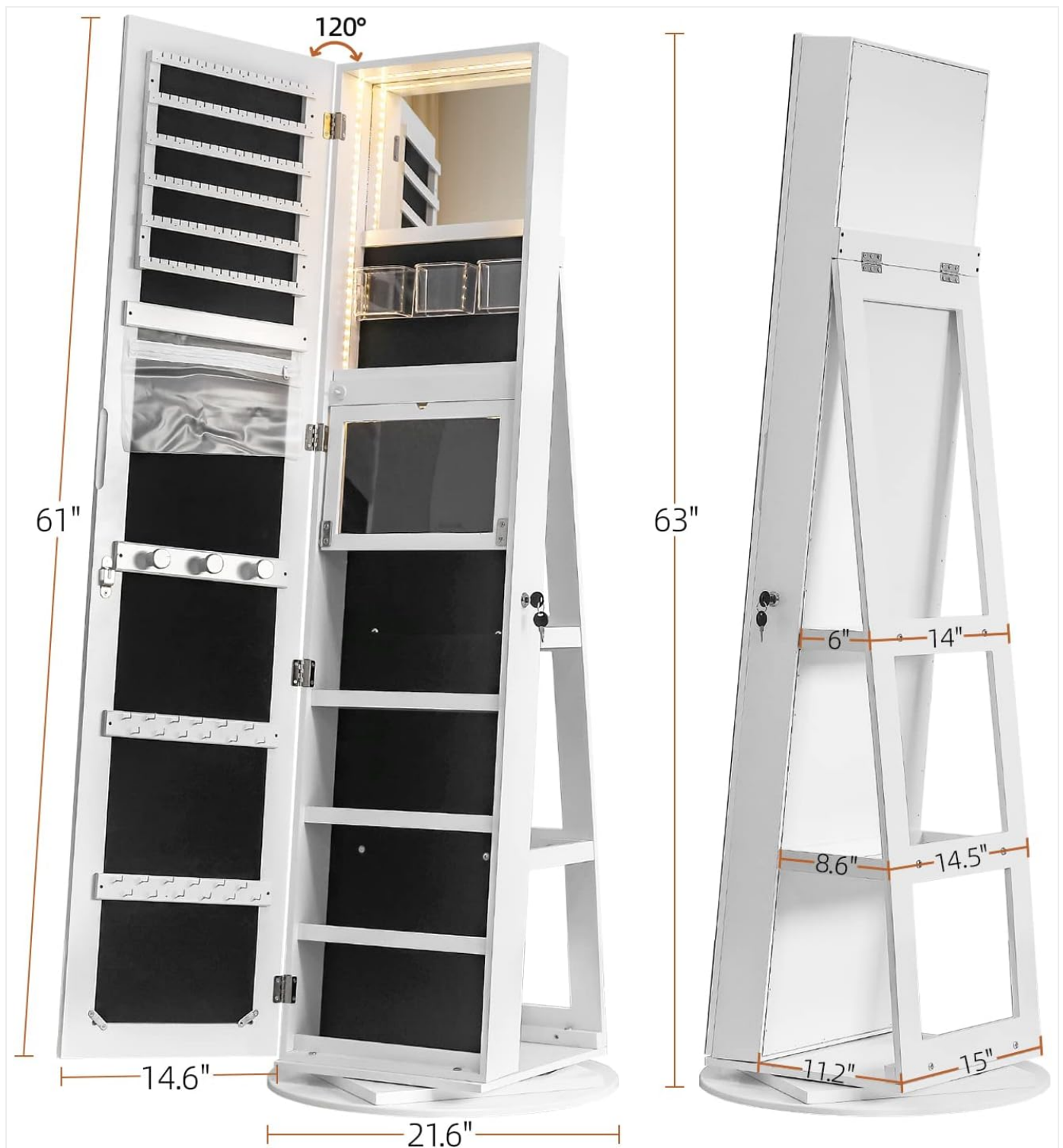
Figure 3: Dimensional view of the cabinet, illustrating its overall height, width, and depth, along with internal shelf measurements.

Important Note: Ensure the installation is not overly tight initially to facilitate easy adjustment. After the structure is complete, firm all interfaces for optimal stability.