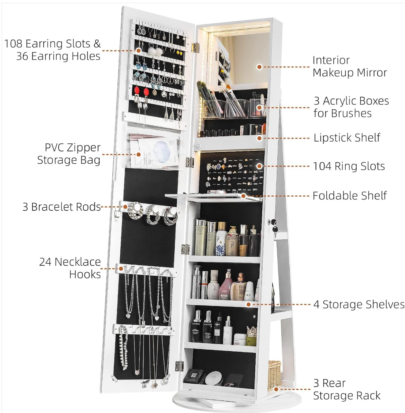
Figure 6: Internal layout of the cabinet, detailing the specific storage areas and their capacities.