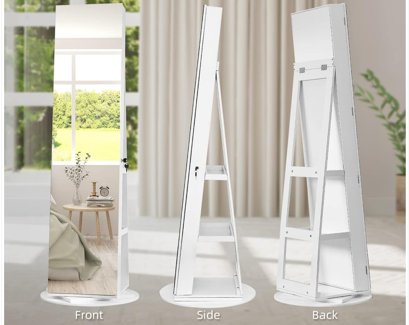
Figure 2: The 3-in-1 design of the cabinet, showing its front mirror, side profile, and rear storage shelves.

Full Length Mirror + Jewelry Cabinet + Storage Shelves