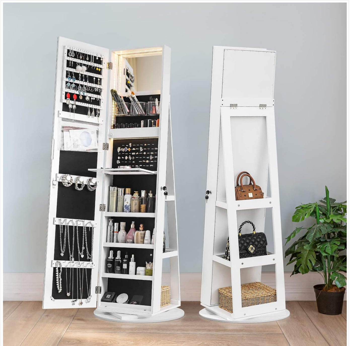
Figure 5: The cabinet opened, showing the extensive internal organization and the external storage shelves.