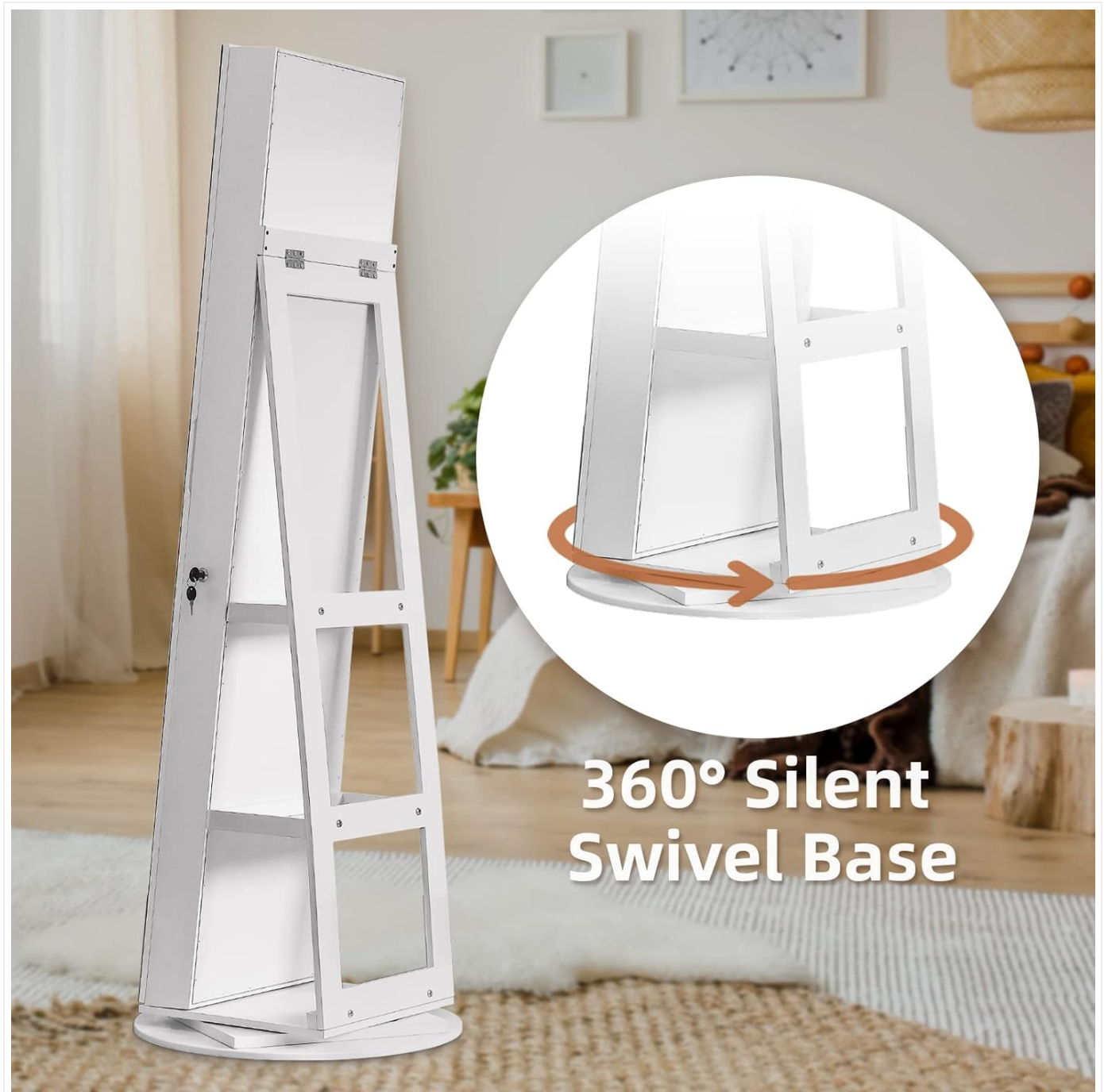
Figure 4: Illustration of the 360° silent swivel base, highlighting its rotational capability.

desired position. This feature enables easy access to the full-length mirror, the internal jewelry storage, and the external storage shelves from any angle.