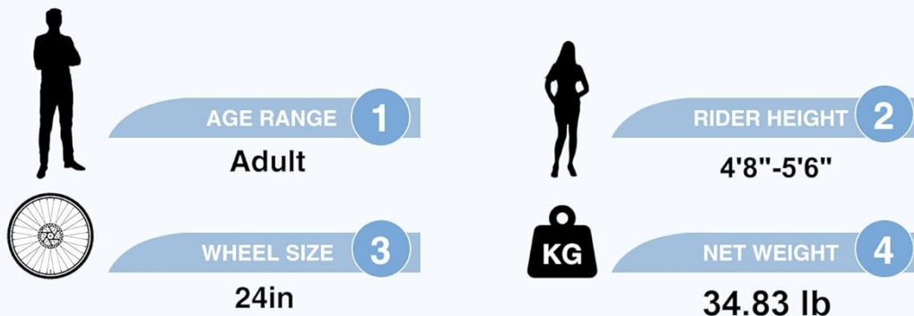
Image 7.2: Rider height guide for the 24-inch ZUKKA Beach Cruiser Bike.