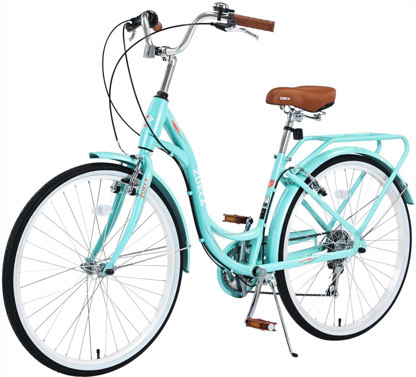
Image 1.1: Overview of the ZUKKA 24-inch Beach Cruiser Bike in Cyan.