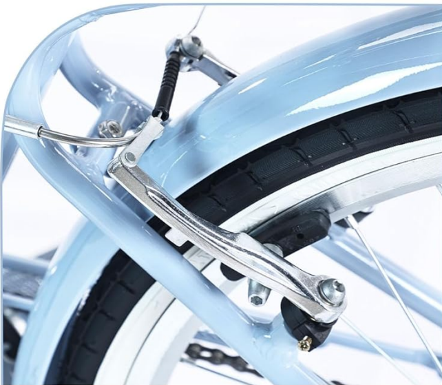
Double V Brakes, More Secure