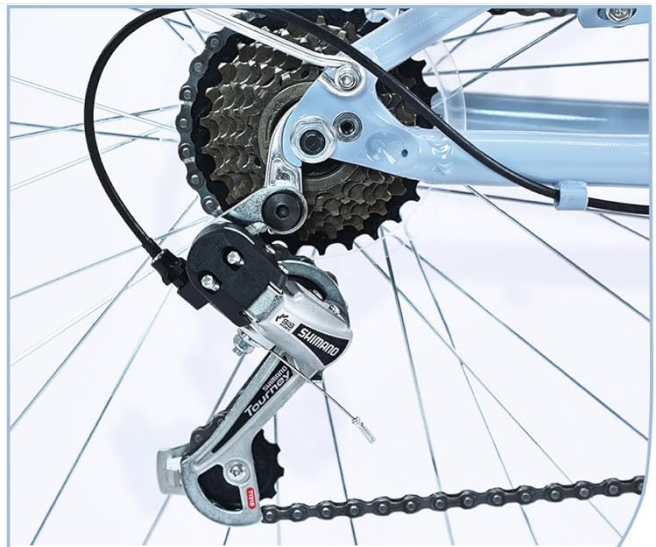
Shimano 7 Speed Derailleur, Smoother Gear Changes