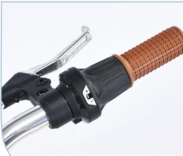
Shimano 7 Speed Shifter, Smoother Gear Changes