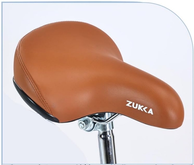
Leather Comfortable Saddle and Cushion