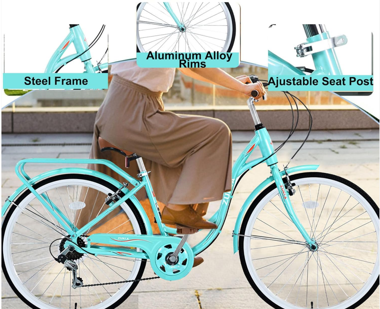
Image 4.3: The adjustable seat post allows for personalized rider comfort.

Ladies bike for women combines the features of a comfort bike and a commuter bicycle