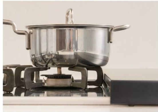
Image: A visual representation of the cover's low profile, approximately 3.5cm in height, illustrating how it provides ample clearance for cookware during use.