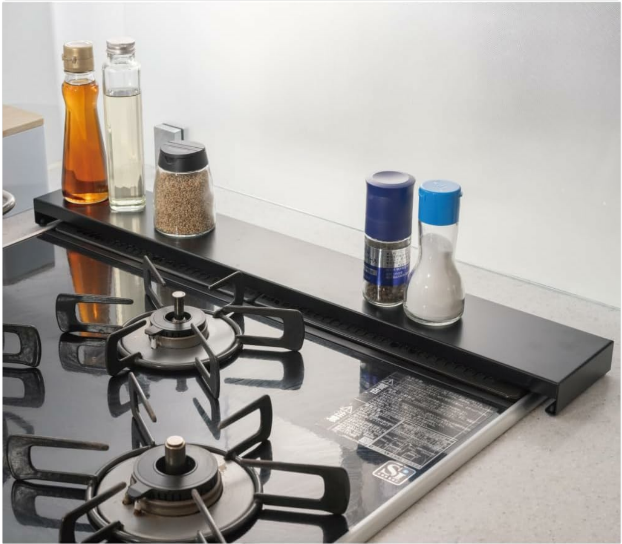
Image: The exhaust vent cover installed behind a stove, utilized as a storage shelf for various kitchen items like oil bottles and spice shakers.