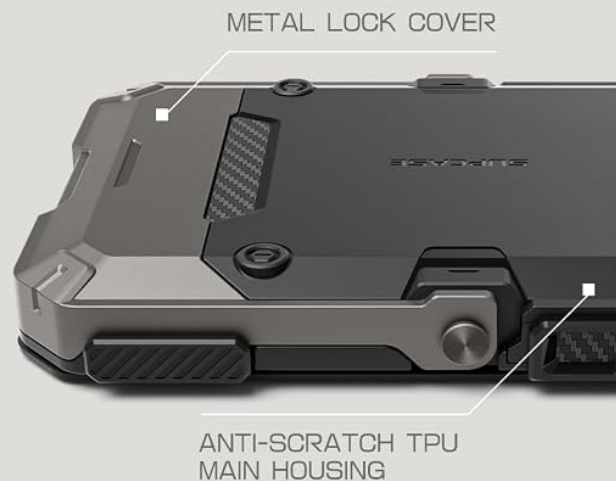
Figure 4: Illustrates the card storage capacity and the metal lock cover for security.

Built-in metal lock cover protects cards from losing and scratches. It also works as a kickstand.