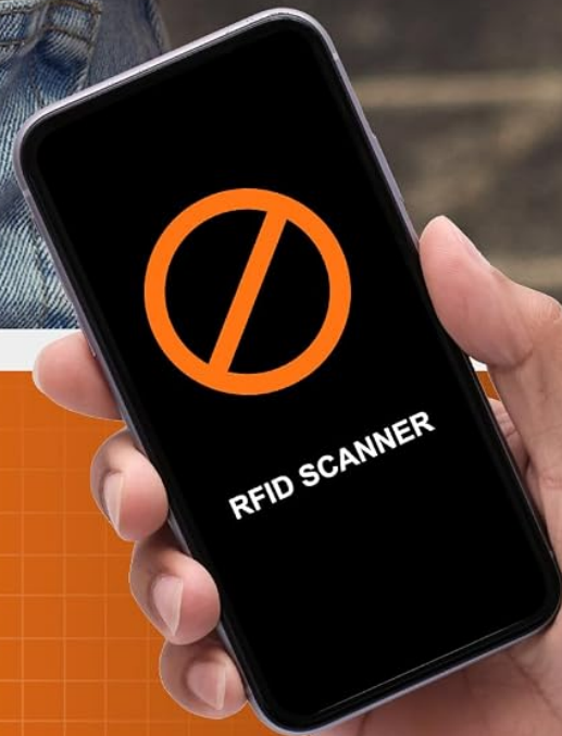
Figure 5: The RFID blocking technology in action, protecting your card information.