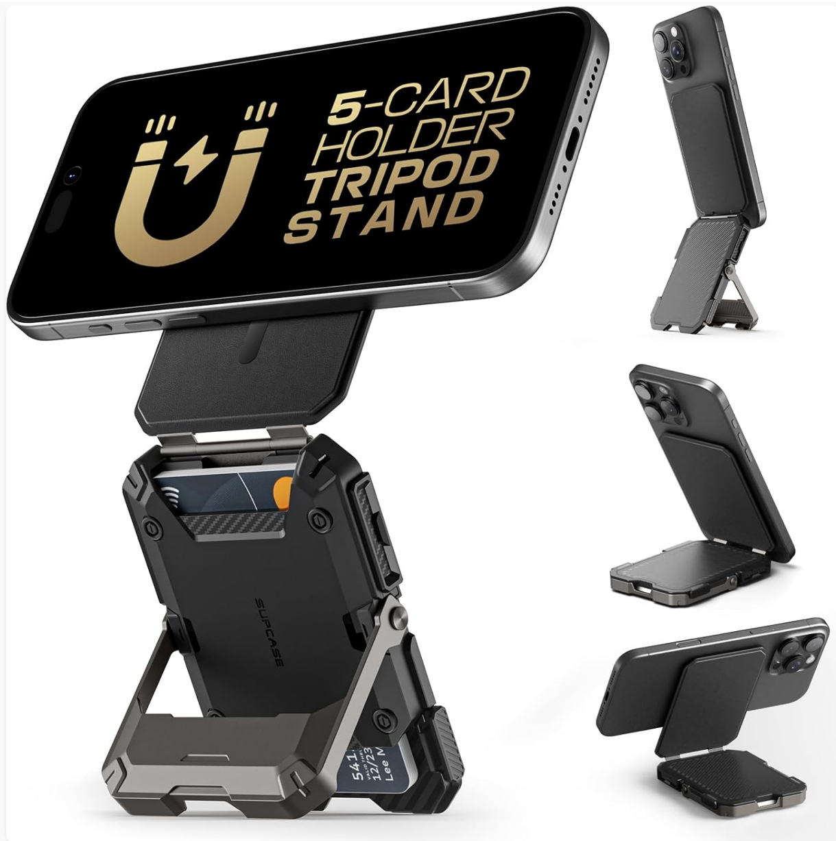
Figure 1: Overview of the SUPCASE MagSafe Wallet with Stand, highlighting its wallet and stand capabilities.