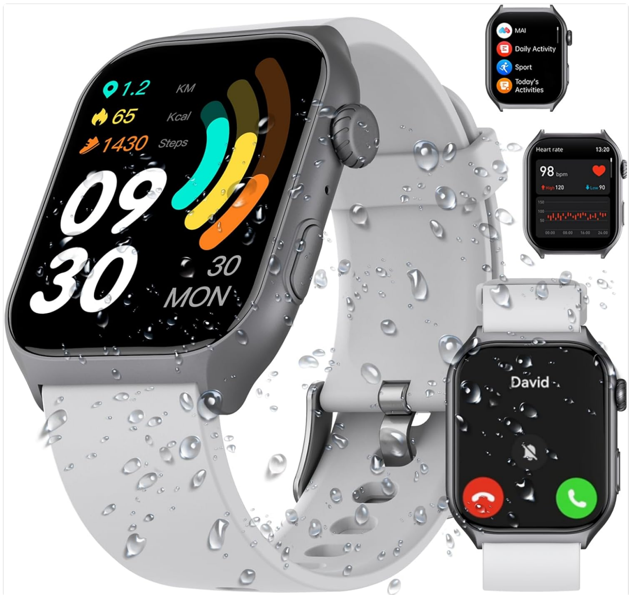
Image: The ION Digital Watch displaying the time, steps, calories, and distance. This image illustrates the main watch face and its compatibility with Android and iOS devices.