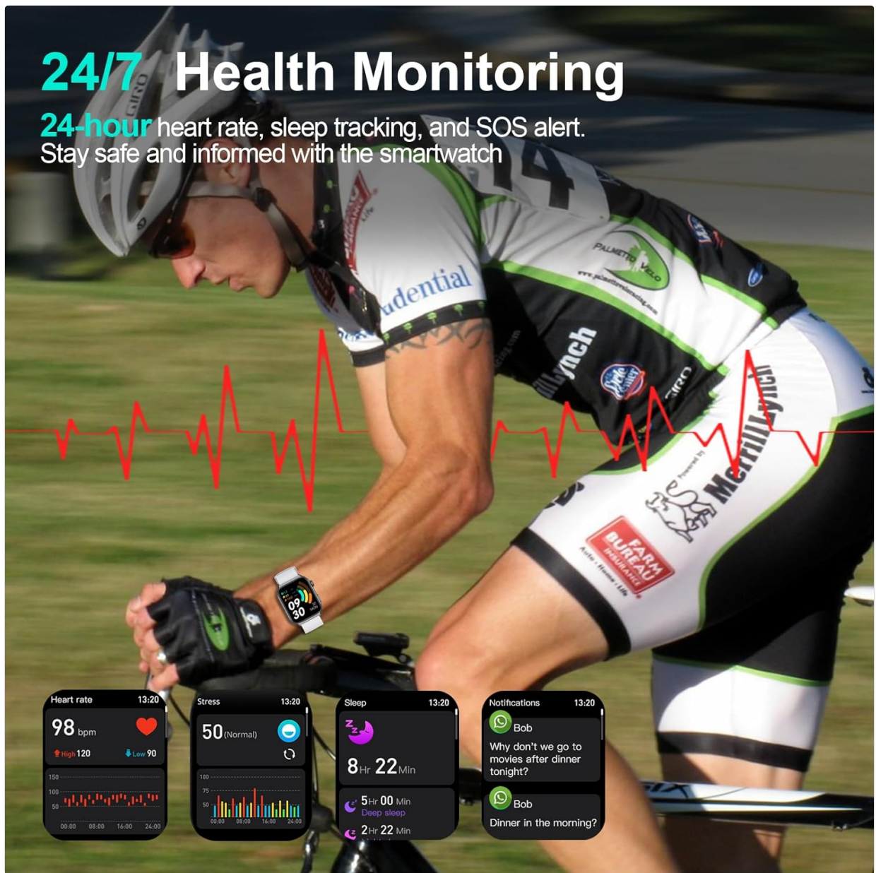
Image: A person cycling while wearing the ION Digital Watch, which displays heart rate data on its screen.

24-hour heart rate, sleep tracking, and SOS alert. Stay safe and informed with the smartwatch