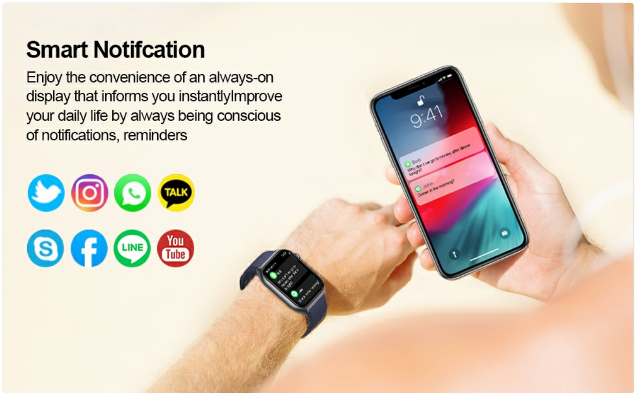
Image: A person wearing the ION Digital Watch, which shows various app notifications, while holding a smartphone also displaying notifications.