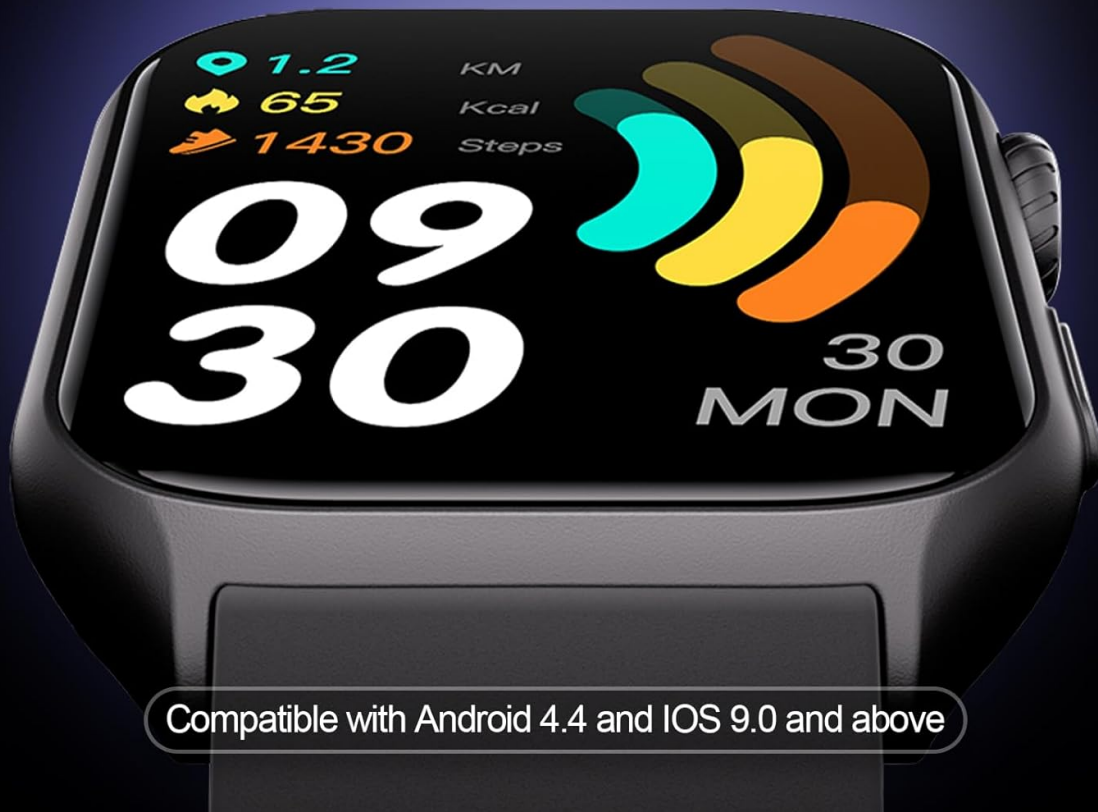
Image: A close-up view of the ION Digital Watch's 2-inch HD color screen, highlighting its clear display and touch interface.