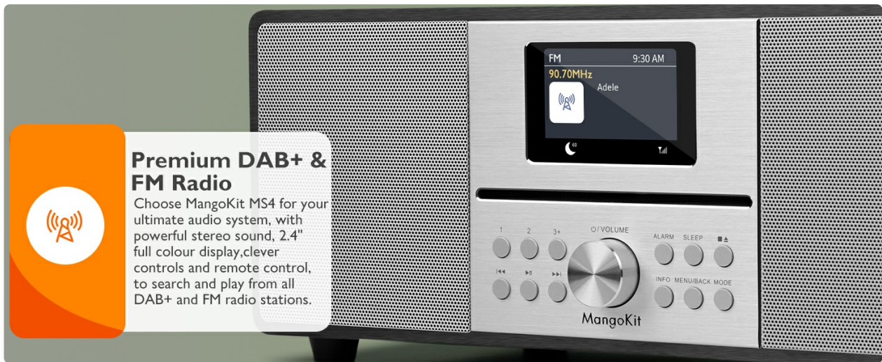
Image: A close-up of the MangoKit MS4 display showing FM radio tuning information, indicating its premium radio capabilities.