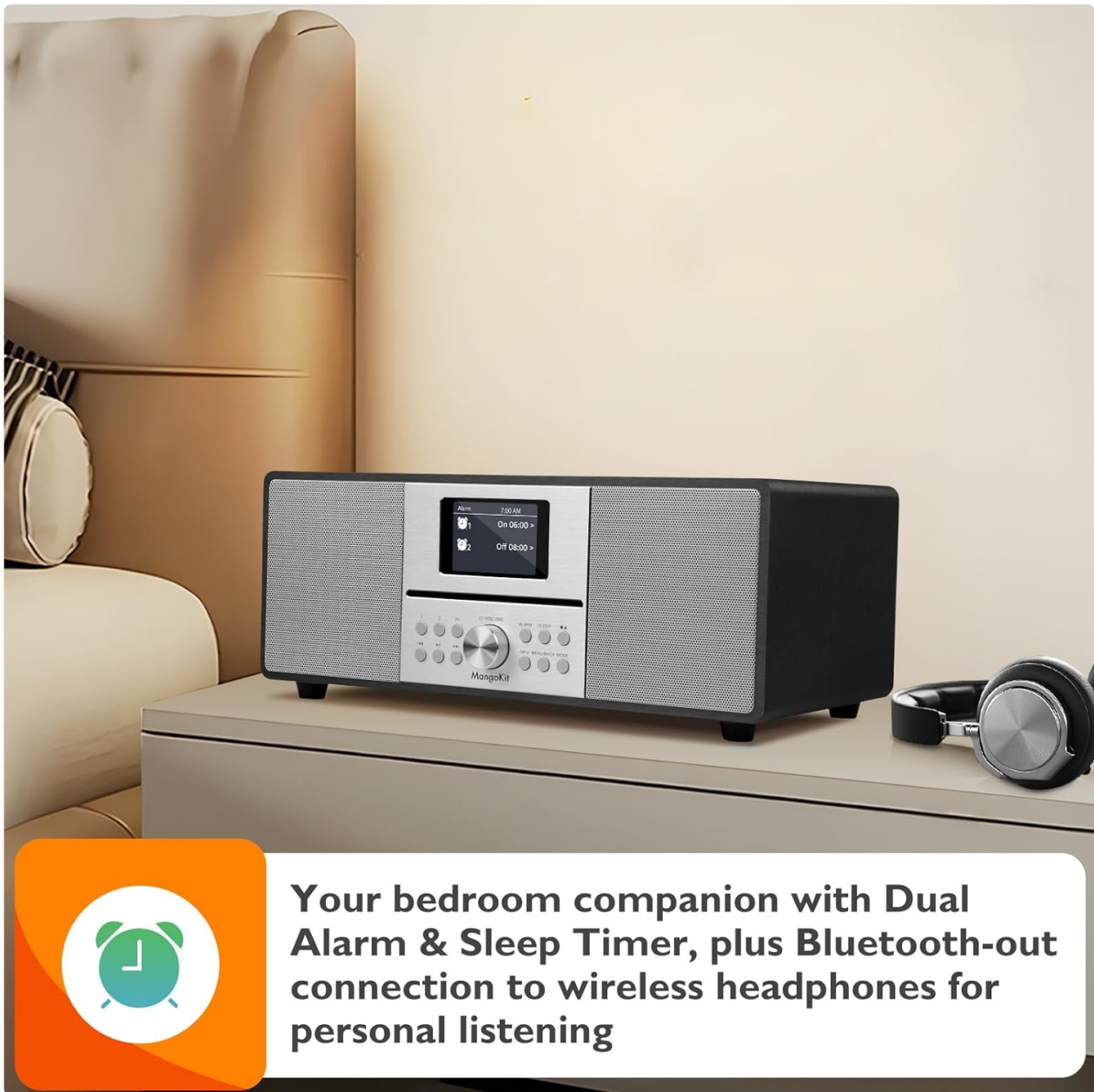
Image: The MangoKit MS4 on a bedside table, illustrating its use as a bedroom companion with alarm and sleep timer functions, and Bluetooth-out for headphones.