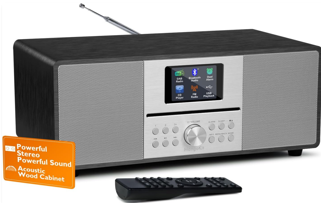
Image: The MangoKit MS4 CD Player HiFi System, showcasing its metallic black finish, front display, controls, and included remote control.

This manual provides detailed instructions for the setup, operation, and maintenance of your MangoKit MS4 CD Player HiFi System. Please read this manual thoroughly before using the device to ensure proper functionality and to maximize your listening experience. The MS4 is a versatile audio system featuring FM radio, CD playback, Bluetooth connectivity, USB, and AUX inputs, all housed in an acoustic wood cabinet with powerful stereo sound.