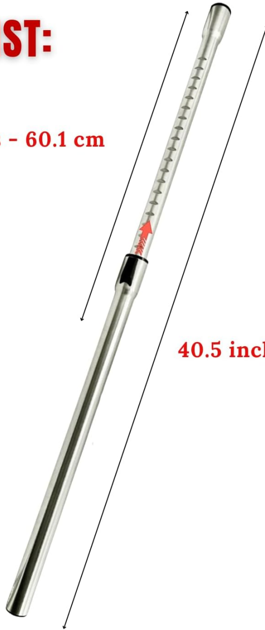
Image 2.3: Visual representation of the wand's minimum and maximum lengths.