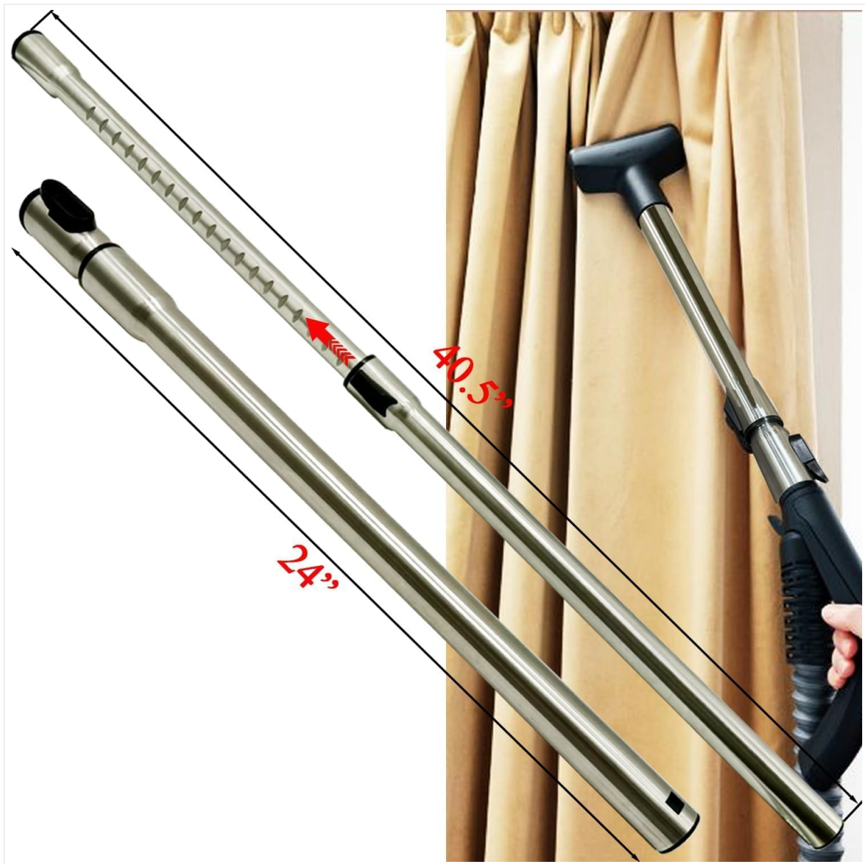
Image 3.2: This non-electric wand is not compatible with electric brush heads or hoses that require electrical power.