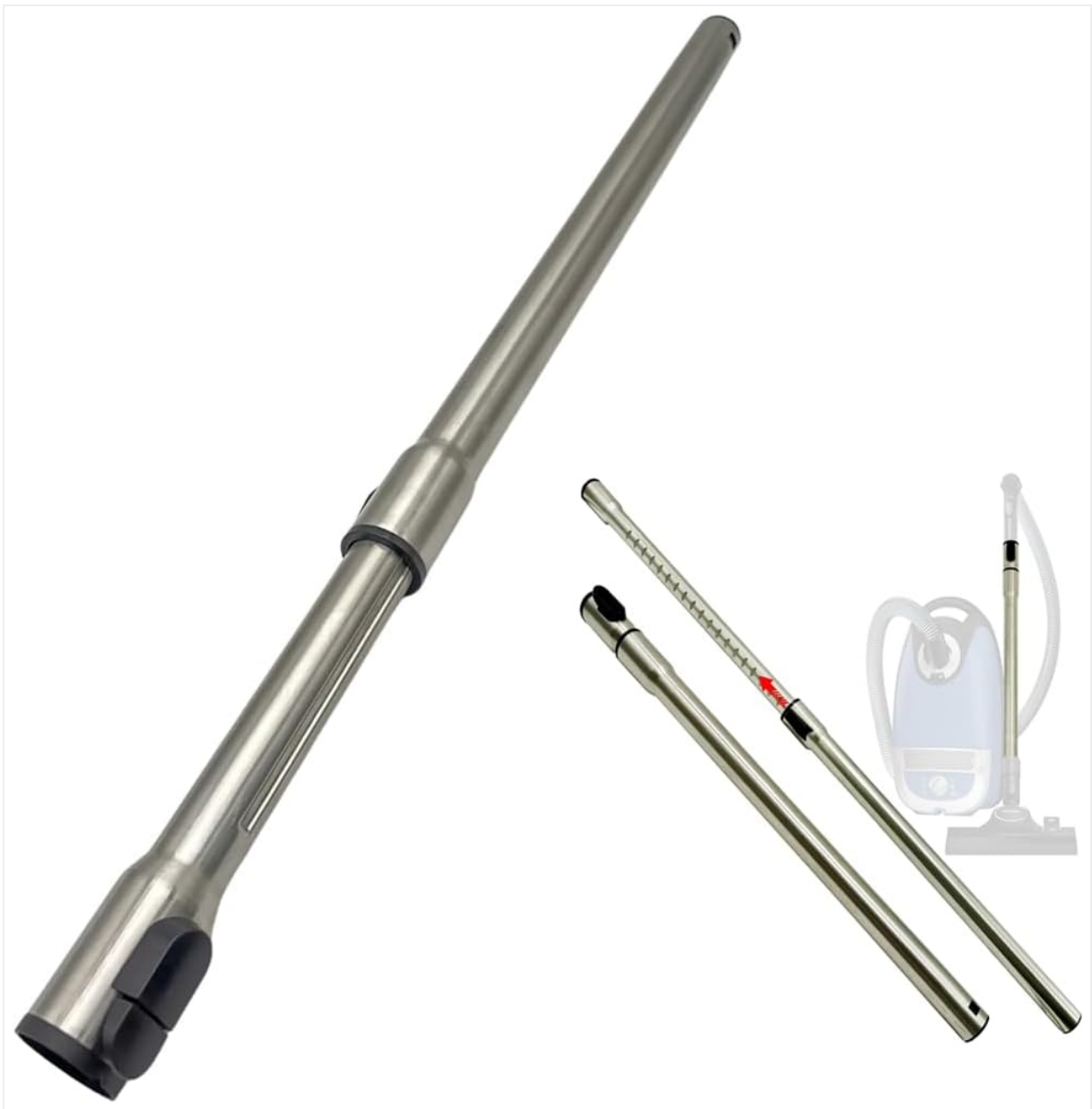
Image 2.1: Overall view of the VACEXT Non-Electric Extension Wand.