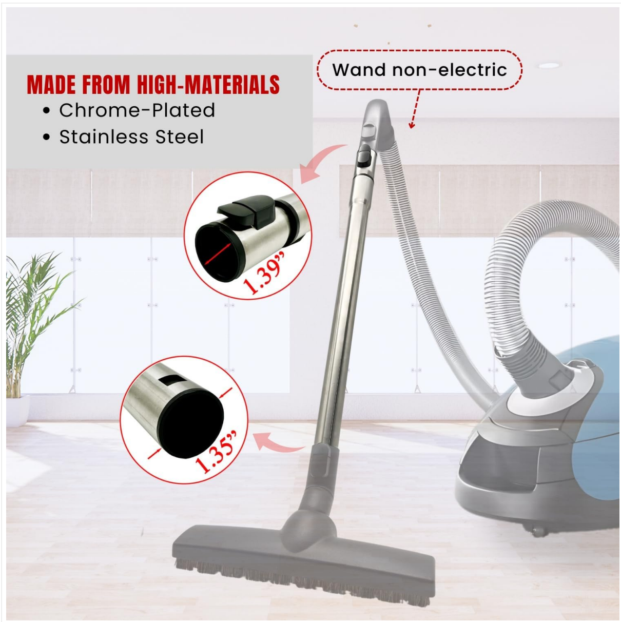
Image 3.1: The wand is compatible with Miele C1, C2, and C3 series vacuum cleaners.