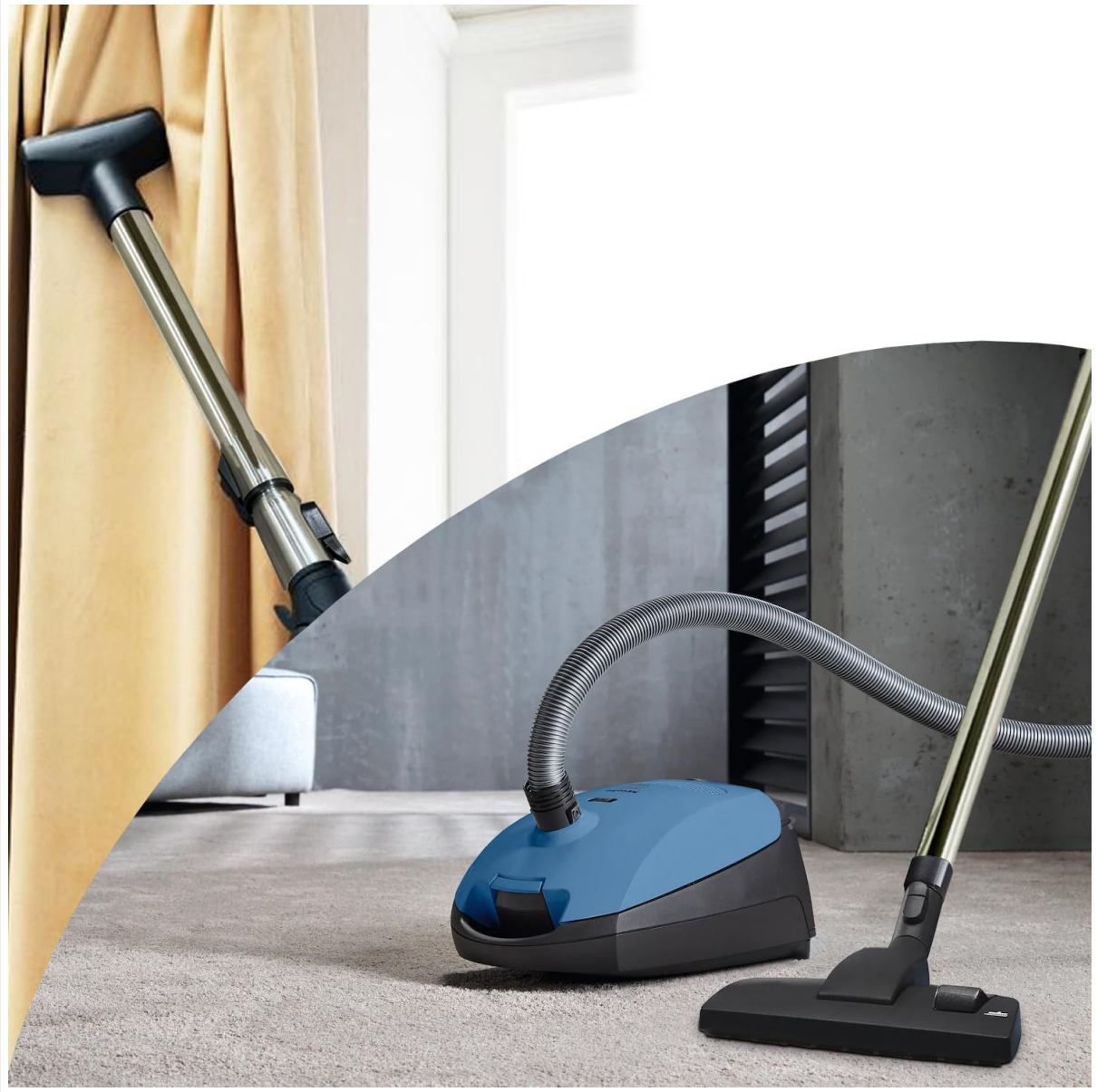
Image 5.1: The extension wand provides extended reach for cleaning high areas like curtains.