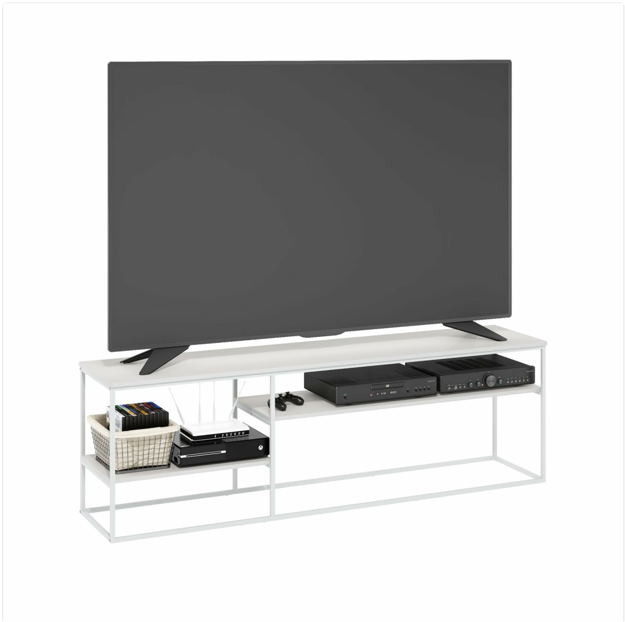
Image: The Furinno Moretti TV Stand in solid white, showcasing its 3-tier design with a television and various media devices placed on its shelves.