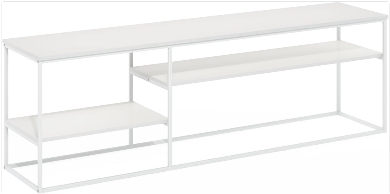
Image: An overhead view of the TV stand, illustrating the layout of its shelves and frame, useful for identifying components.