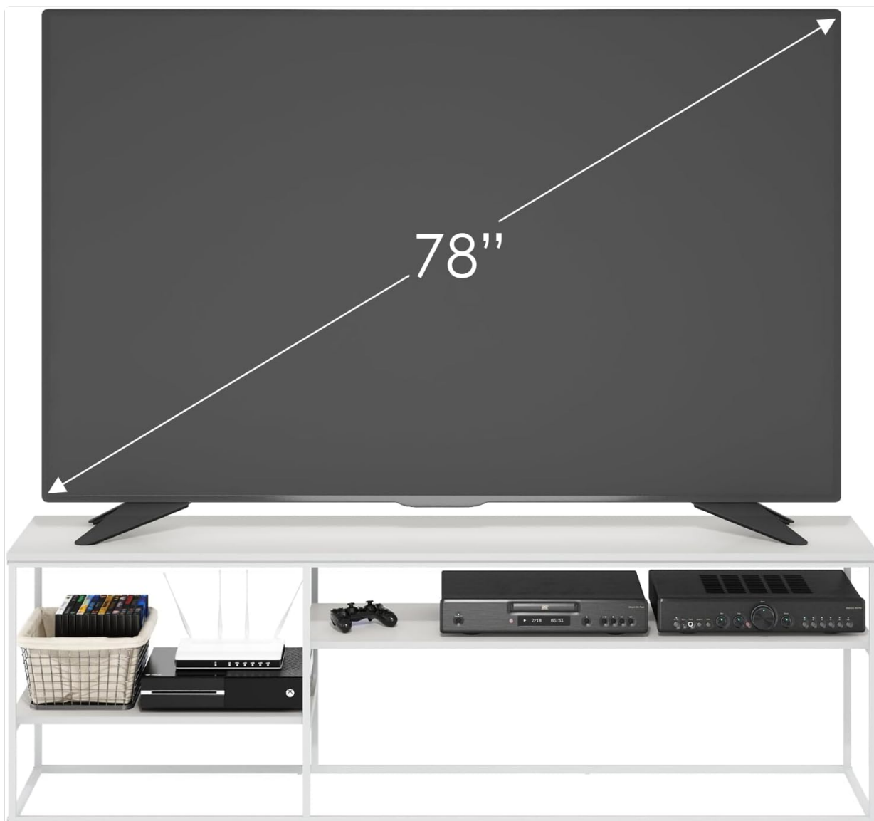
Image: The TV stand shown with a large television, indicating its capacity for TVs up to 78 inches (note: product description states up to 70 inches for this specific model, please refer to specifications for exact model compatibility).