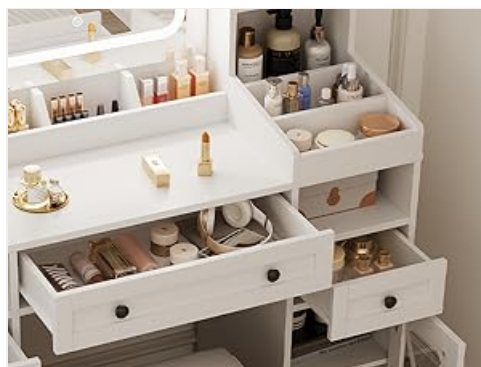
Figure 5.4: Adjustable Shelf Mechanism