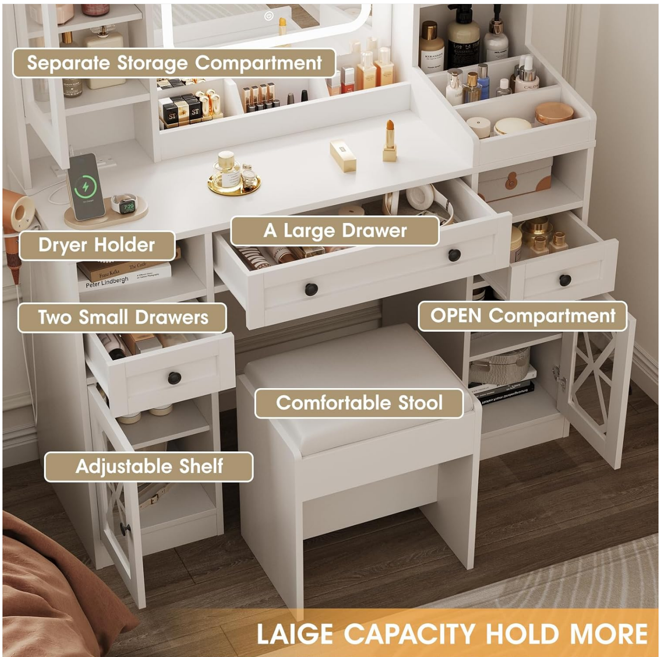
Figure 5.3: Vanity Desk Storage Features