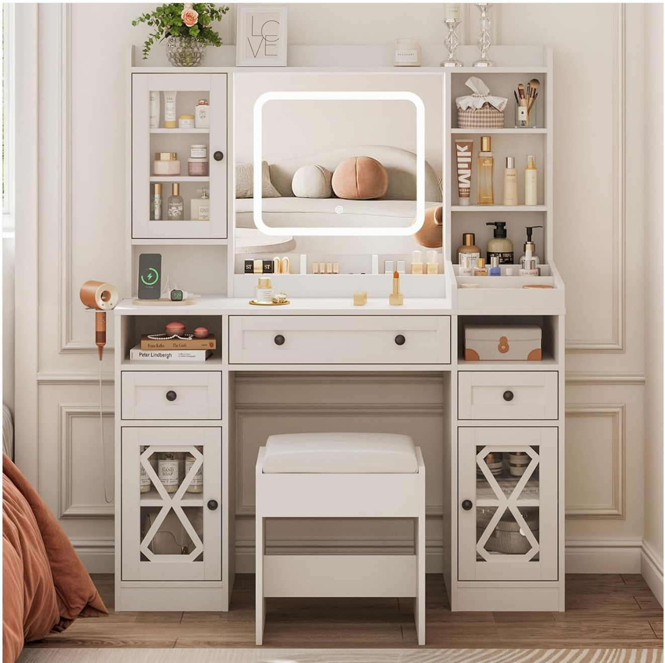
Figure 1.1: Maupvit 44.5" W Vanity Desk (Model JY9839BS01)