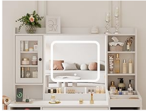
Figure 5.2: Built-in Power Strip