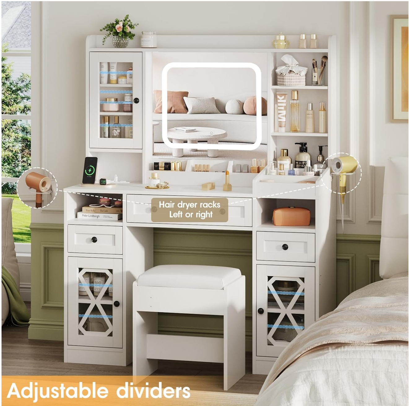
Figure 4.1: Adjustable Dividers and Hair Dryer Rack Placement