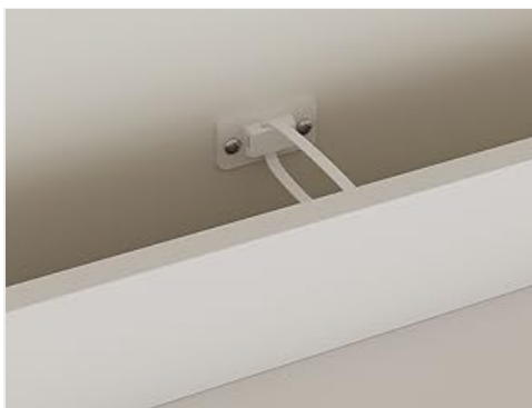
Figure 2.1: Anti-Topping Device Installation