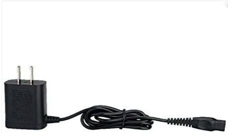
Image: The YBQZJSLY 15V Power Adapter.