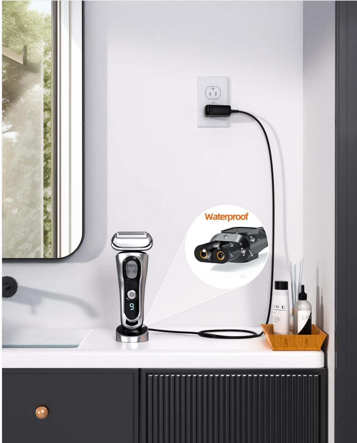
Image: The 15V power adapter connected to a Philips shaver and a wall outlet.

The charger is now ready to supply power to your device. An example of the charger in use is shown below.