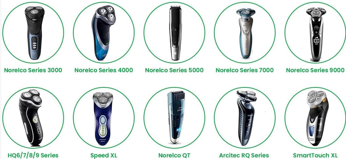
Image: Detailed list of Philips shaver series compatible with the 15V power adapter.

HQ5 Series: HQ560 HQ586 HQ568 HQ6 series: HQ6070 HQ6071 HQ6075 HQ6095 HQ6073 HQ6090 HQ7 series: HQ7290 HQ7240 HQ7120 HQ7140 HQ7160 HQ7180 HQ7260 HQ7310 HQ7320 HQ7340 HQ7350 HQ7360 HQ7380 HQ7390 HQ7100 HQ7200 HQ7141 HQ7142 HQ7143 HQ7165 HQ7742 HQ7760 HQ7762 HQ7780 HQ7782 HQ7740HQ7300 HQ7330 HQ7363 HQ7800 HQ7890 HQ7340 HQ7350 HQ8 series: HQ8140 HQ8160 HQ8170 HQ8885 HQ8890HQ8894 HQ8240 HQ8250 HQ8100 HQ8142 HQ8150 HQ8174 HQ8172 HQ8141 HQ8155 HQ8173 HQ8200 HQ8241 HQ8253 HQ8260 HQ8261 HQ8270 HQ8290 HQ8445 HQ8825 HQ8845 HQ8865 HQ8875 HQ890 HQ8894 HQ8890 HQ9 series: HQ9070 HQ9080 HQ9090 HQ9160 HQ9170HQ9190 HQ9100 HQ9140 HQ9020 HQ9161 HQ9199 HQ909 HQ912 HQ915 HQ916 HQ917 HQ988 HQ9170 HQ9190 RQ10 series:HQ9070 HQ9080 HQ9090 HQ9160 HQ9170HQ9190 HQ9100 HQ9140 HQ9020 HQ9161 HQ9199 HQ909 HQ912 HQ915 HQ916 HQ917 HQ988 HQ9170 HQ9190 RQ11 series:RQ1150 RQ1180 RQ1175 RQ1195 RQ12 series:RQ1250 RQ1260 RQ1280 RQ1290 RQ1251 RQ1286 RQ1296 RQ1297 AT series: AT750 AT751 AT890 AT89 YS series: YS523 YS526 YS536 HS8 series: HS8020 HS8420 HS8060 HS8040 HS8 series: RQ360 RQ361 RQ370