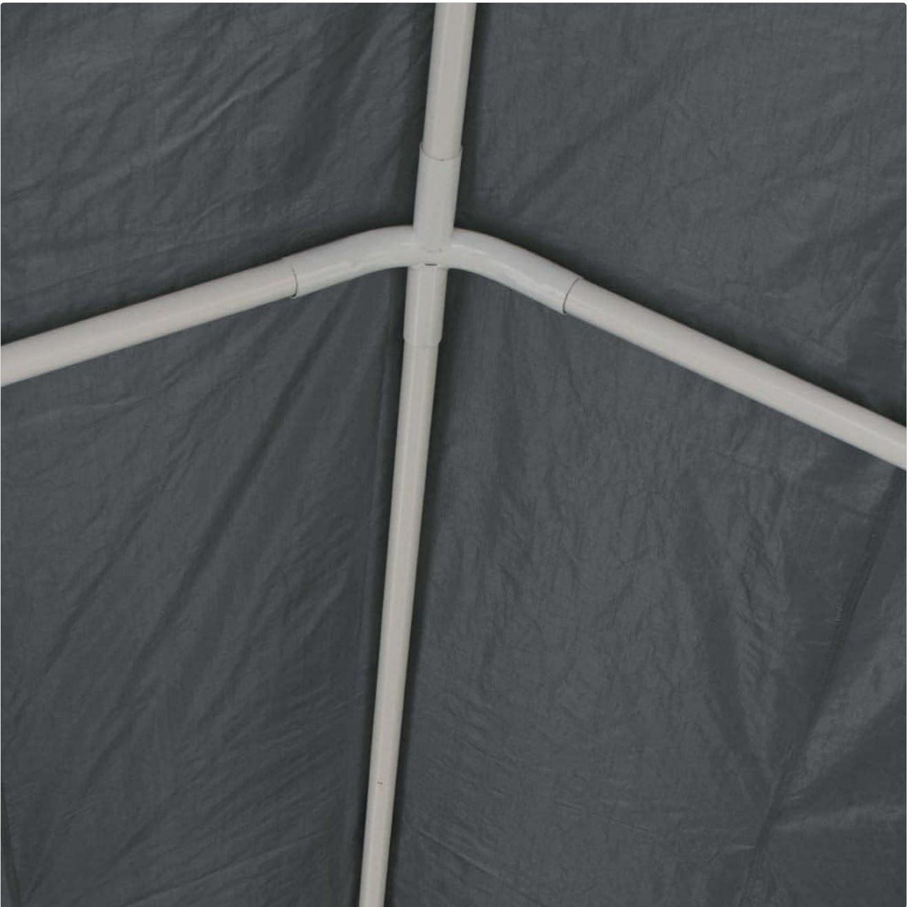
Figure 4.3: Detail of a frame joint, illustrating the connection points for the tubular steel structure.