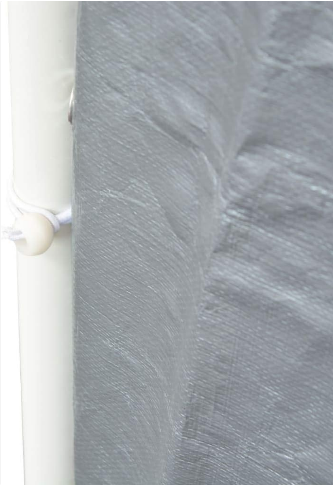
Figure 4.4: Close-up showing how the tent fabric is secured to the frame using elastic cords and eyelets.