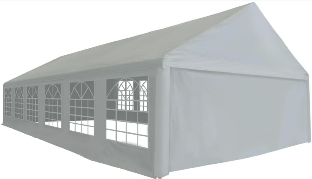
Figure 4.1: Fully assembled KCCKOM Party Tent, showcasing its structure and side windows.