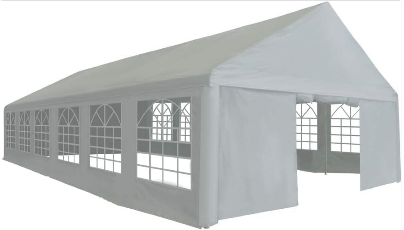
Figure 5.1: The party tent with one of its end door panels rolled up, demonstrating easy access.