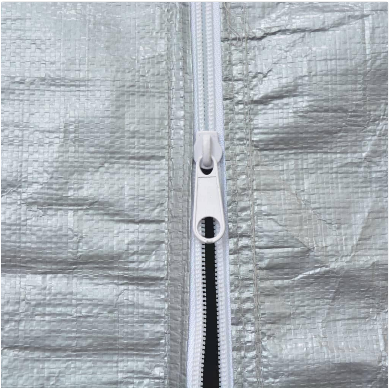
Figure 5.2: A close-up view of the durable zipper on the tent's door panel.