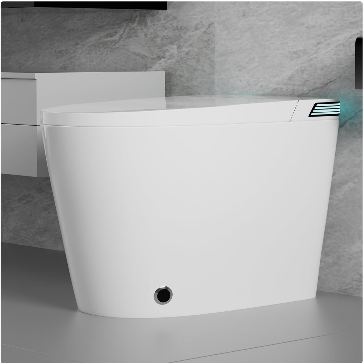
Side view of the WinZo Smart Bidet Toilet, highlighting its compact tankless form factor.