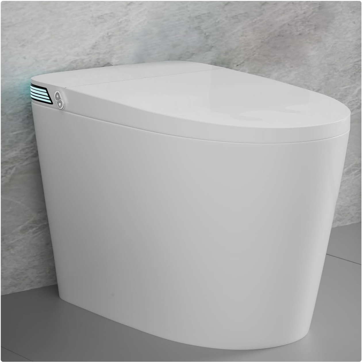
Front view of the WinZo Smart Bidet Toilet, showcasing its sleek, modern design.