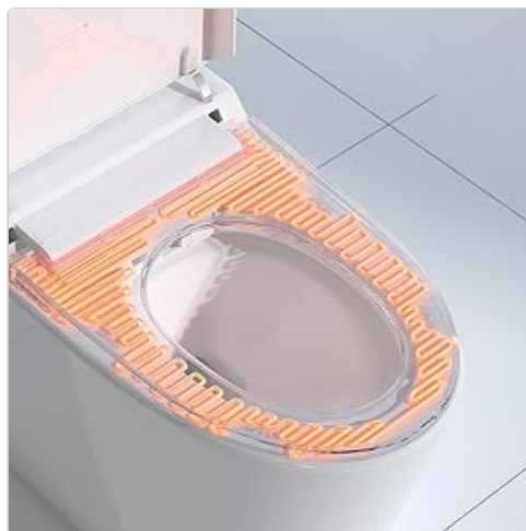
Figure 8: Heated seat with adjustable temperature settings.