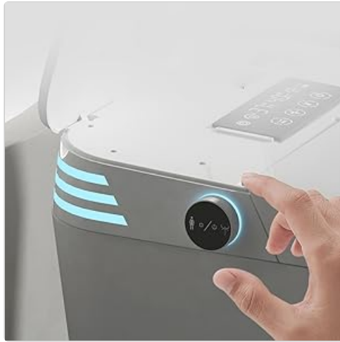
Figure 10: Side knob for manual control.

The side knob provides an alternative method for basic operations.