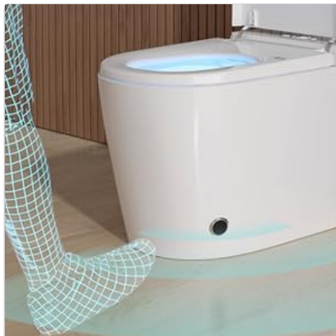
Figure 4: Foot sensor for hands-free operation.