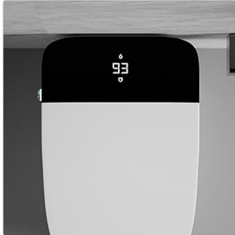
Figure 5: LED display for temperature and settings.