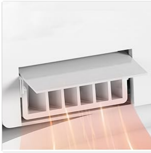
Figure 9: Warm air drying feature.