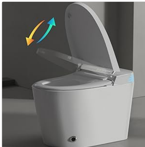
Figure 3: The toilet lid automatically opening upon approach.