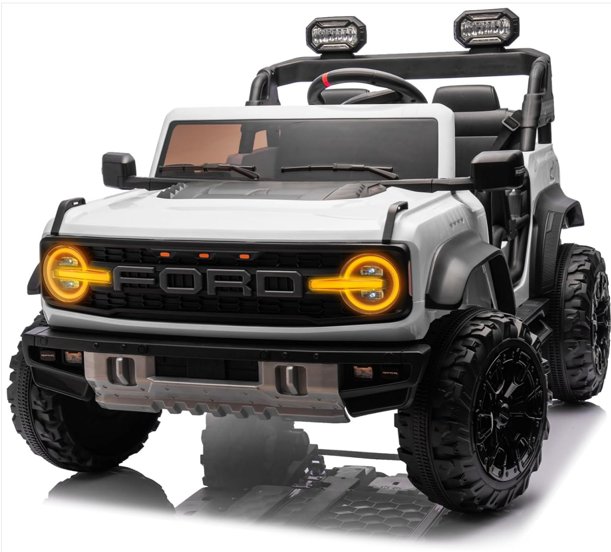
Image 1.1: The YOFE 24V Ford Bronco Raptor 2 Seater Electric Ride-On Car. This vehicle offers an authentic driving experience with realistic details.