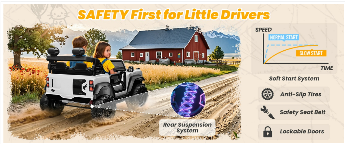
Image 2.1: Overview of key safety features such as the soft start system, anti-slip tires, safety seat belts, and lockable doors.