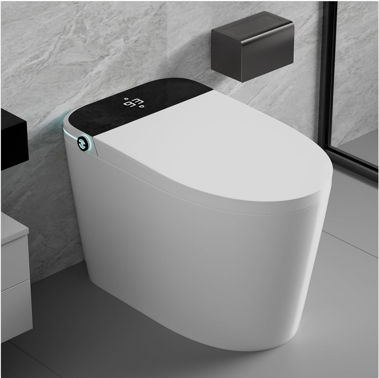
Image 1.1: Front view of the WinZo SM8005-1 Elongated Smart Toilet.