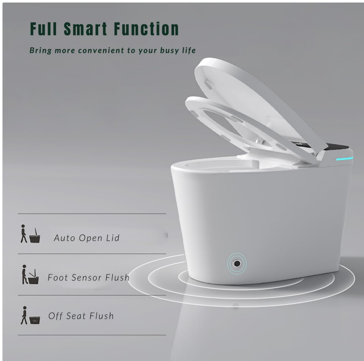
Image 4.1: Illustration of automatic lid, foot sensor, and off-seat flush functions.