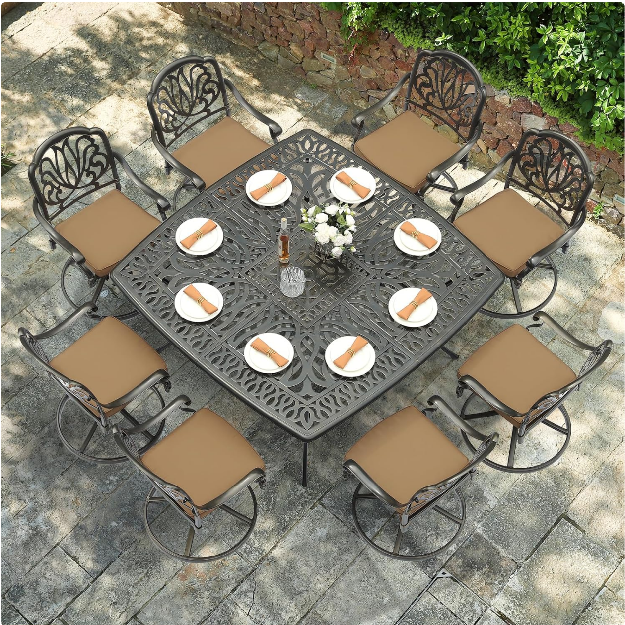
Image 2.2: Top-down view of the 64" square dining table set up with eight chairs, demonstrating its capacity for large gatherings.