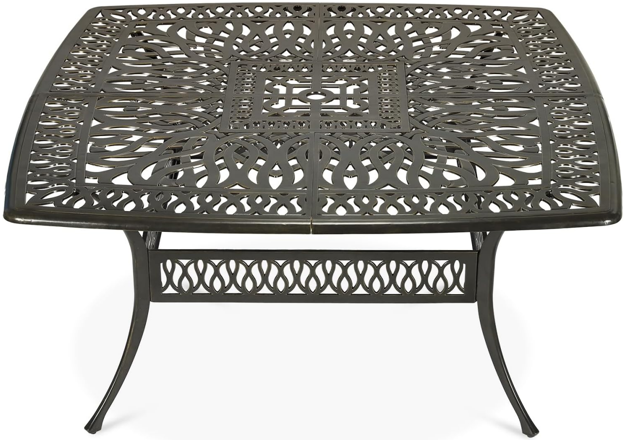
Image 2.1: The VIVIJASON 64" Square Cast Aluminum Patio Dining Table, showcasing its antique bronze finish and intricate lattice design.