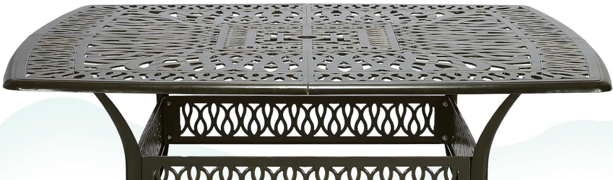
Image 4.2: Detailed view highlighting the 2.2-inch umbrella hole and adjustable foot pads for stability.