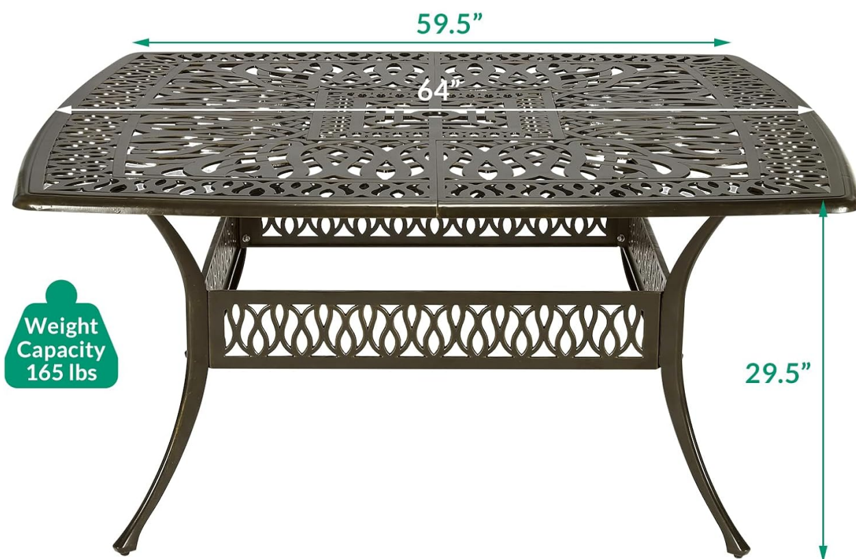
Image 8.1: Diagram illustrating the key dimensions of the 64" square patio dining table.