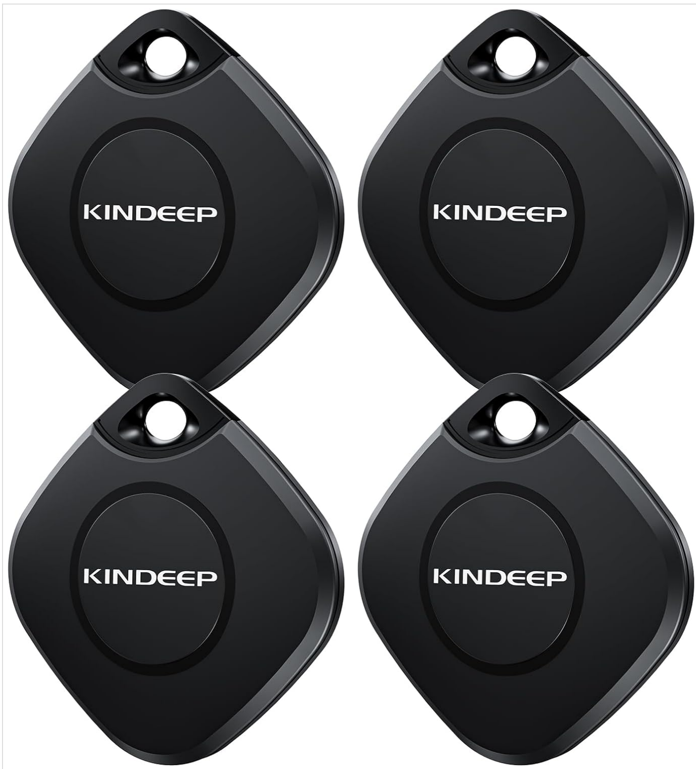
Figure 2.1: KINDEEP Air Tracker Tag 4-Pack.