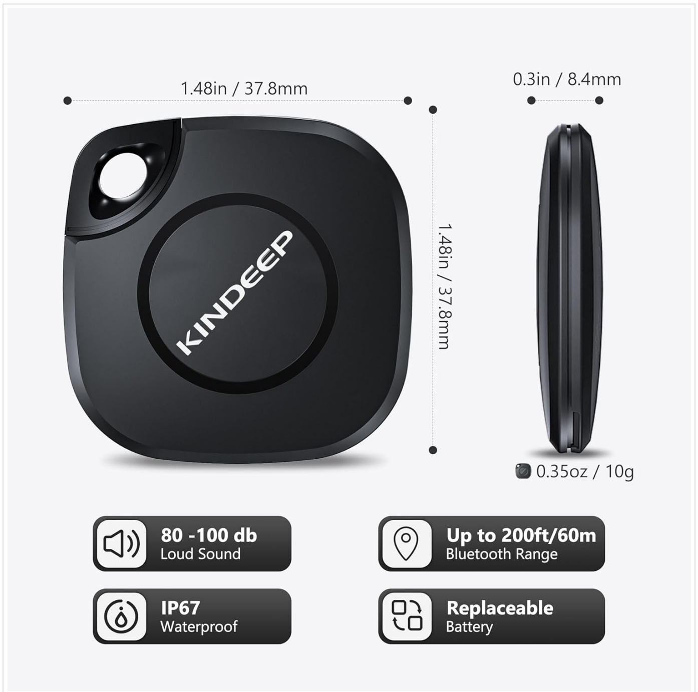
Figure 2.2: KINDEEP Air Tracker Tag dimensions and key features.