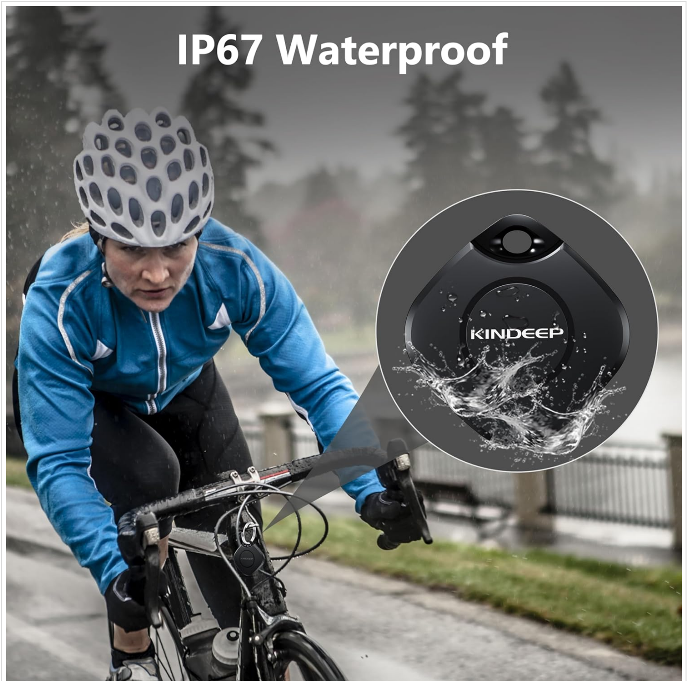
Figure 5.1: IP67 Water-resistant feature.

The KINDEEP Air Tracker Tag has an IP67 water-resistant rating, meaning it can withstand splashes, rain, and brief immersion in water (up to 1 meter for 30 minutes). While it offers good protection against water, it is not recommended for prolonged submersion or use during swimming or diving.