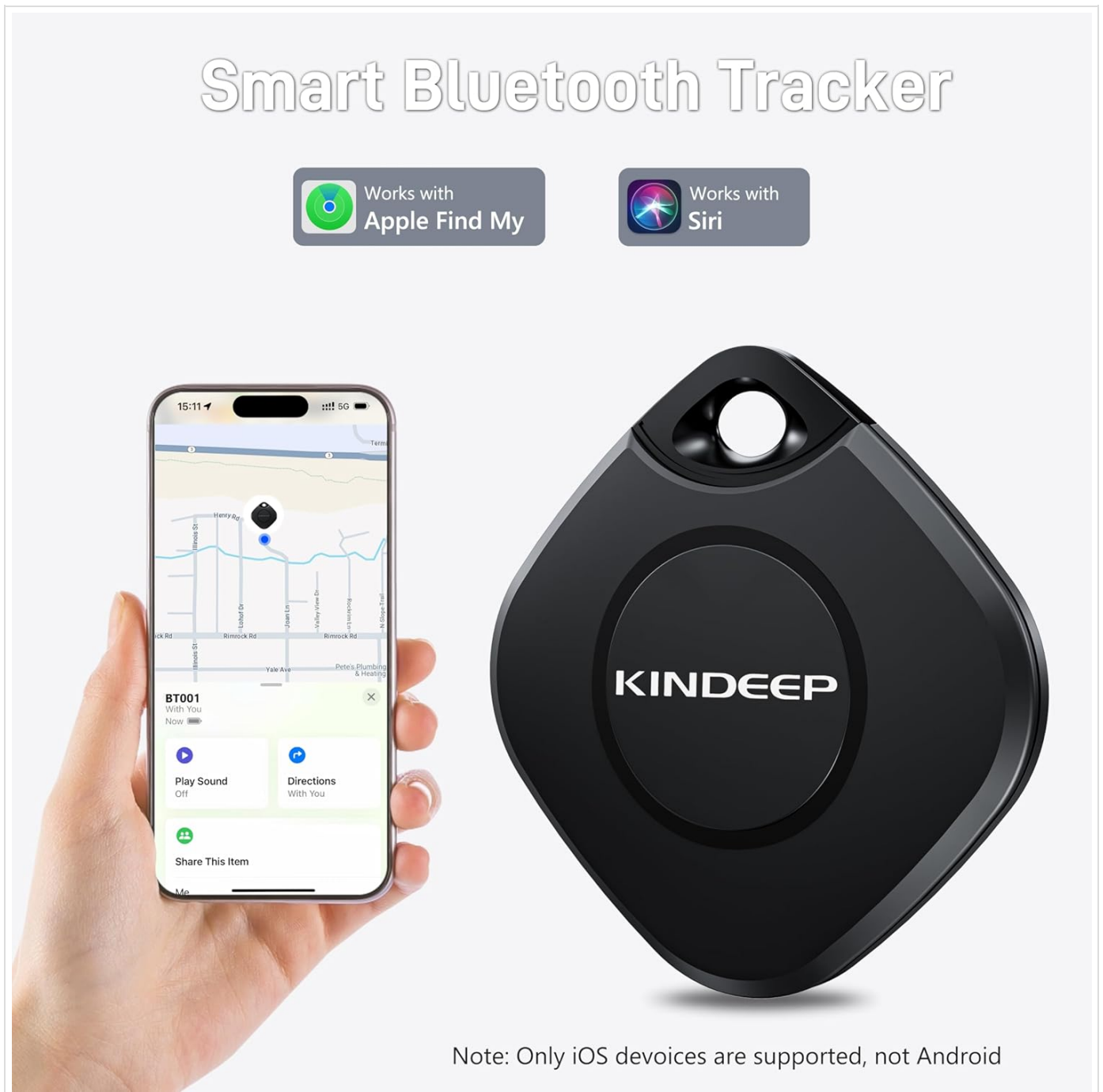
Figure 3.1: KINDEEP Air Tracker Tag working with Apple Find My app.

Video 3.1: Official KINDEEP Air Tags usage and pairing guide.