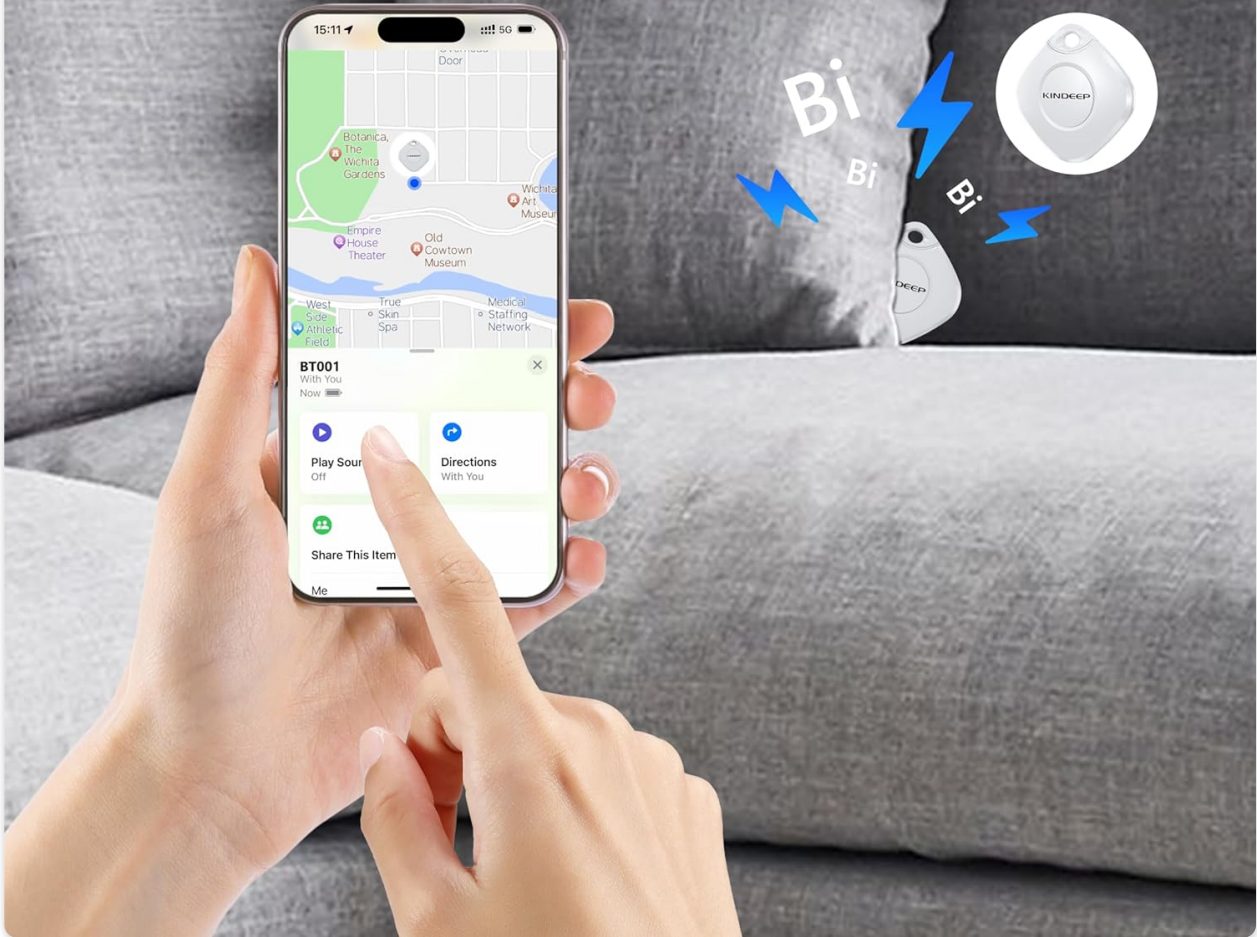
Image: Using the "Play Sound" feature in the Find My app to locate a nearby KINDEEP Tracker.

Simply ring with 'Play Sound' to instantly locate your item