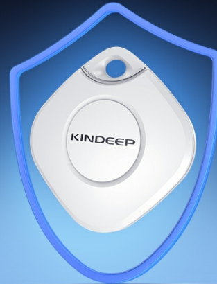
Image: Diagram illustrating the location sharing capability of the KINDEEP Tracker.

The KINDEEP Bluetooth Tracker works with Apple Find My. Leveraging the Find My network, all communication data remains anonymous and encrypted for your security.