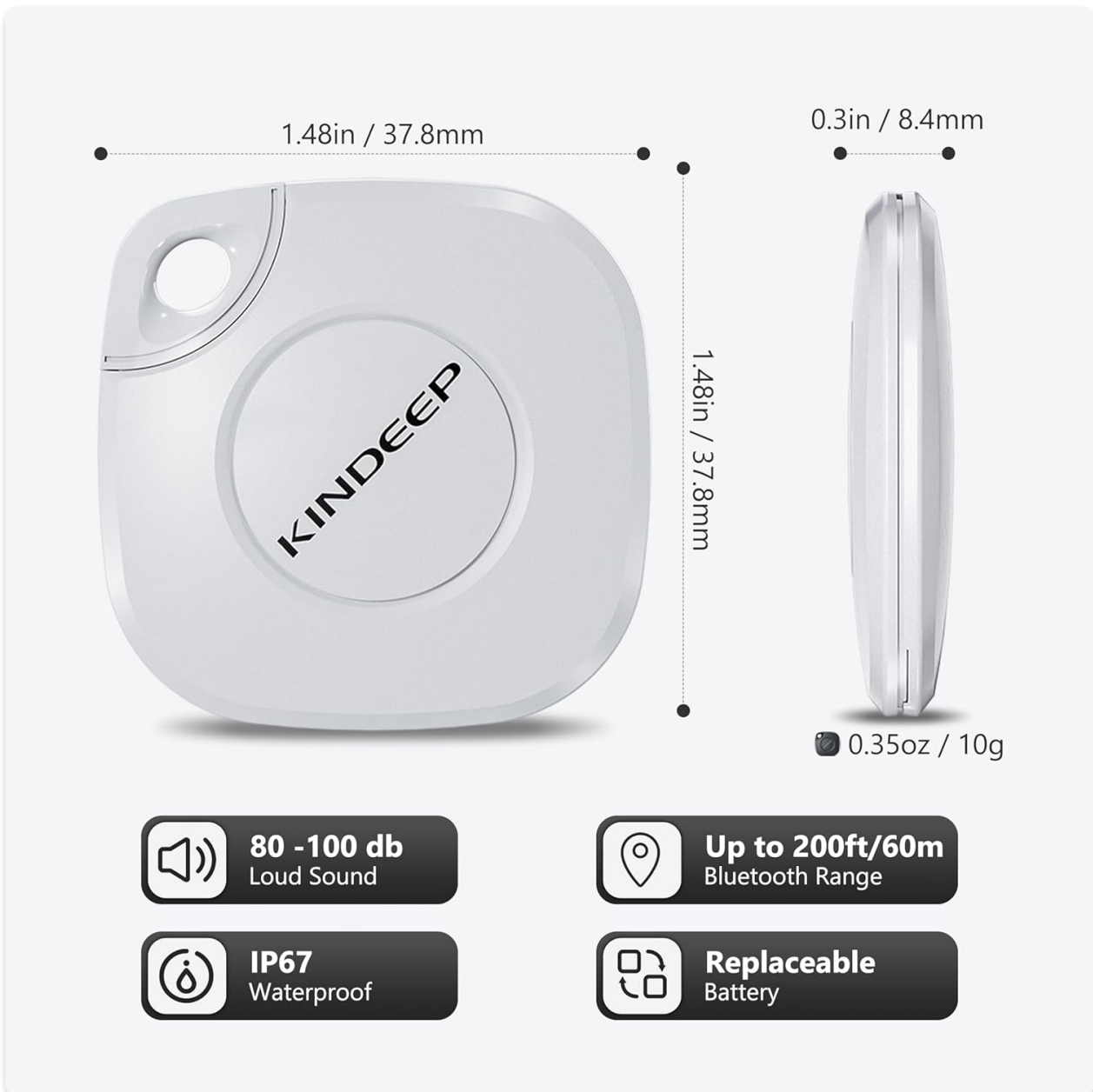
Image: Visual representation of KINDEEP Tracker dimensions and key specifications.