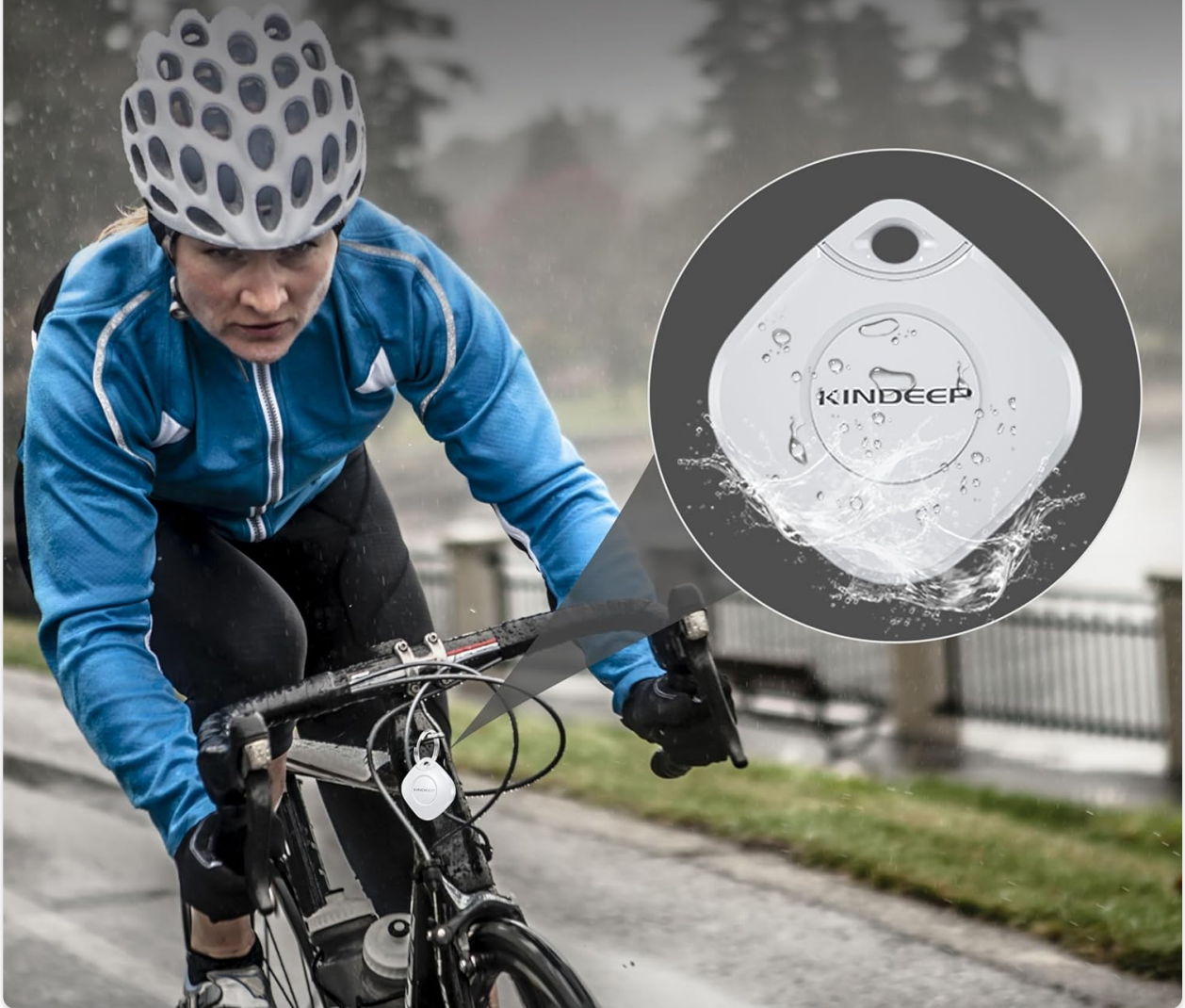
Image: KINDEEP Tracker demonstrating IP67 water resistance during outdoor use.