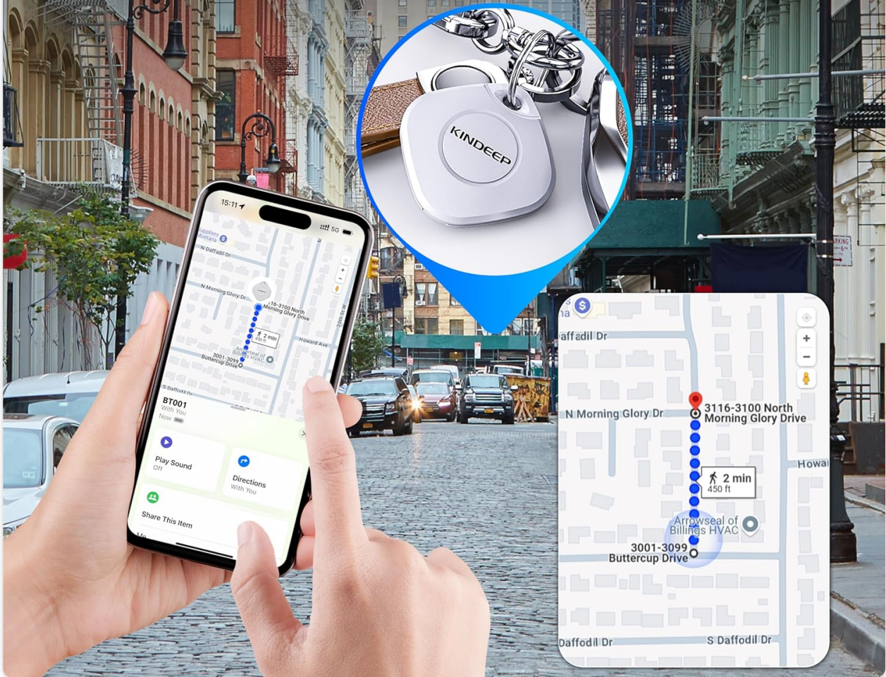
Image: Tracking a KINDEEP Tracker Air Tag on a map when it is far away.

Track and find your items anywhere on the map of your Find My app.