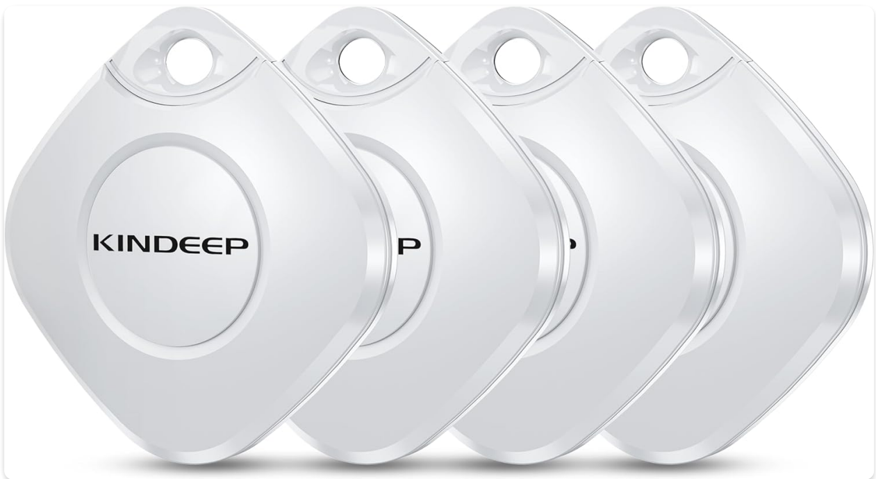
Image: Four KINDEEP Tracker Air Tags, highlighting the multi-pack offering.

The KINDEEP Tracker Air Tag is a smart GPS tracker designed to help you effortlessly locate your valuables. This device integrates seamlessly with the Apple Find My app on iOS devices, allowing you to track items such as luggage, keys, backpacks, and pets. With features like nearby finding, left-behind reminders, and a lost mode, it provides peace of mind by helping you keep track of your important belongings.