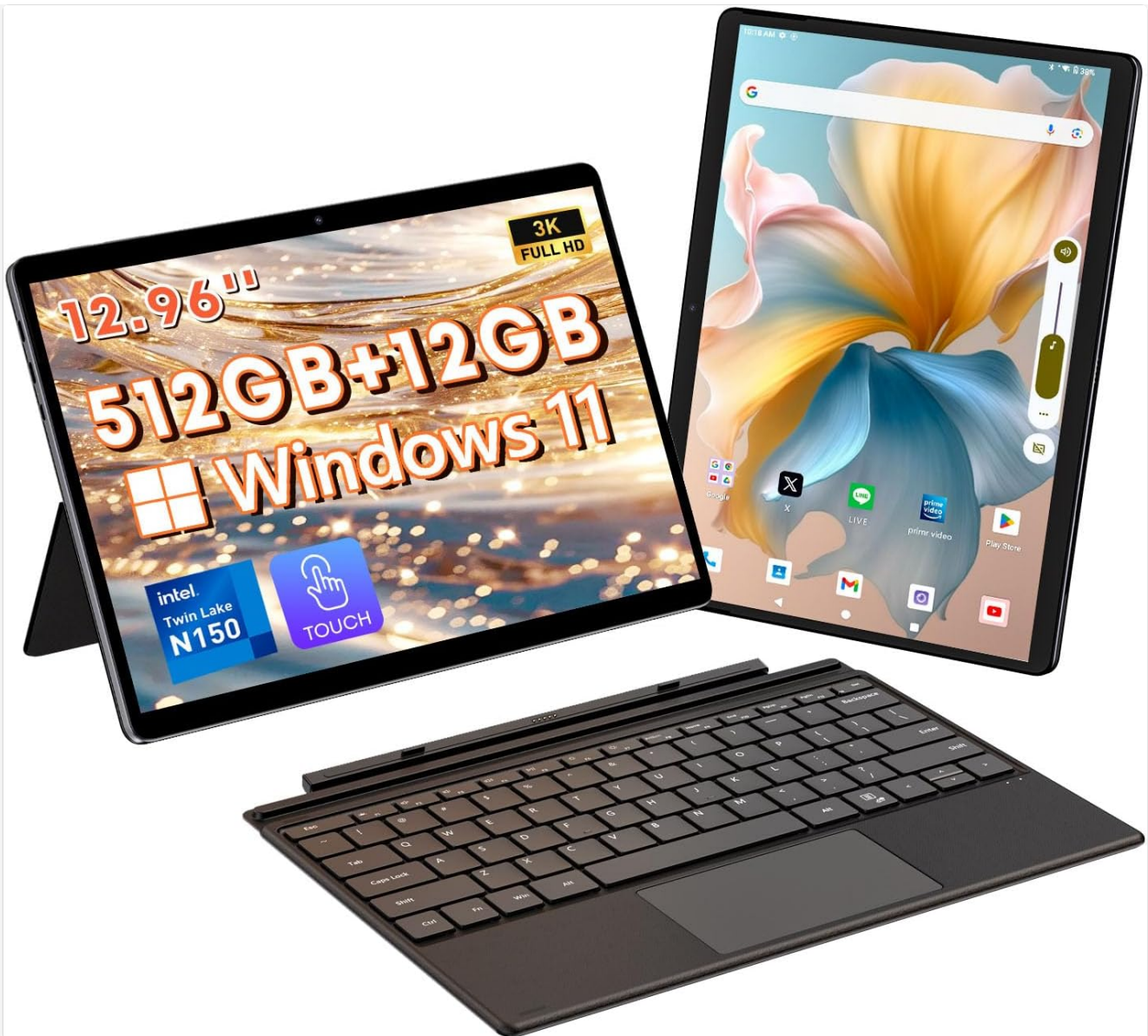
Image: CHUWI Hi10 Max Tablet, detachable keyboard, and magnetic stand.