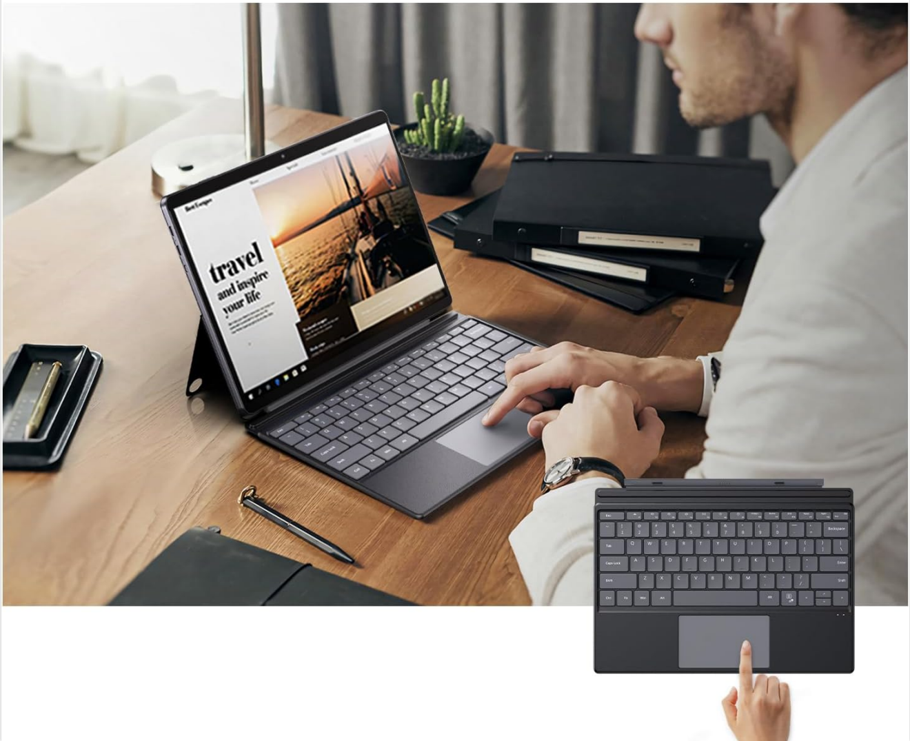
Image: User operating the CHUWI Hi10 Max with its full-size detachable keyboard.

Ergonomic design, comfortable touch. Large touchpad, easy to operate, no delay.