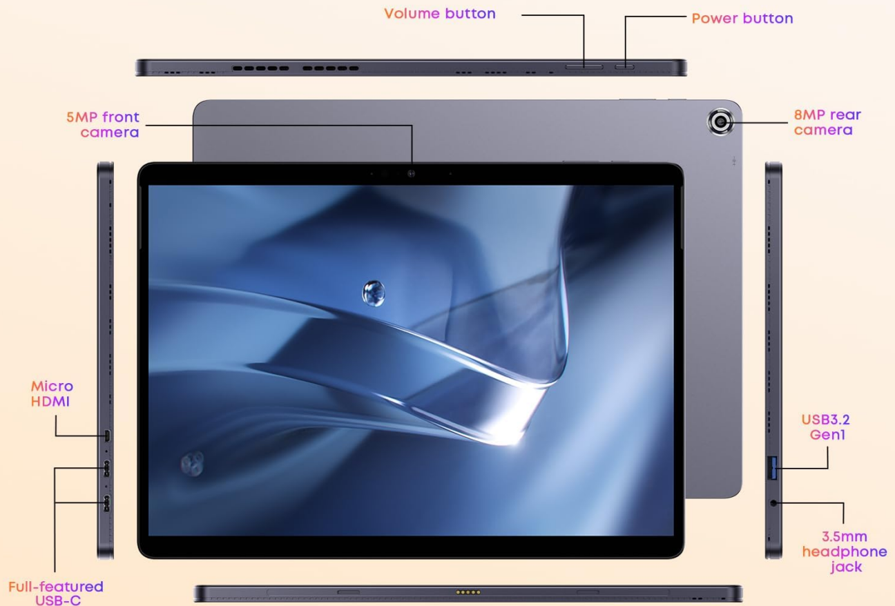
Image: Overview of the CHUWI Hi10 Max tablet's ports and buttons.

Refer to the image above for the location of the following components: