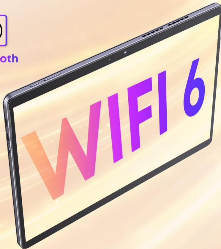
Image: Visual representation of Wi-Fi 6 and Bluetooth 5.2 capabilities.