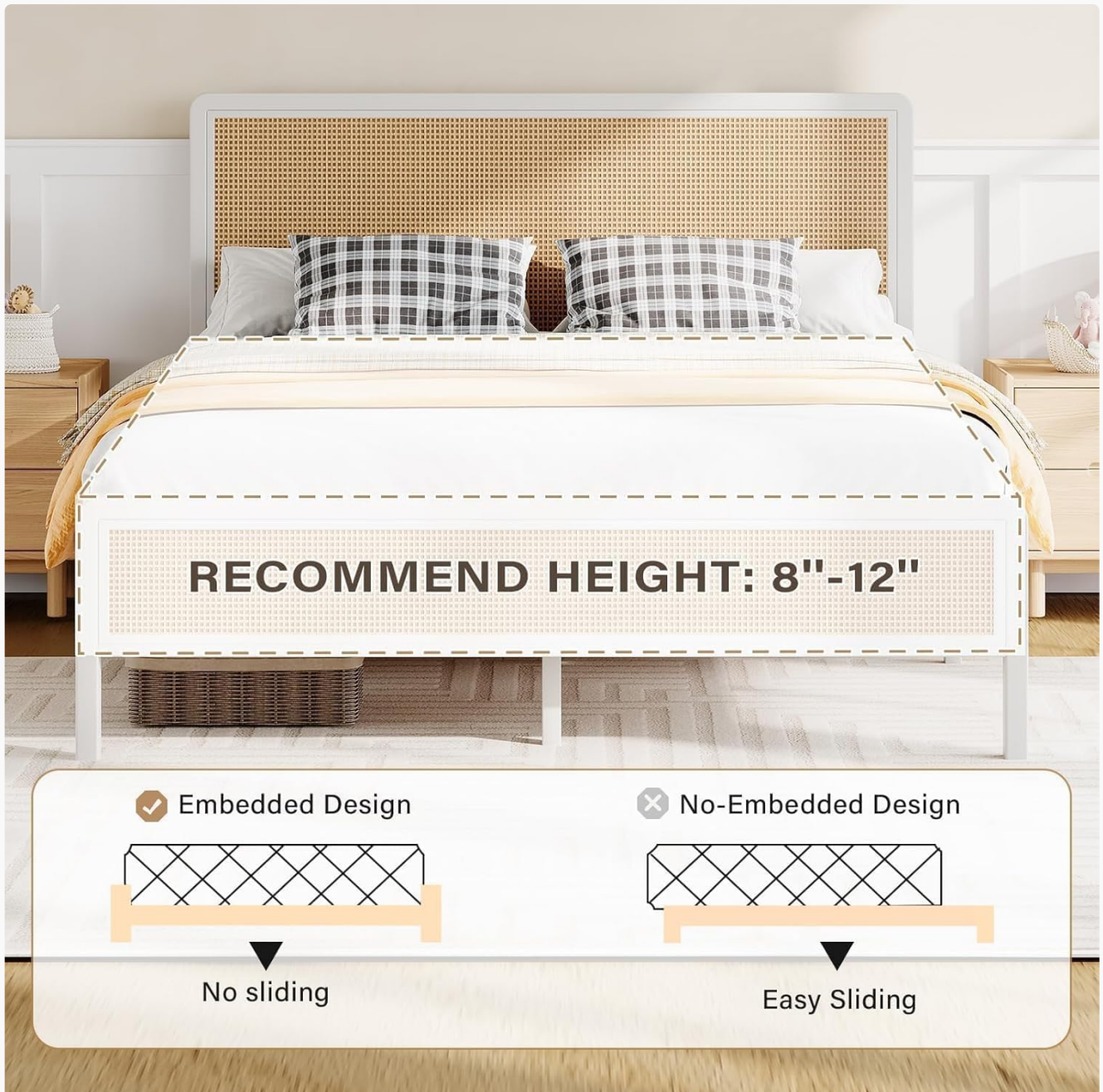
Image 4.1: Guide for mattress placement, showing recommended height and the embedded design that prevents mattress movement.