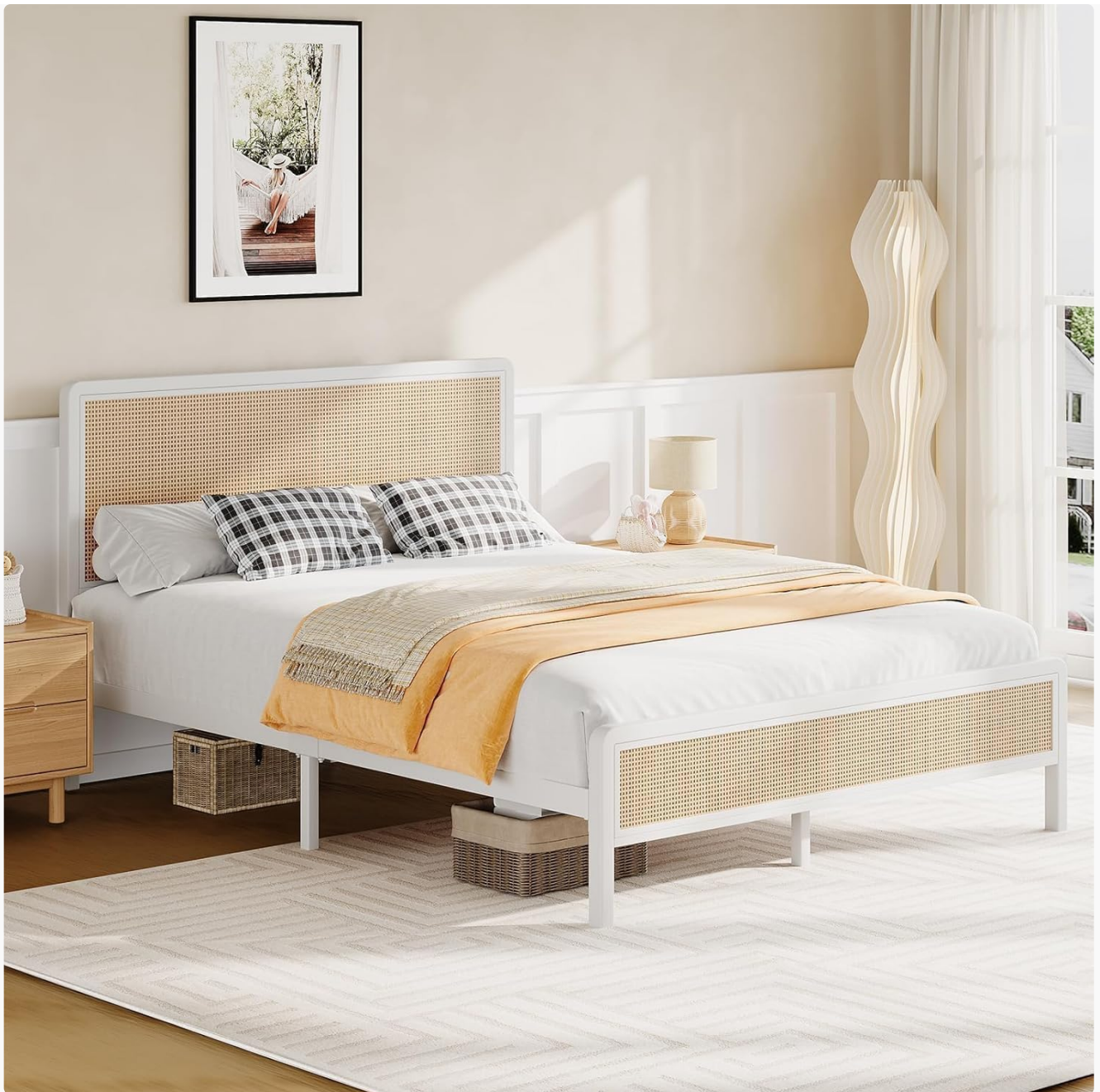
Image 1.1: The CHABUILDREARK Full Rattan Bed Frame, showcasing its design in a bedroom environment.