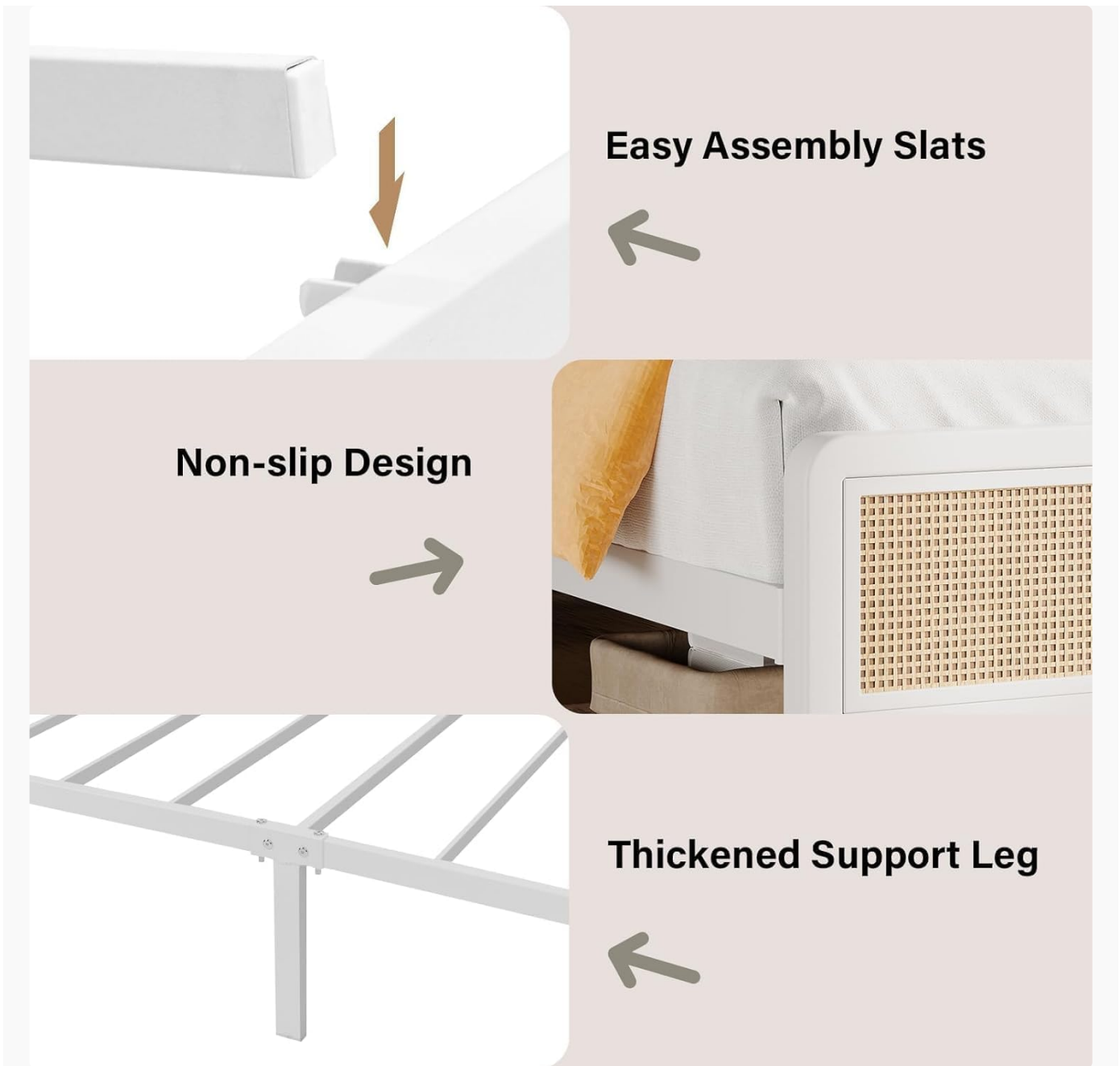
Image 3.1: Visual guide to key assembly features including easy-to-install slats, non-slip feet, and reinforced support legs.