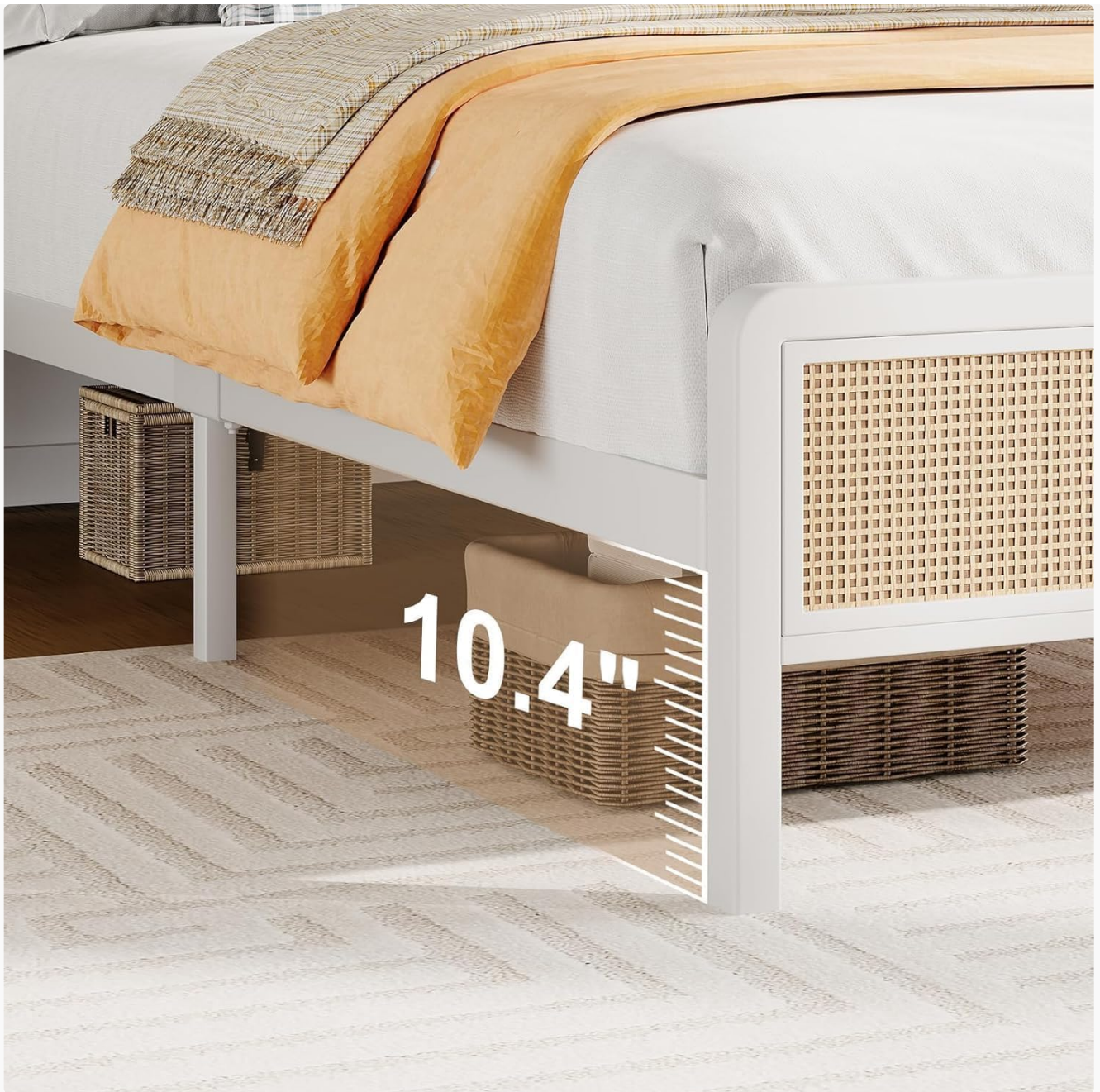
Image 4.2: View of the 10.4-inch under-bed clearance, suitable for storage containers.