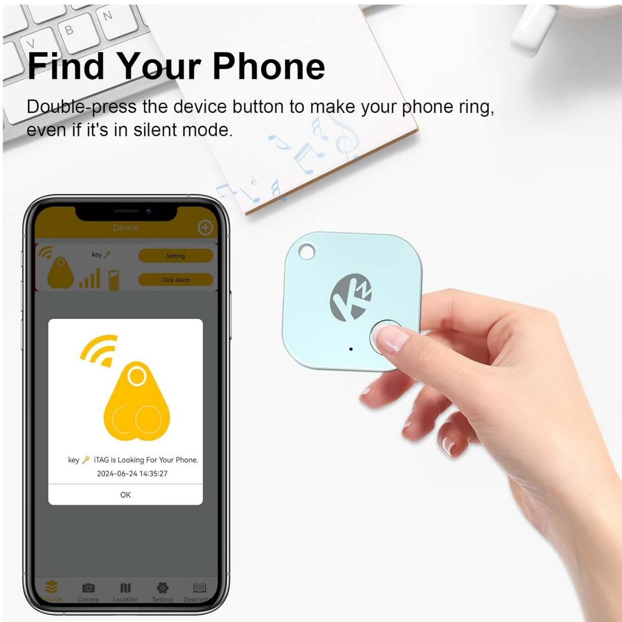
Image: A hand holding the KZO Bluetooth Tracker, positioned next to a smartphone. The smartphone screen displays a notification from the KZO app stating "iTAG is Looking For Your Phone."

Double-press the device button to make your phone ring, even if it's in silent mode.