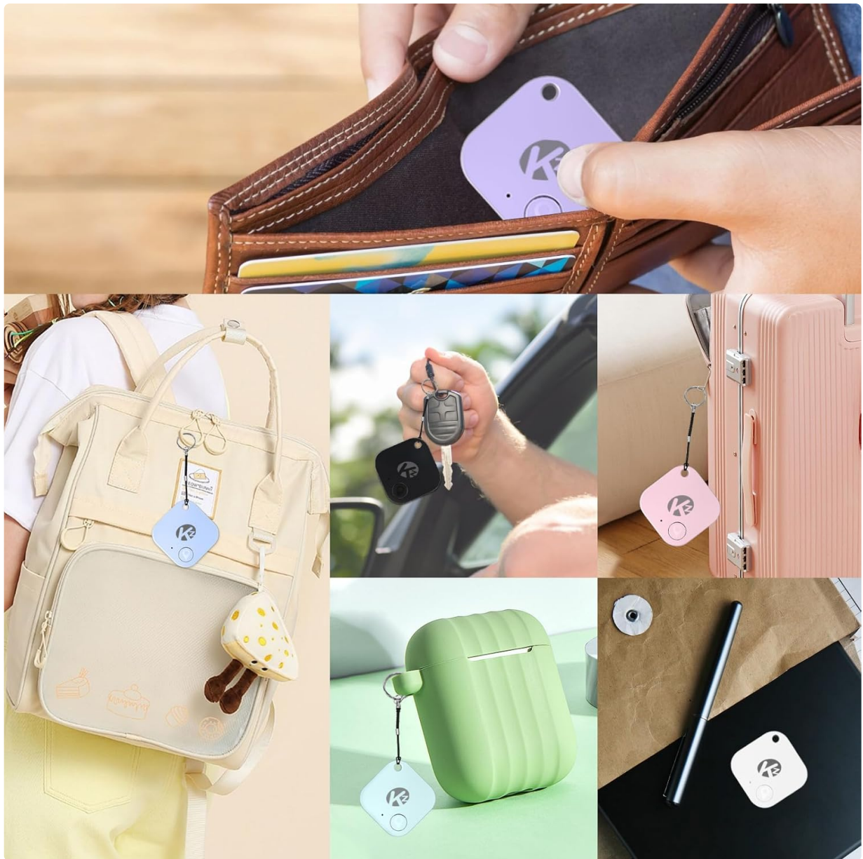
Image: A collage demonstrating various uses for the KZO Bluetooth Tracker, showing it attached to keys, placed inside a wallet, clipped to a backpack, hanging from luggage, attached to an AirPods case, and connected to a camera.