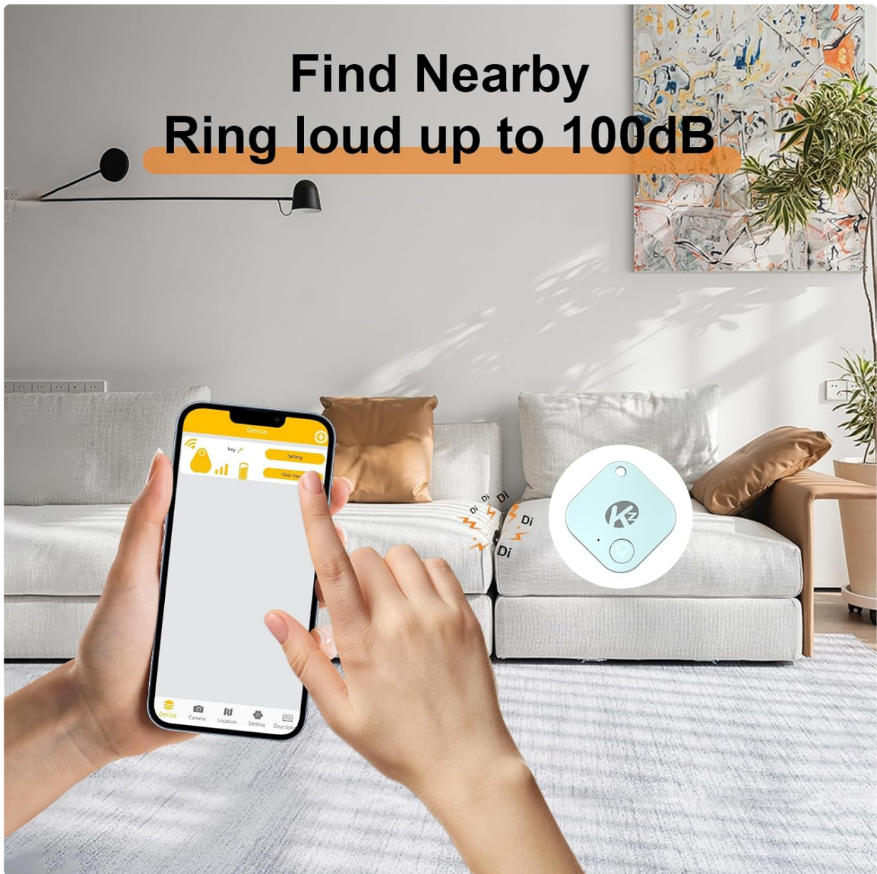
Image: A hand holding a smartphone displaying the KZO app, which shows an alert for a nearby tracker. In the background, a KZO tracker is depicted on a couch, with sound waves indicating it is ringing.