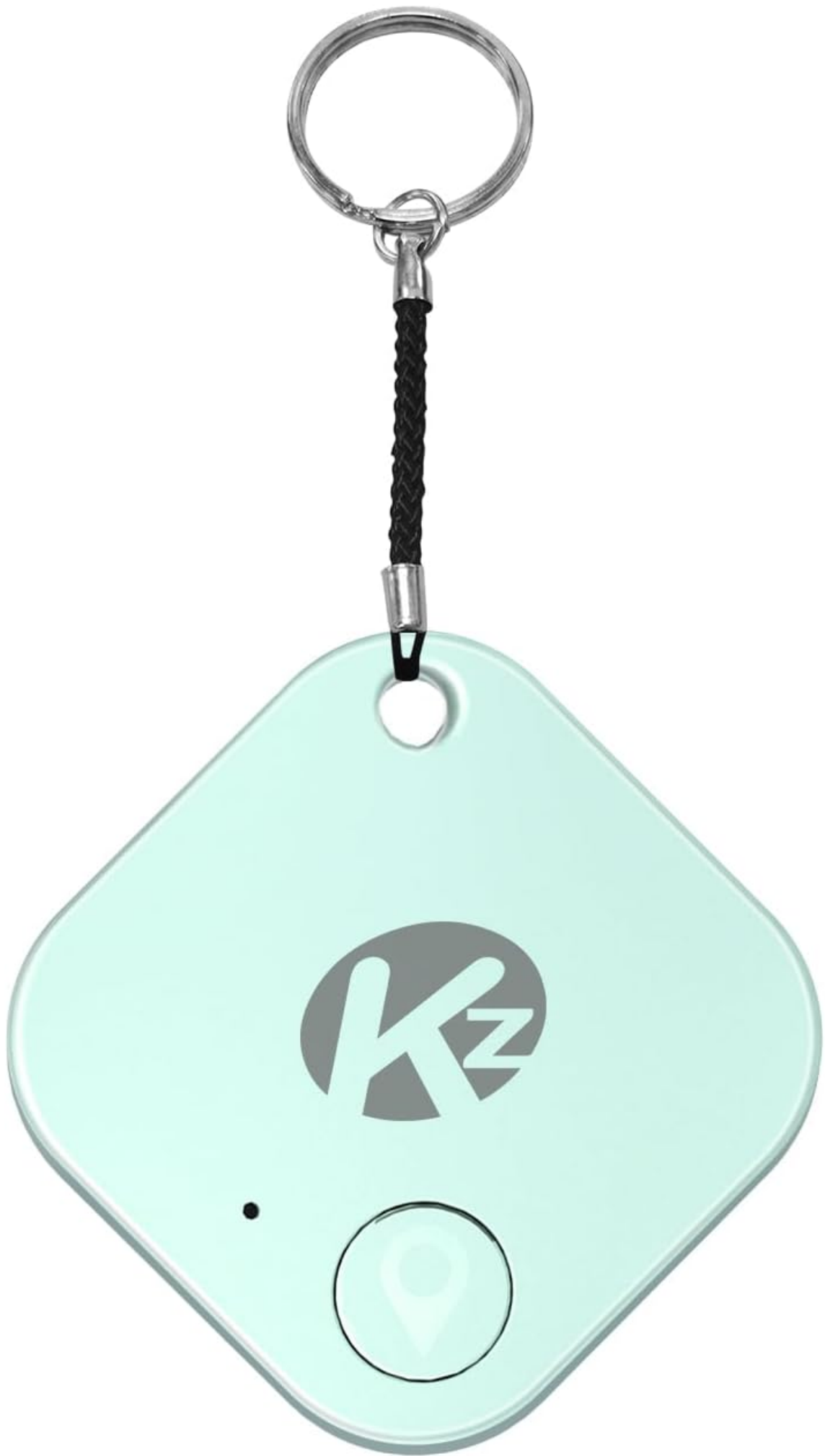
Image: The KZO Bluetooth Tracker, a square-shaped device with rounded corners, in a light green color, attached to a