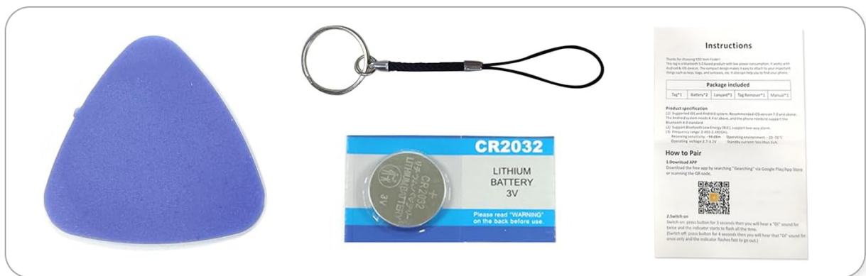
Image: Contents of the KZO Bluetooth Tracker package, showing the tracker, an extra CR2032 battery, a battery removal tool, and a lanyard. The image also displays the dimensions of the tracker.