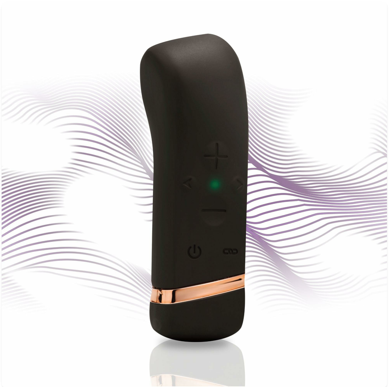
Image: The HANDY Oh! Smart Vibrator, a sleek black device with gold accents, held in a hand, highlighting its ergonomic shape and accessible control buttons.