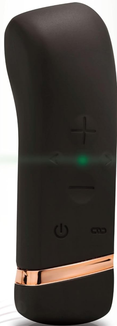
Image: A close-up of the HANDY Oh! Smart Vibrator's control interface, clearly labeling the power button, intensity adjustment buttons, and frequency buttons.