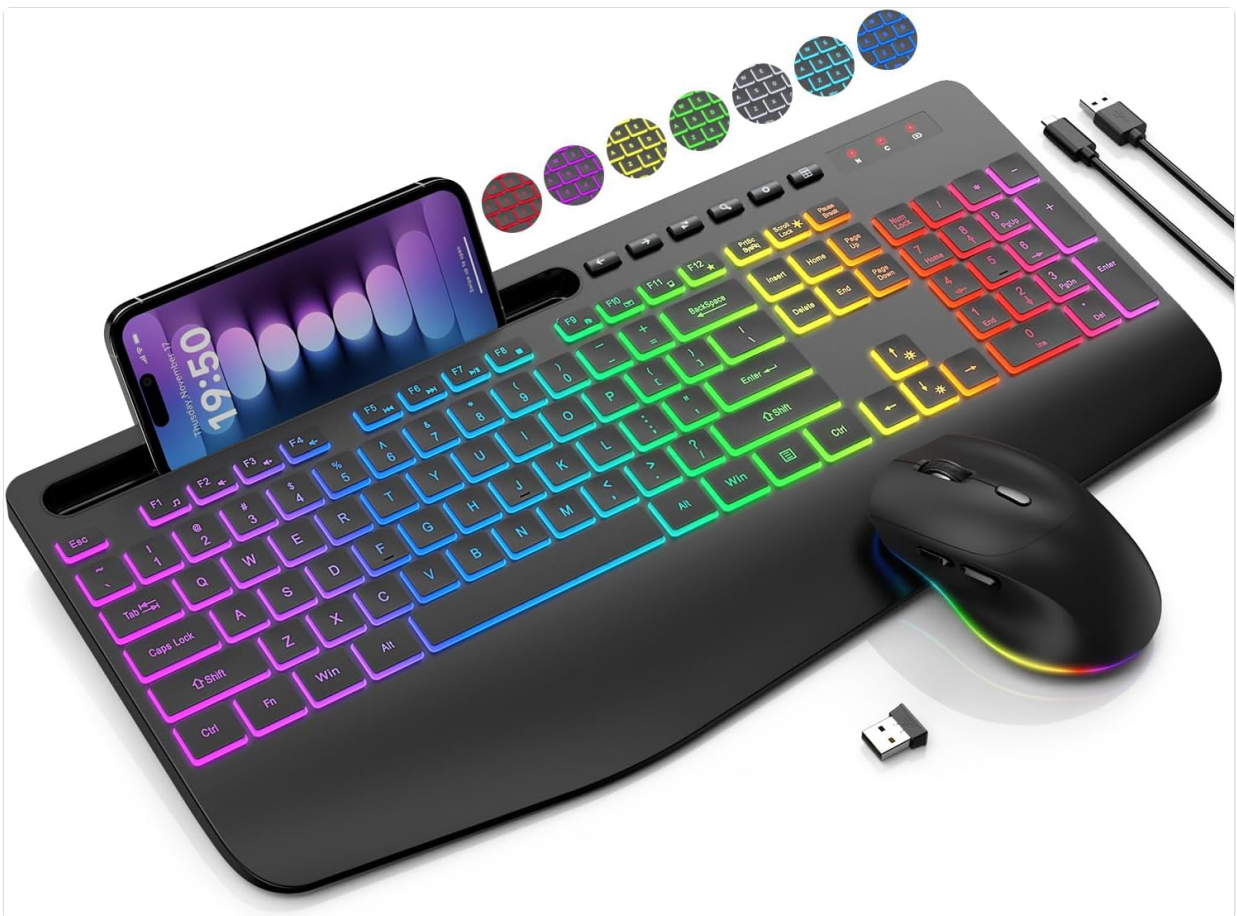
Image: The black SABLUTE wireless keyboard and mouse combo, displaying the keyboard with a phone in its holder, the wireless mouse, a USB dongle, and two Type-C charging cables.