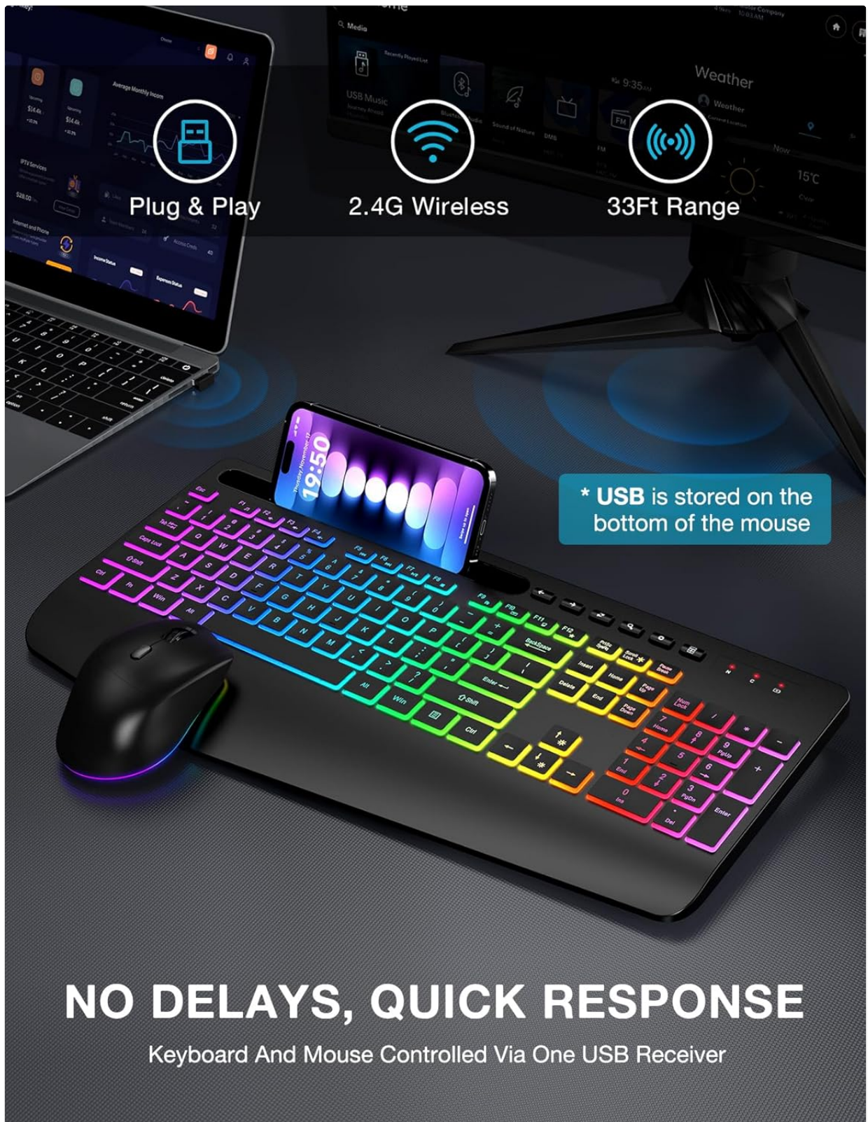
Image: An illustration demonstrating the 'Plug & Play' setup, highlighting the 2.4G wireless connectivity and a 33ft operating range. The USB receiver is shown stored at the bottom of the mouse.