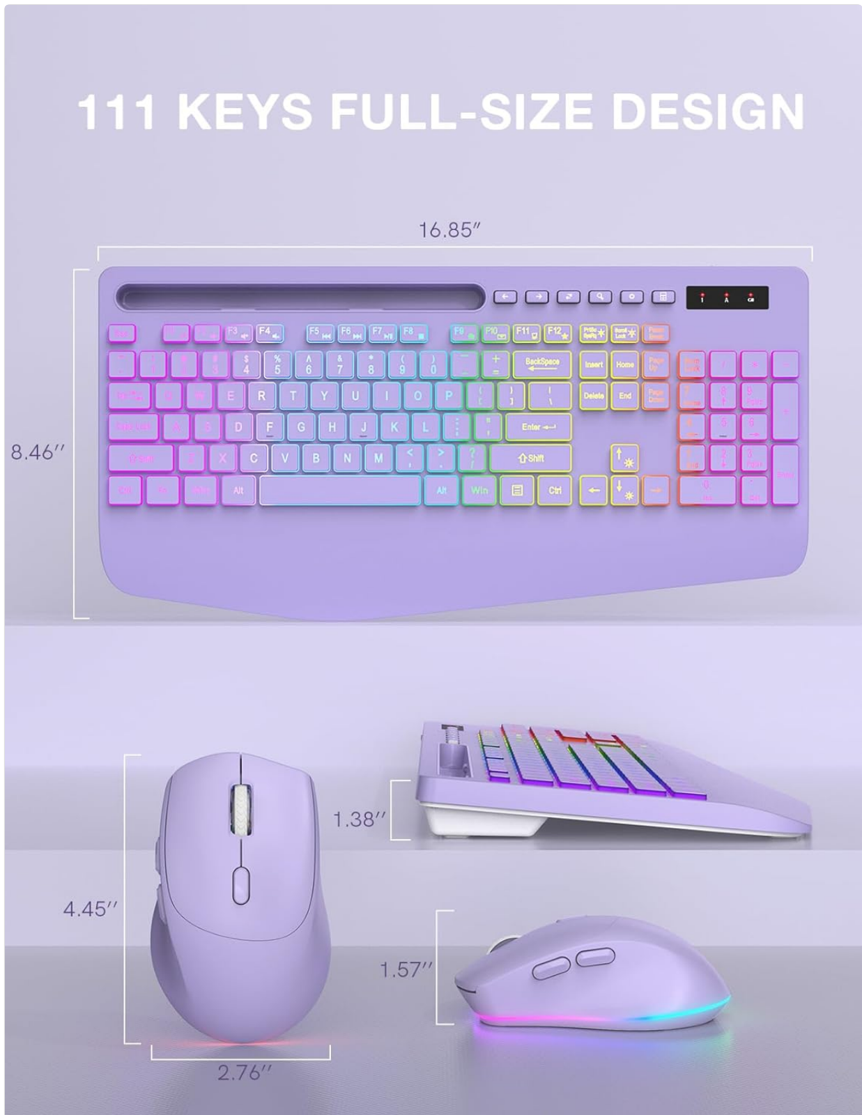
Image: A diagram illustrating the dimensions of the 111-key full-size keyboard (16.85" x 8.46") and the wireless mouse