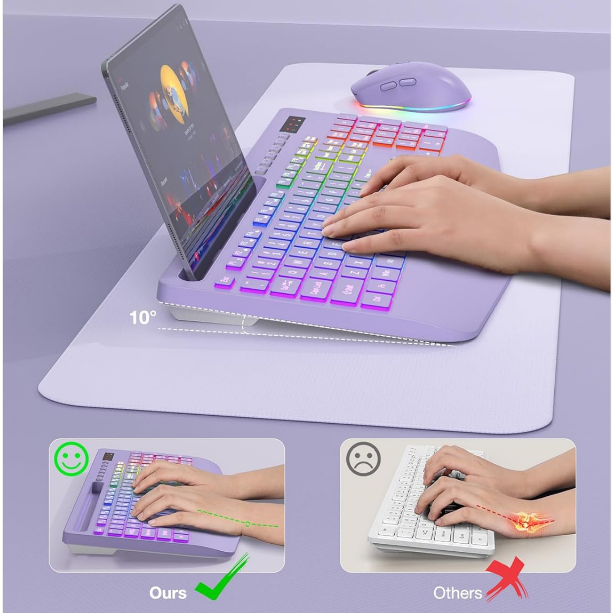
Image: A demonstration of the ergonomic palm rest, illustrating how it reduces wrist fatigue and pain by promoting a natural wrist angle, contrasted with an uncomfortable posture on a conventional keyboard.