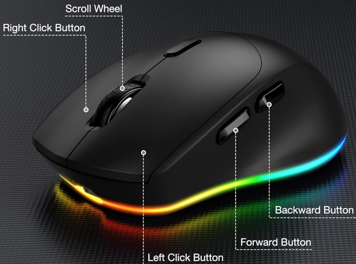
Image: A detailed diagram of the 6-button mouse, highlighting its features including Left Click, Right Click, Scroll Wheel, Forward Button, Backward Button, 3 tracking speeds, ergonomic shape, quiet click, and 15 switchable light effects.