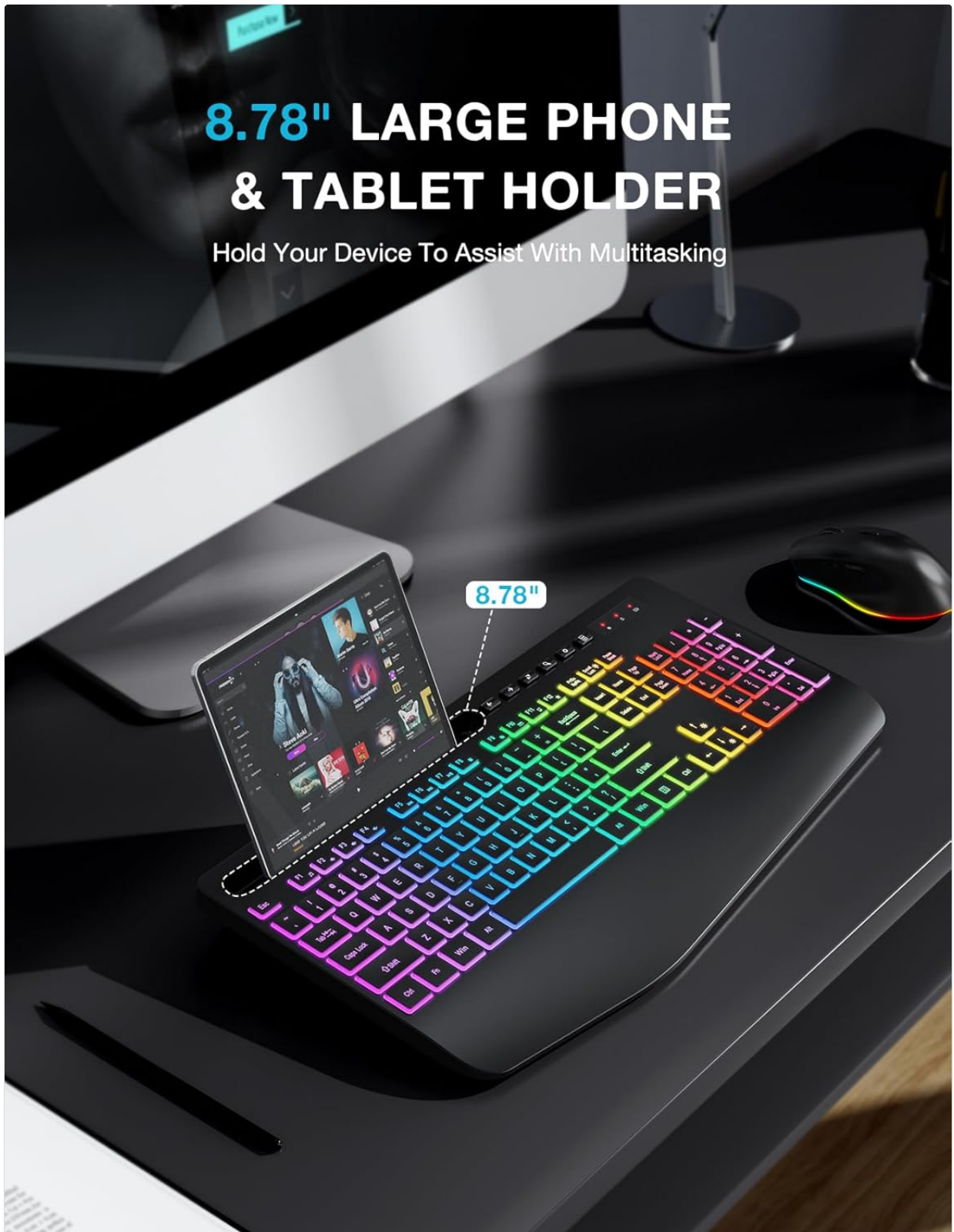
Image: The 8.78-inch large phone and tablet holder integrated into the keyboard, shown holding a tablet to assist with multitasking.

Hold Your Device To Assist With Multitasking