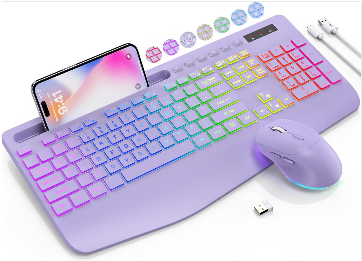
Image: The purple SABLUTE wireless keyboard and mouse combo, showing the keyboard with an integrated phone holder, the wireless mouse, a USB dongle, and two Type-C charging cables.