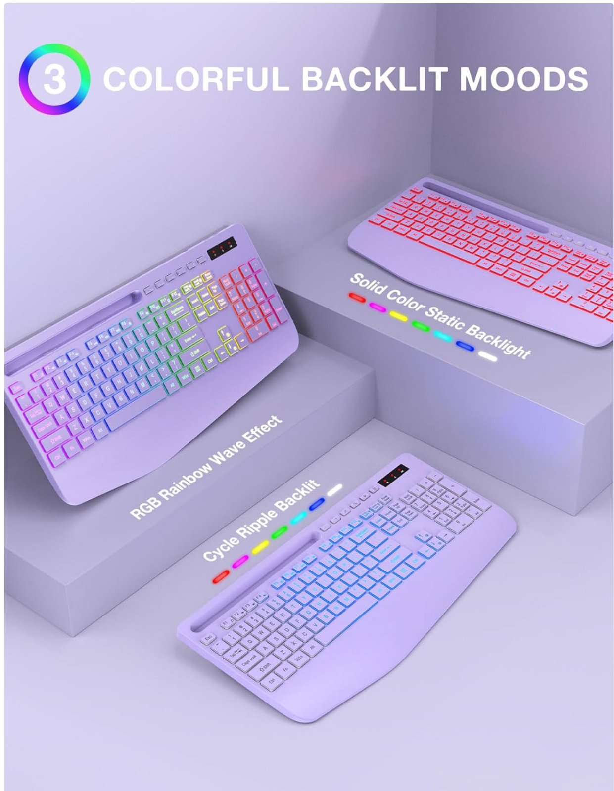
Image: A visual representation of the keyboard's three colorful backlit moods: RGB Rainbow Wave Effect, Solid Color Static Backlight, and Cycle Ripple Backlight.