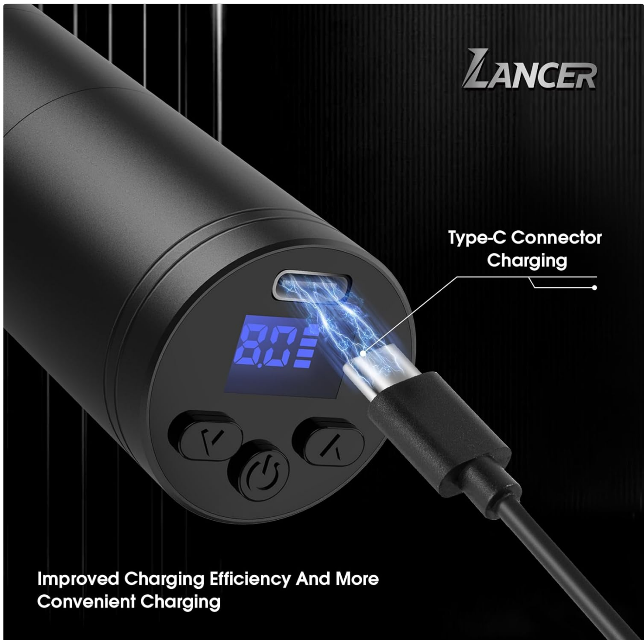
Figure 4.5: Close-up of the Type-C connector for charging the Lancer Tattoo Machine.