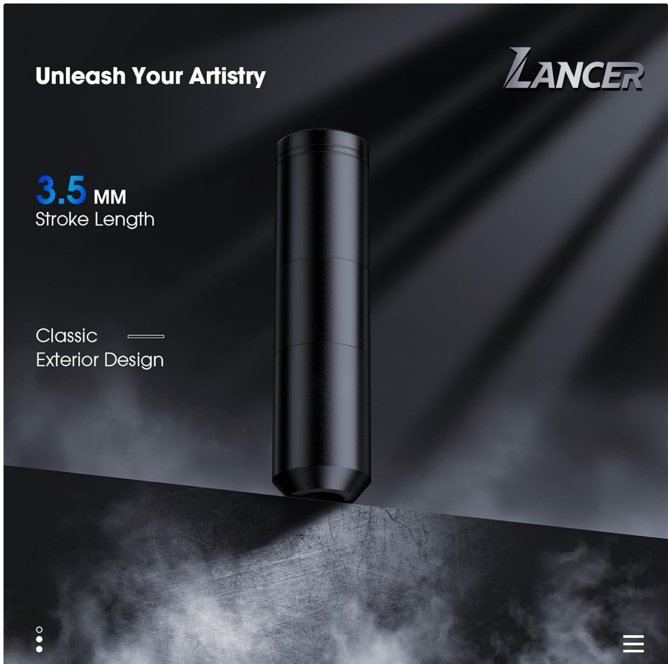
Figure 4.1: The Lancer Tattoo Machine highlighting its 3.5mm stroke length.