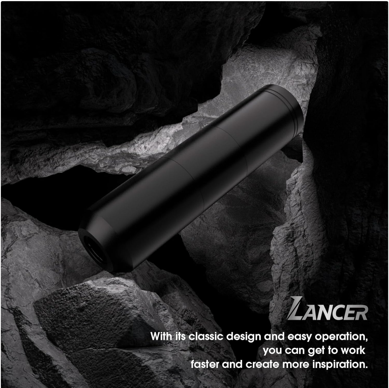
Figure 4.2: The sleek, classic exterior design of the Lancer Tattoo Machine.