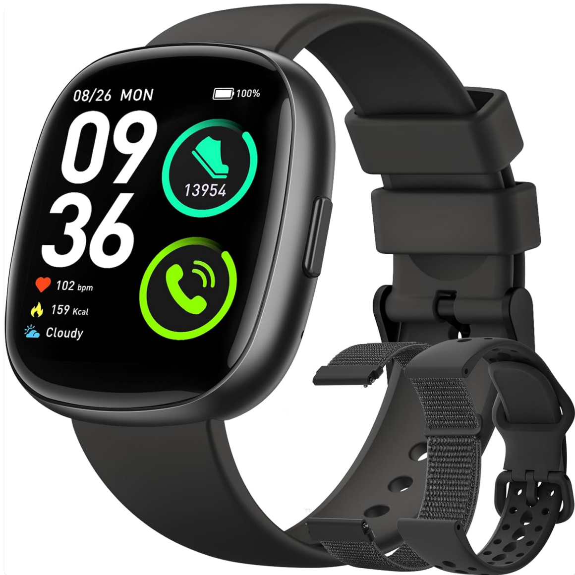
Figure 2: Sanorum Smart Watch ready for setup.

To unlock the full potential of your Sanorum Smart Watch, download the 'GloryFit' APP from your smartphone's app store. You can typically find a QR code in the included user manual for direct download. Once installed, open the app and follow the on-screen instructions to pair your watch via Bluetooth. Ensure Bluetooth is enabled on your phone and keep the watch close during the pairing process.