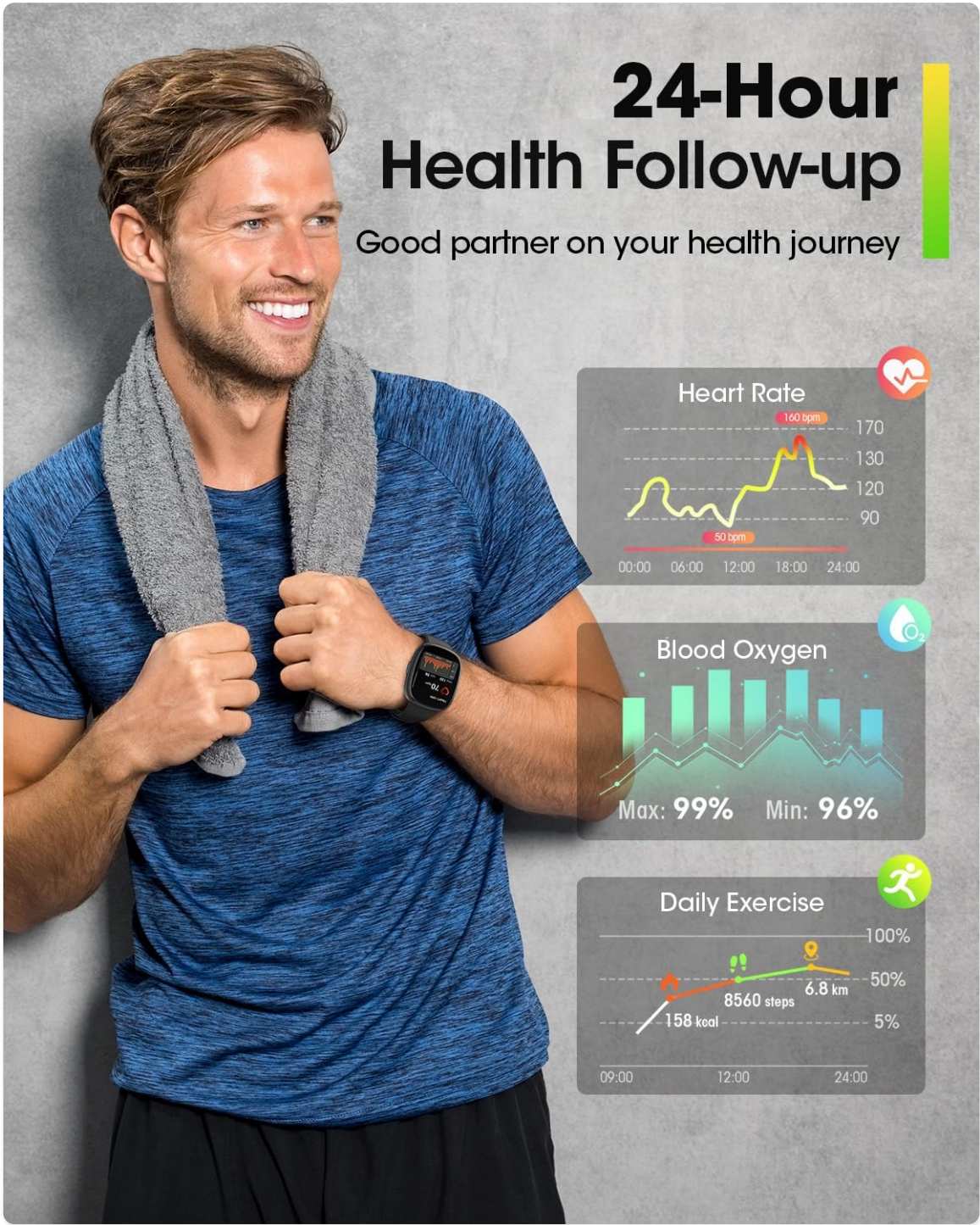
Figure 5: 24-Hour Health Follow-up on the smartwatch.