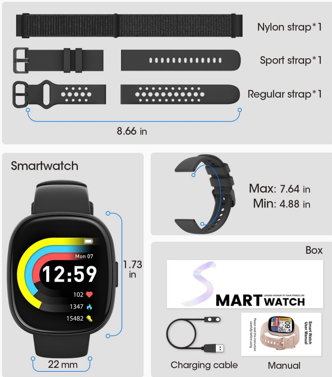
Figure 1: Contents of the Sanorum Smart Watch package.

The package includes three distinct bands, allowing for personalization and comfort across various activities. The charging cable is provided for convenient power replenishment.