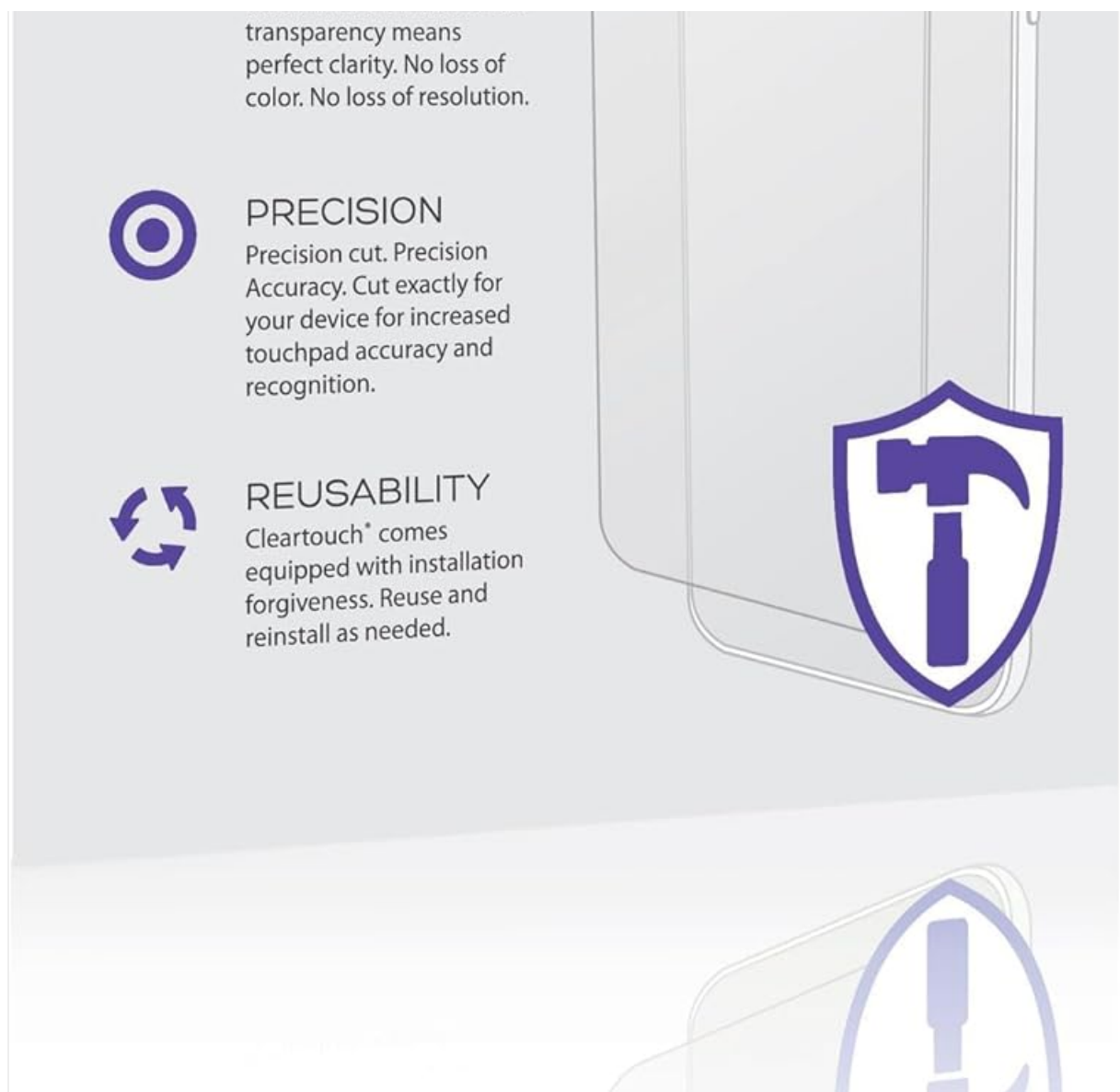
Image 2.1: Packaging of the BoxWave ClearTouch ImpactShield (2-Pack).