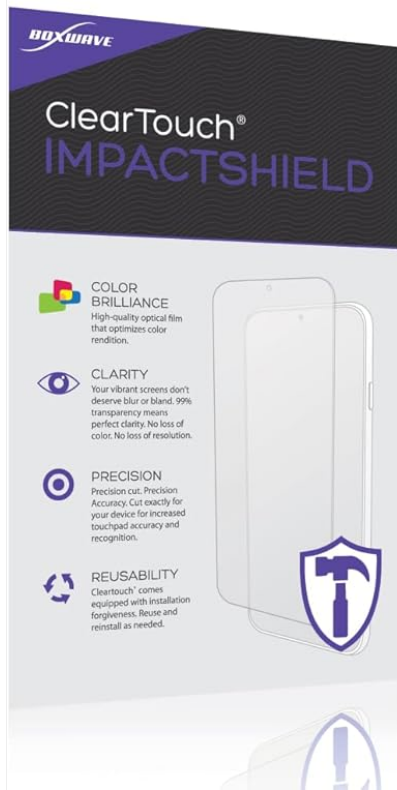
Image 1.1: BoxWave ClearTouch ImpactShield applied to a portable monitor.