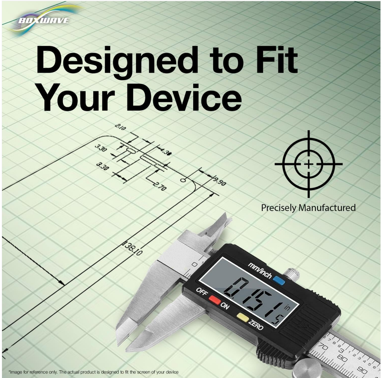
Image 3.1: The screen protector is precisely manufactured for a perfect fit on your device.