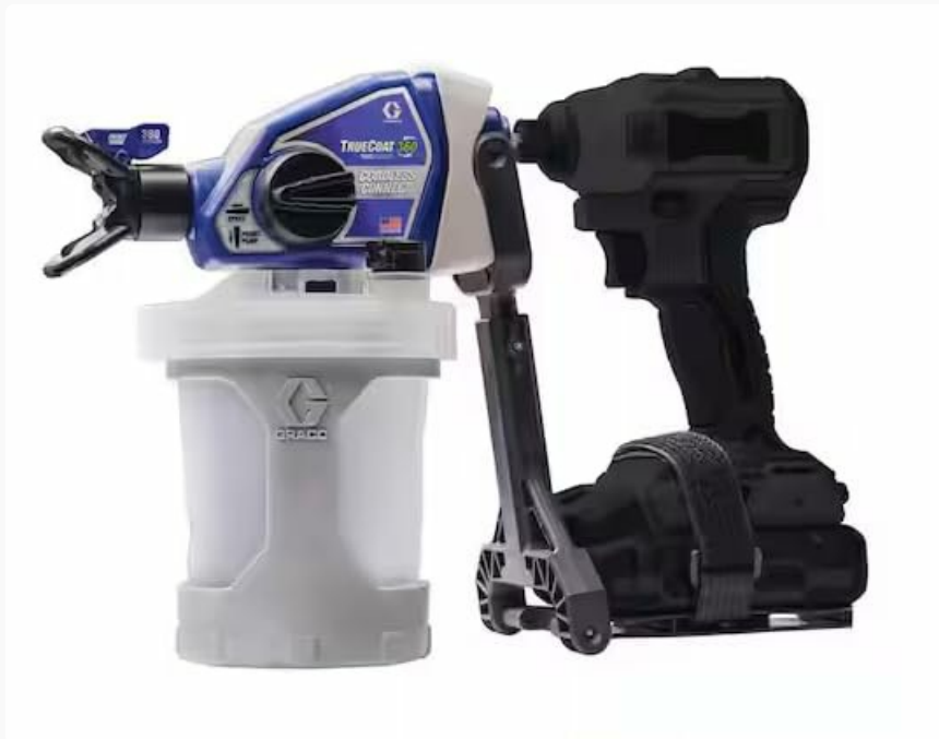
The Graco TrueCoat 360 Cordless Connect Drill Paint Sprayer, ready for use.

The Graco TrueCoat 360 Cordless Connect Drill Paint Sprayer is designed to transform your standard power drill into an efficient paint sprayer for small to medium-sized projects. This innovative attachment provides a smooth, even finish, reducing the need for traditional brushes and rollers. Its cordless design offers flexibility and ease of use for various DIY tasks around the home.