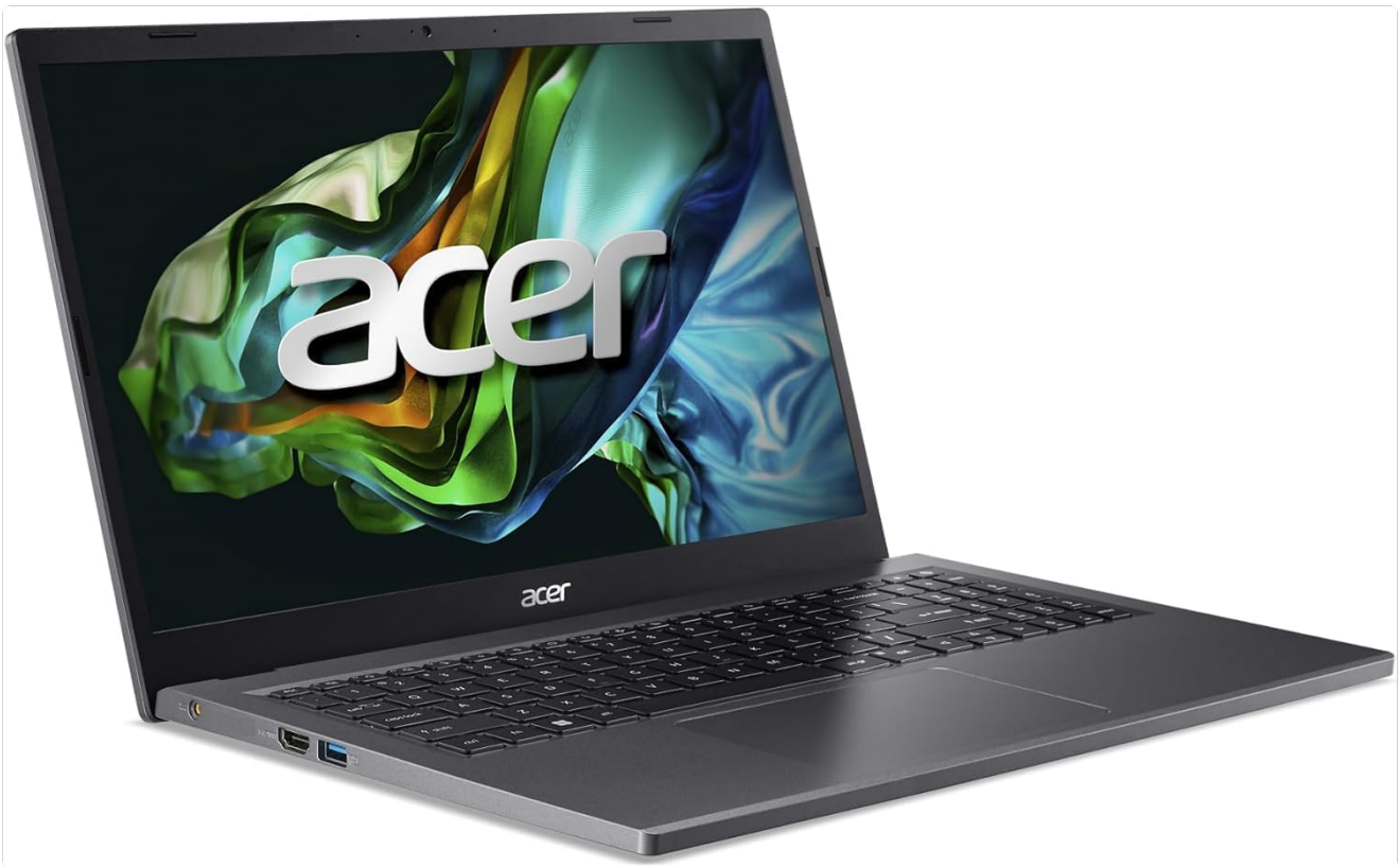
Figure 2.1: Right side view of the laptop, illustrating the power input port and other connectivity options.