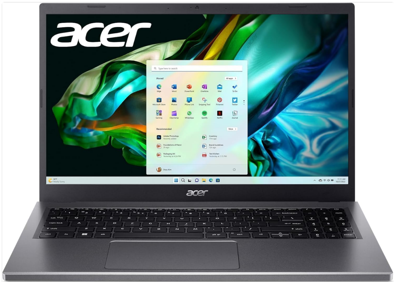
Figure 1.1: Front view of the Acer Aspire 5 laptop displaying the Windows 11 operating system interface.