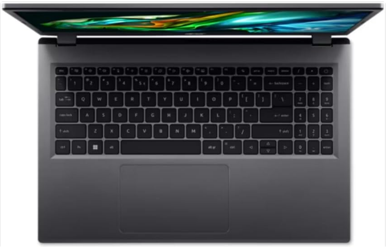
Figure 3.1: Overhead view of the laptop's keyboard and large touchpad, highlighting the integrated numeric keypad.