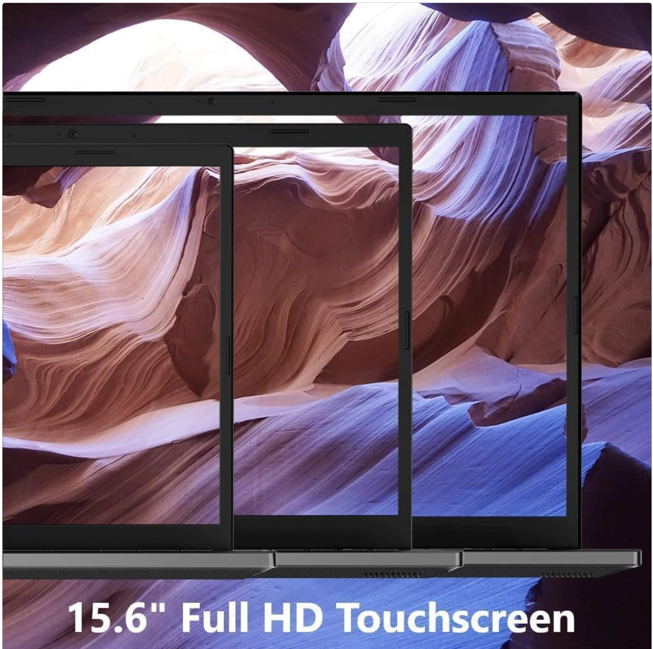
Figure 3.2: Visual representation emphasizing the 15.6-inch Full HD touchscreen display size and clarity.