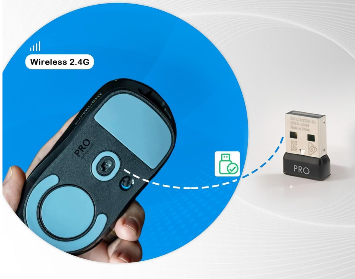
Image: Illustration demonstrating the easy connection process between the dongle and the G Pro Wireless Mouse.