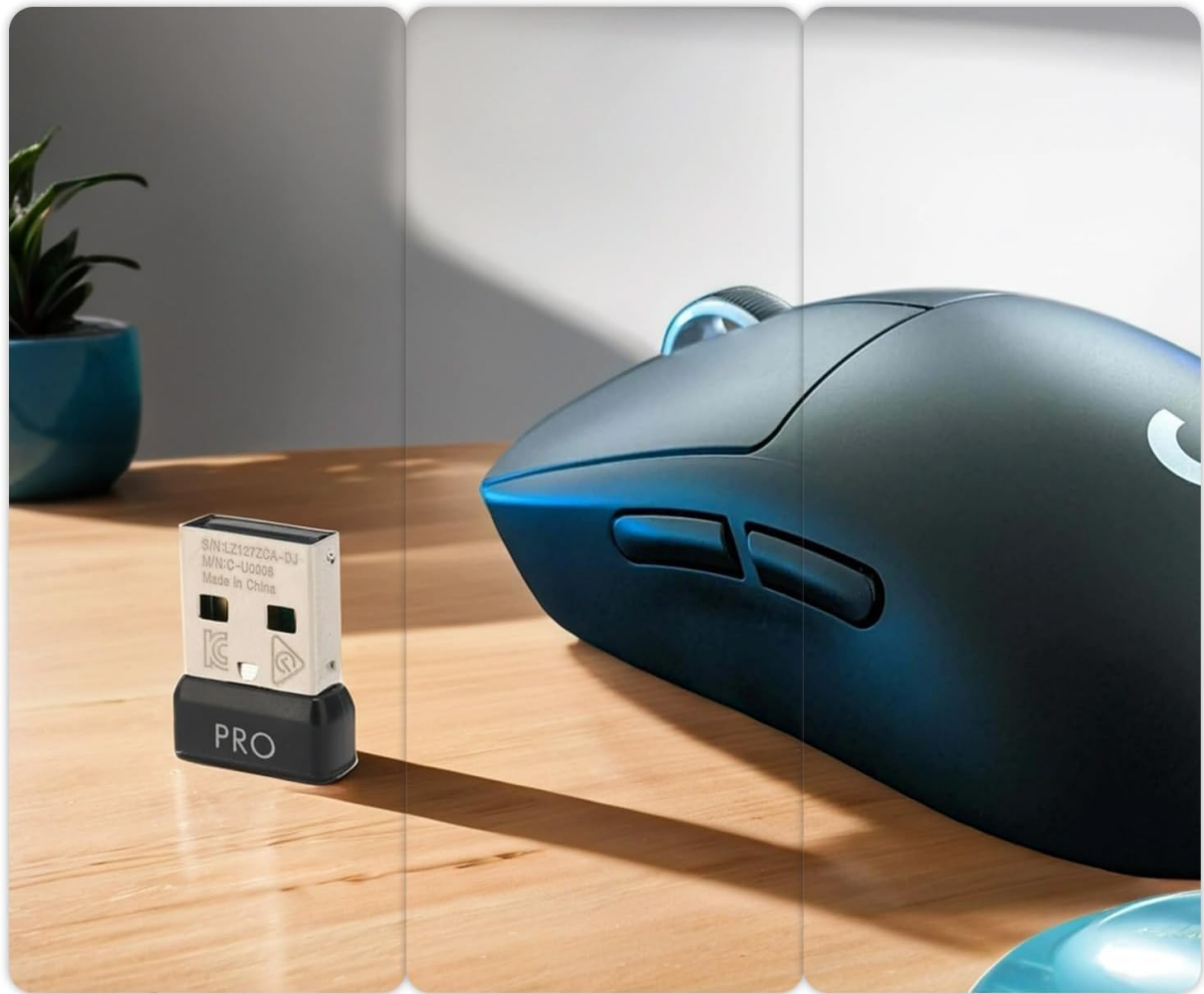
Image: The USB dongle positioned next to a Logitech G Pro Wireless Mouse, illustrating its role as a receiver.

for the original mouse receiver that was lost