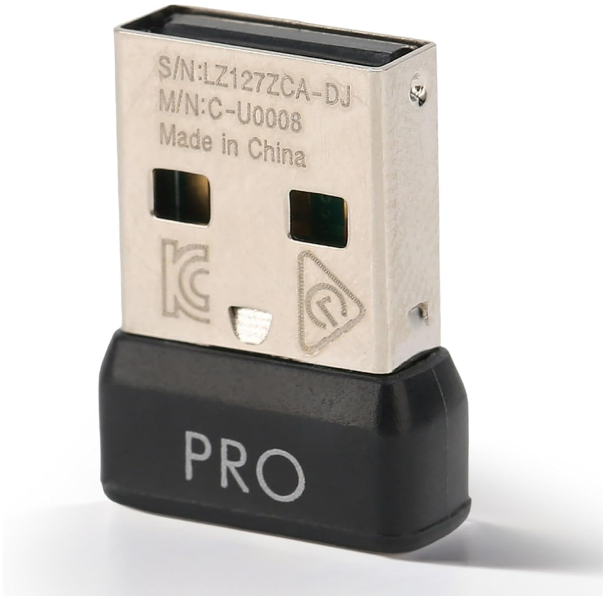
Image: The TALTAW USB Dongle Mouse Receiver Adapter, showing its compact design and "PRO" branding.