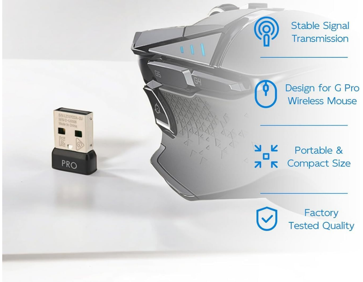
Image: Diagram highlighting key features such as 2.4 GHz wireless, stable signal, design for G Pro, portable size, and factory tested quality.