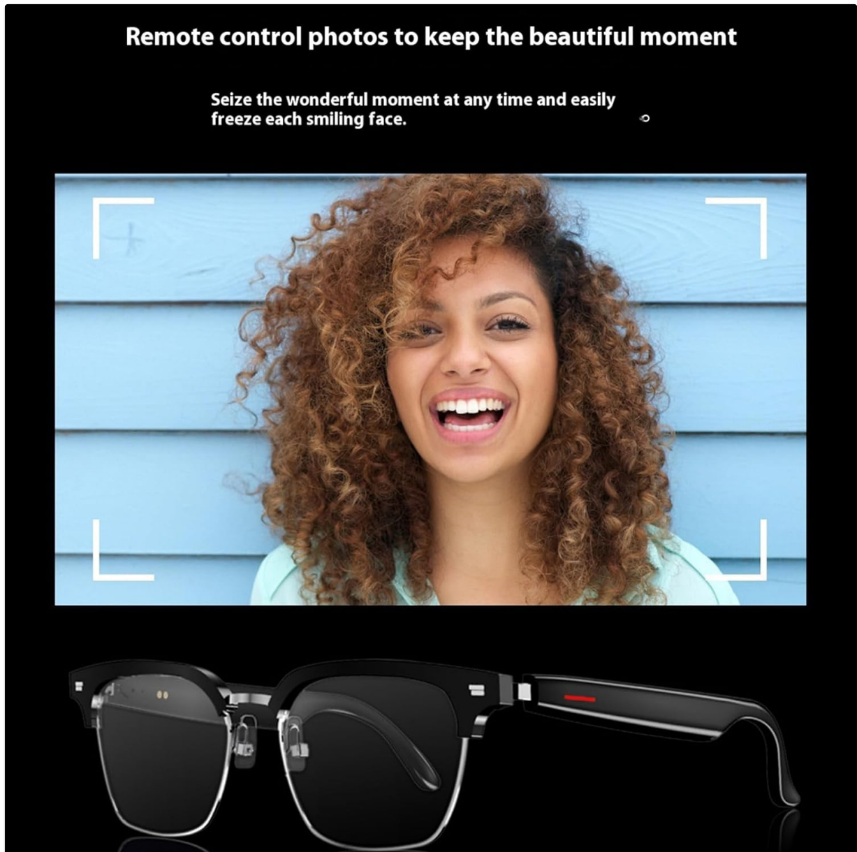
Figure 5: Remote Control Photography. This image depicts a person smiling while wearing the smart glasses, with a camera viewfinder overlay, illustrating the remote photography function.