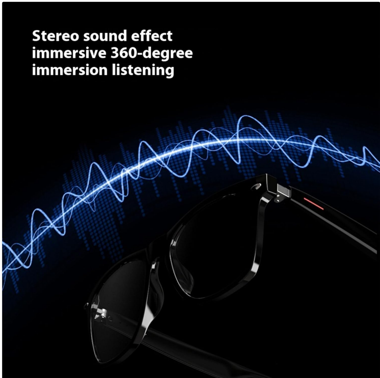
Figure 4: Stereo Sound Effect. This image visually represents the stereo sound output from the smart glasses, showing sound waves emanating from the temples.

Once connected to your device, you can play music through the integrated speakers. Use the touch controls to play, pause, skip tracks, and adjust volume.