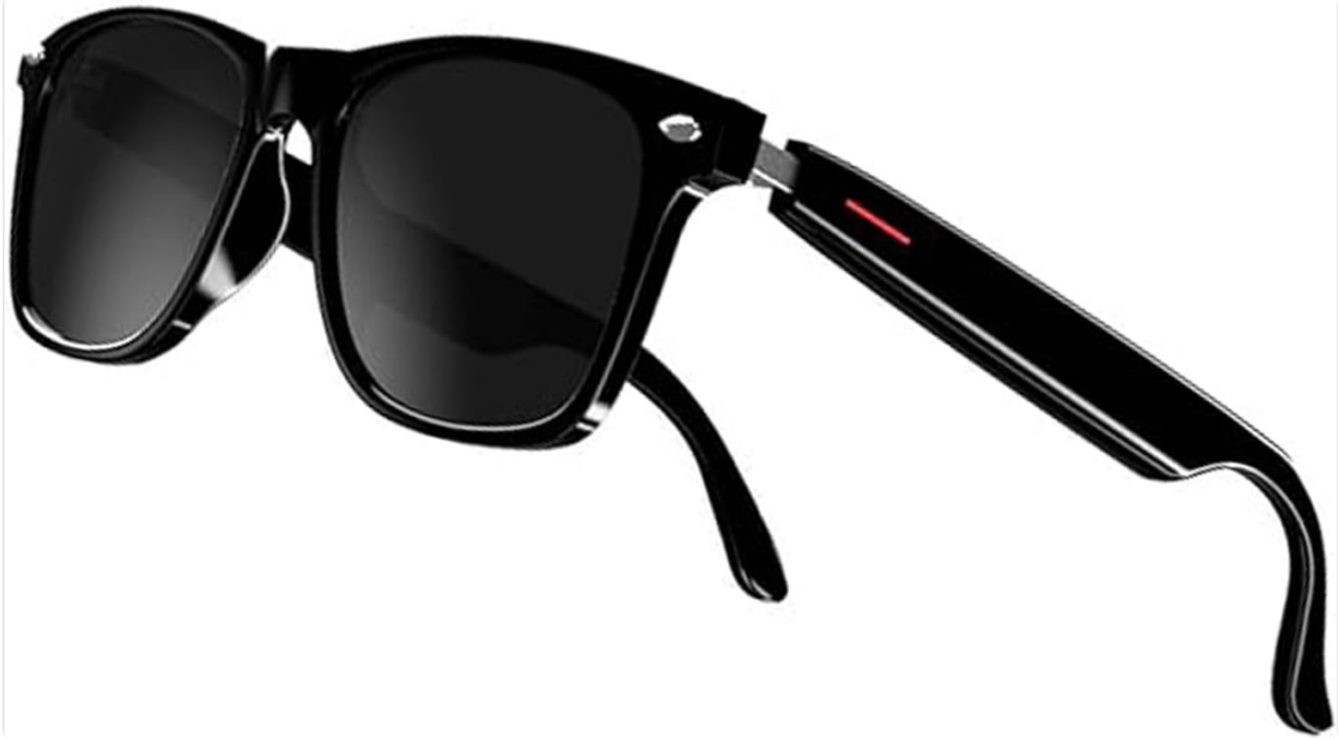
Figure 1: Generic E13 Smart Wireless Headphone Sunglasses. This image shows the black sunglasses with integrated audio components in the temples.