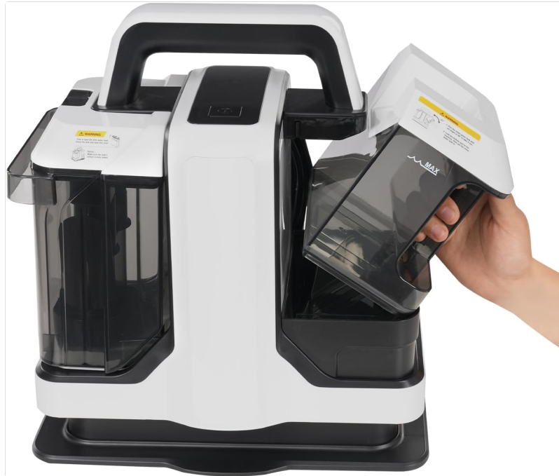
Image 5.1: A hand removing the dirty water tank from the main unit for emptying and cleaning.