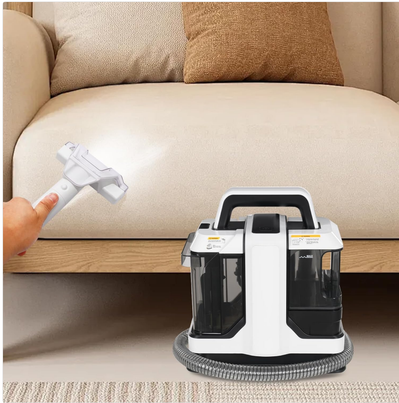
Image 4.2: The cleaner being used to remove a stain from a couch, highlighting its versatility for upholstery.