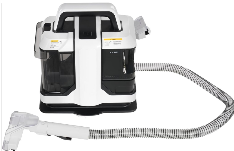
Image 1.1: The TFCFL JCE002 Portable Carpet and Upholstery Deep Cleaner, showcasing its compact design and hose attachment.

The TFCFL JCE002 is a portable deep cleaner designed for effective spot and stain removal from various fabric surfaces. Its compact design and powerful suction make it suitable for cleaning carpets, upholstery, stairs, and car interiors. This machine features separate tanks for clean and dirty water, ensuring efficient cleaning performance.