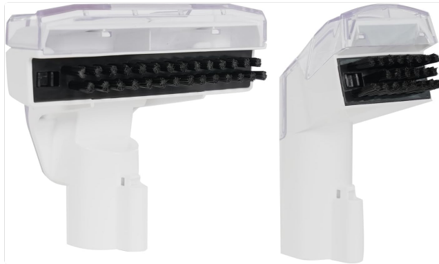
Image 1.2: The two included cleaning brushes, designed for different cleaning tasks.