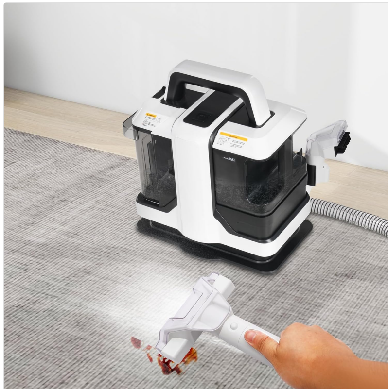
Image 4.1: Demonstrating the cleaning tool in action on a carpet stain, showing the spray and suction process.