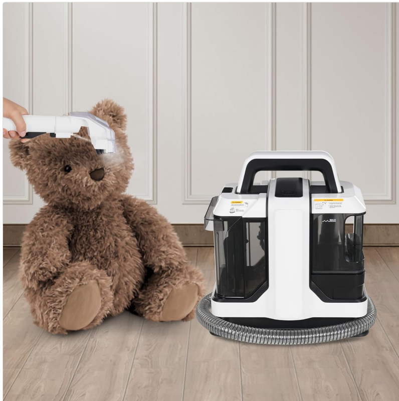
Image 4.3: The cleaner being used on a plush toy, demonstrating its gentle yet effective cleaning for delicate items.