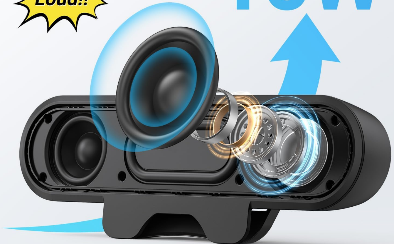
Image: An exploded view diagram of the speaker bar highlighting its two speakers and passive radiator, indicating 10W power output for superior sound quality.