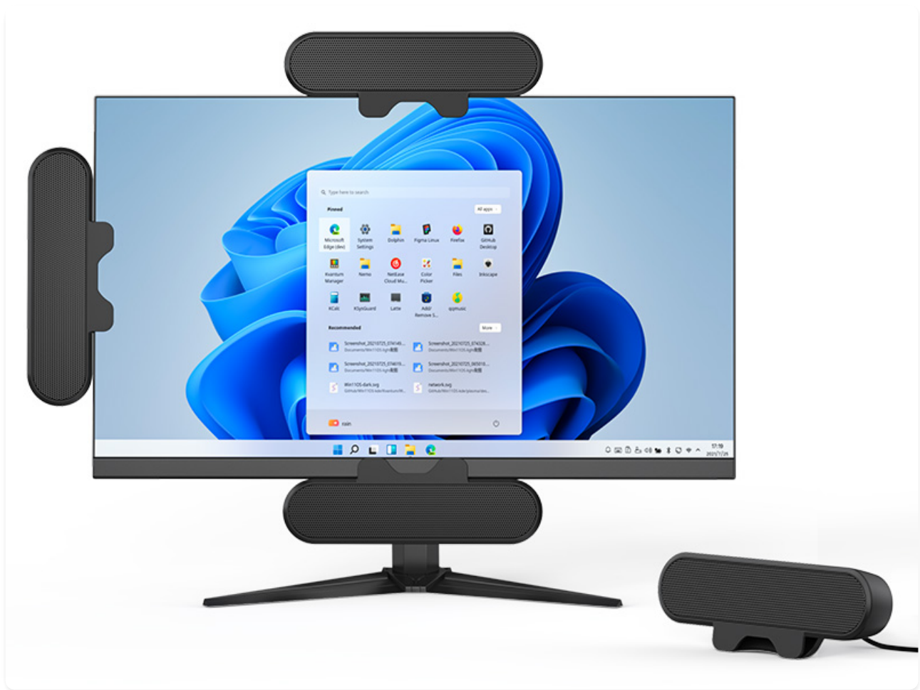
Image: A visual guide demonstrating how the speaker firmly attaches to monitors of varying thicknesses (0.2-inch, 0.7-inch, 1.18-inch), ensuring stability and eliminating concerns about being knocked over.