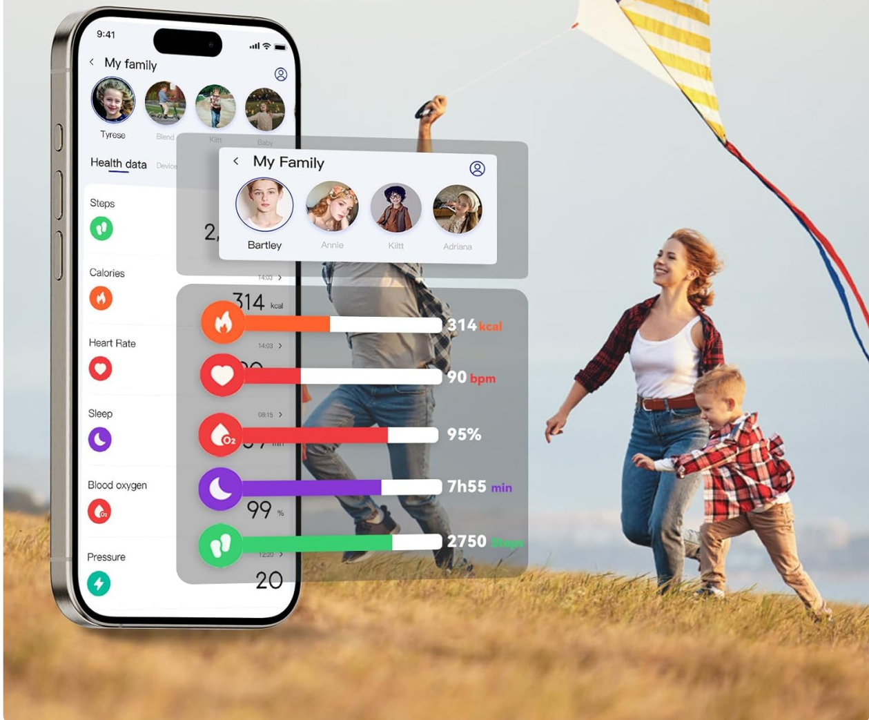
Image: The mobile application interface displaying health data for multiple family members, including steps, calories, heart rate, sleep, and blood oxygen levels.

Die Gesundheit und Fitness Ihrer Kinder im Auge behalten