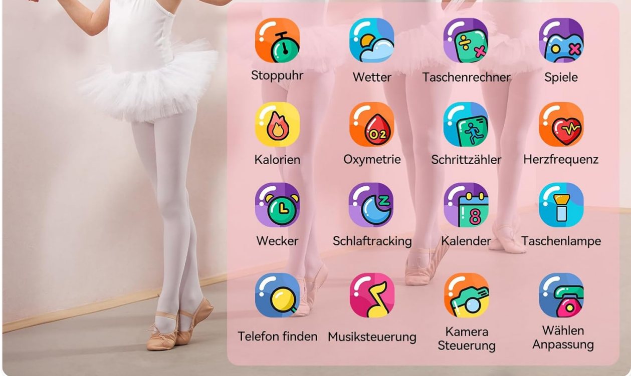
Image: The smartwatch interface displaying icons for various functions including stopwatch, weather, calculator, games, calories, oximetry, pedometer, heart rate, alarm, sleep tracking, calendar, flashlight, find phone, music control, camera control, and dial customization.