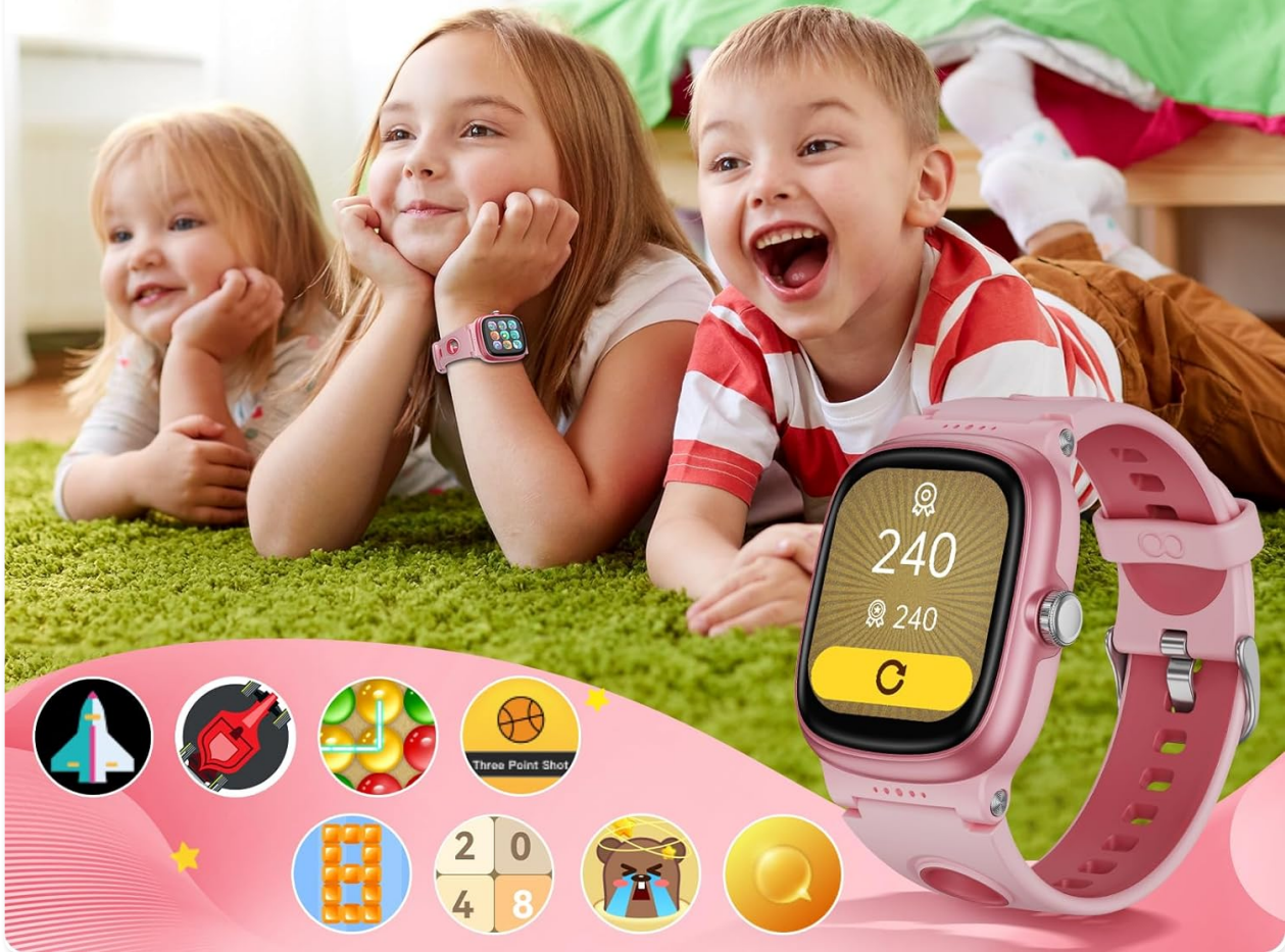
Image: Children happily engaging with the smartwatch, highlighting its educational games feature.