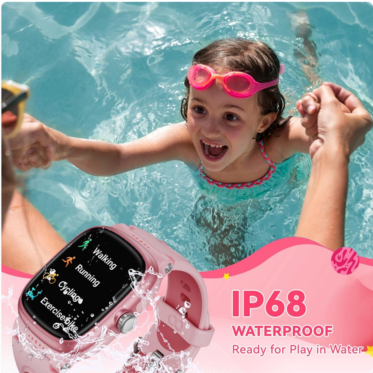
Image: A child wearing the smartwatch while playing in a swimming pool, demonstrating its IP68 waterproof capability.