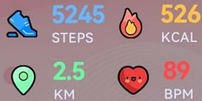
Image: The smartwatch displaying activity tracking data, including steps, calories, and distance, with children exercising in the background.