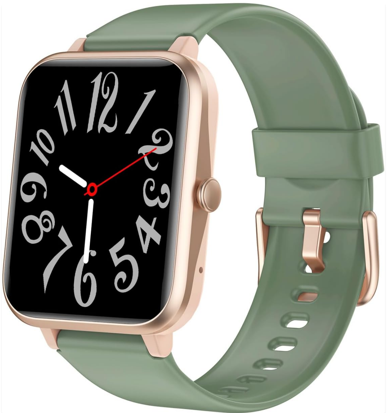
Image: The GRV Smart Watch FC1, featuring a green band and a gold-colored casing, displaying an analog clock face.