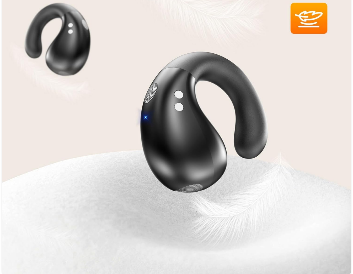
Figure 6: The lightweight and secure fit of the earbuds.

A single earbuds weighing only 0.18 oz, secure and comfortable fit