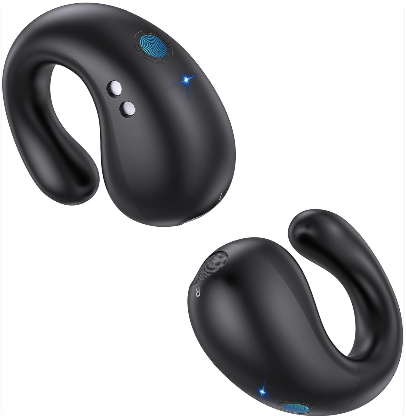
Figure 1: EUQQ Q92 Open Ear Clip-on Headphones and Charging Case.