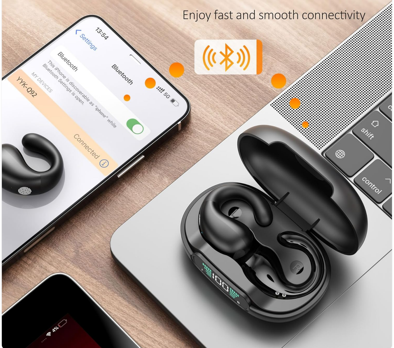
Figure 4: Seamless Bluetooth 5.3 connectivity.