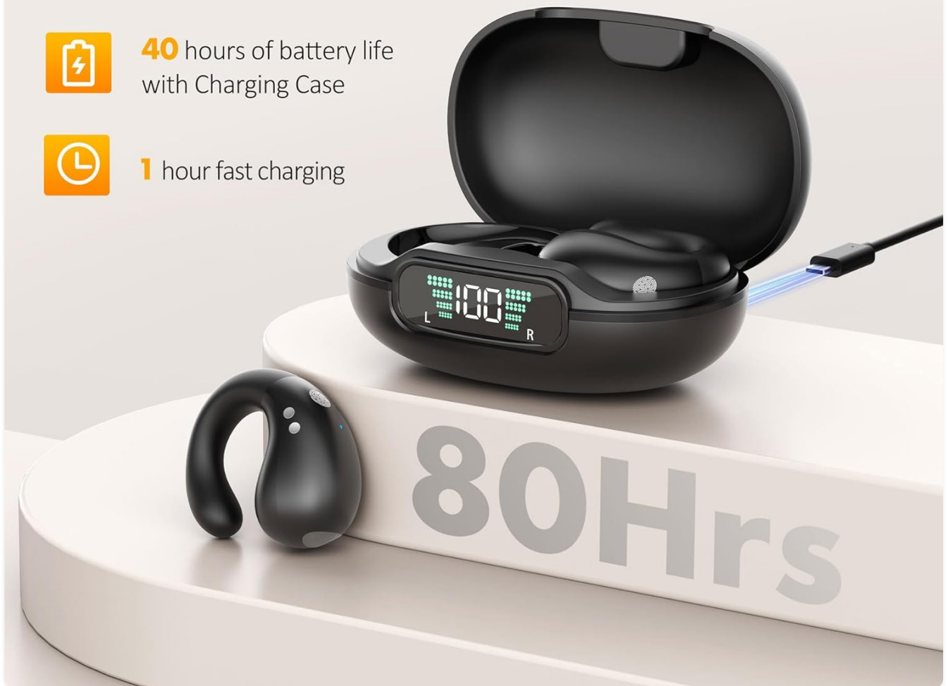
Figure 8: Battery life and charging details.