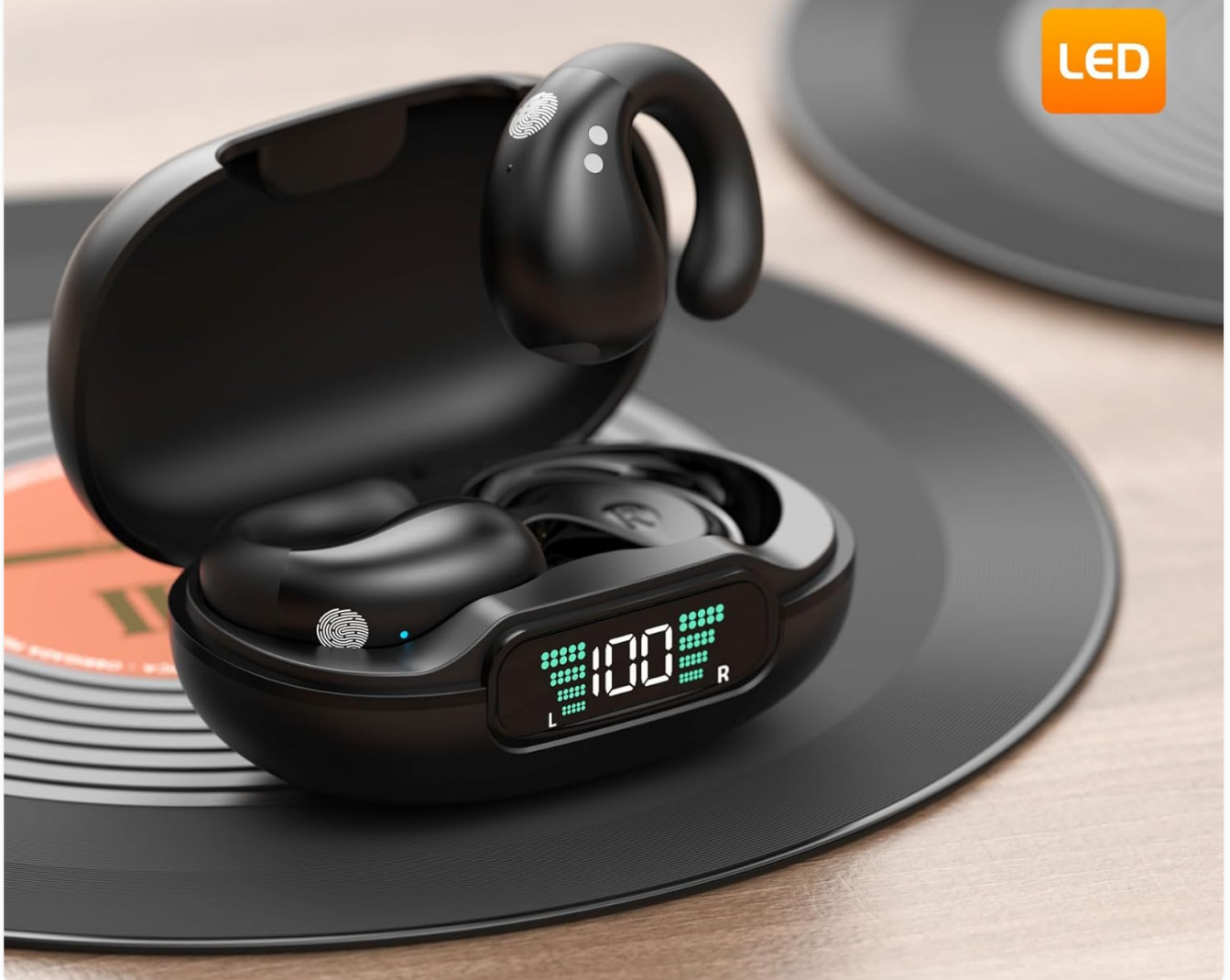
Figure 3: LED digital display showing battery levels.

LED display screen, clearly displaying the power supply situation