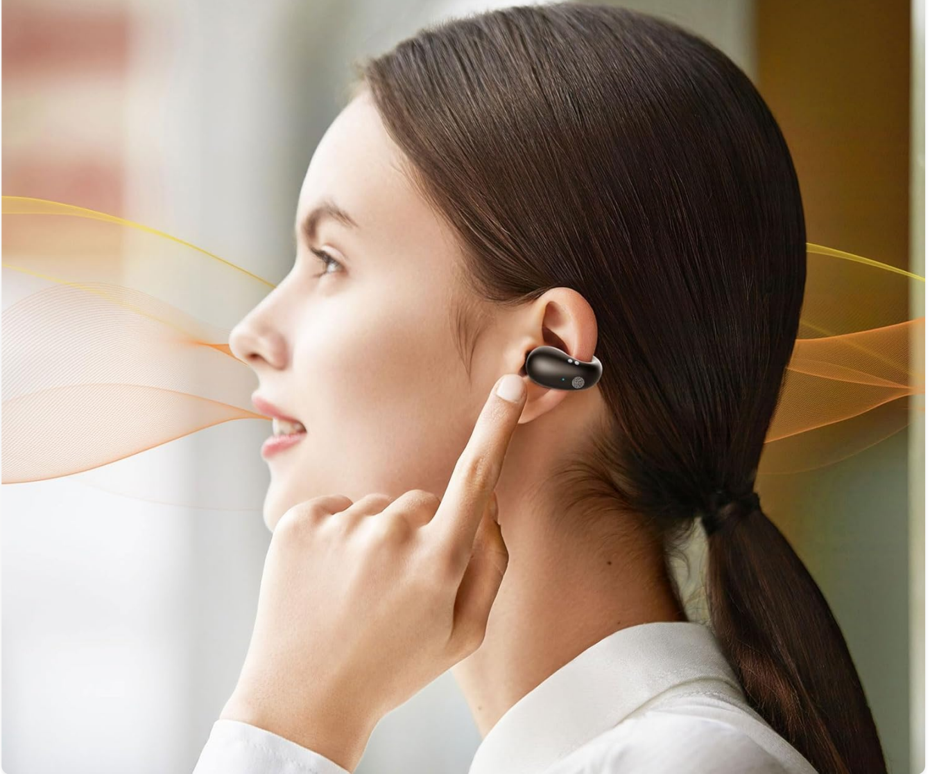
Figure 5: Proper placement of the open-ear earbuds for comfort and environmental awareness.

Clear understanding of the surrounding environment