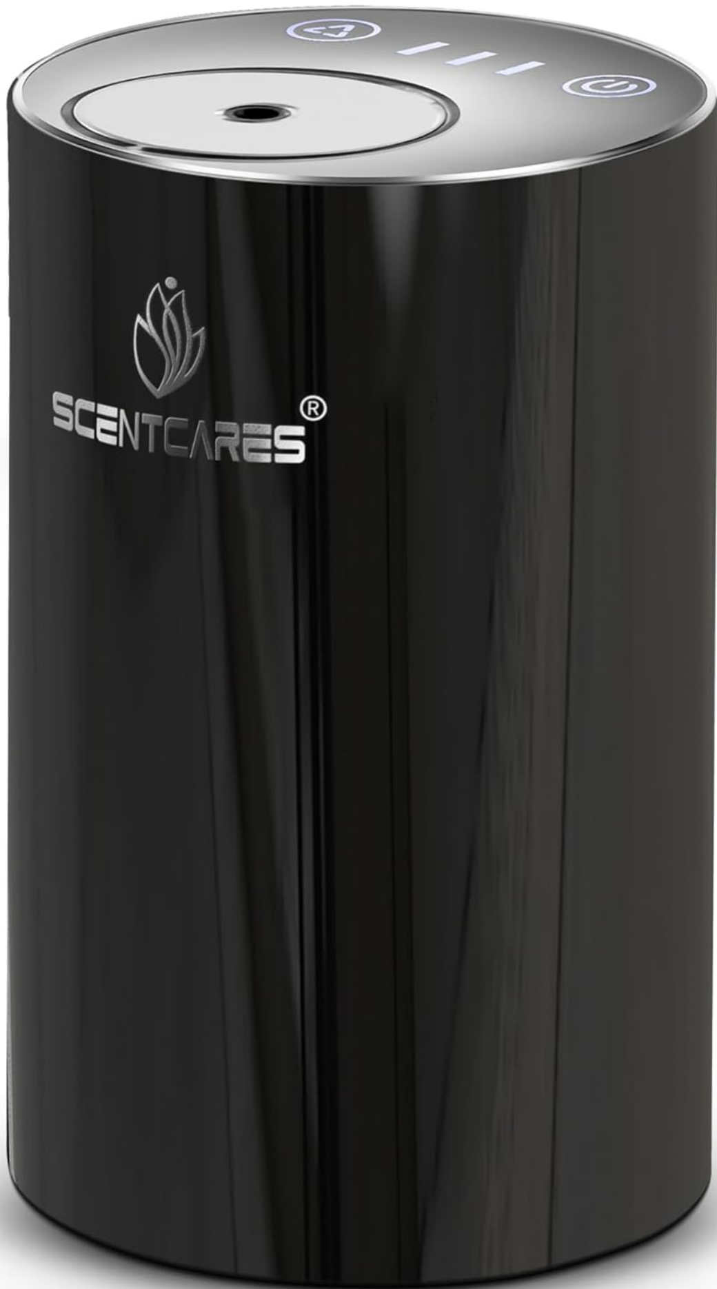
Figure 1: Scentscares Sentiment Diffuser (Black model shown)