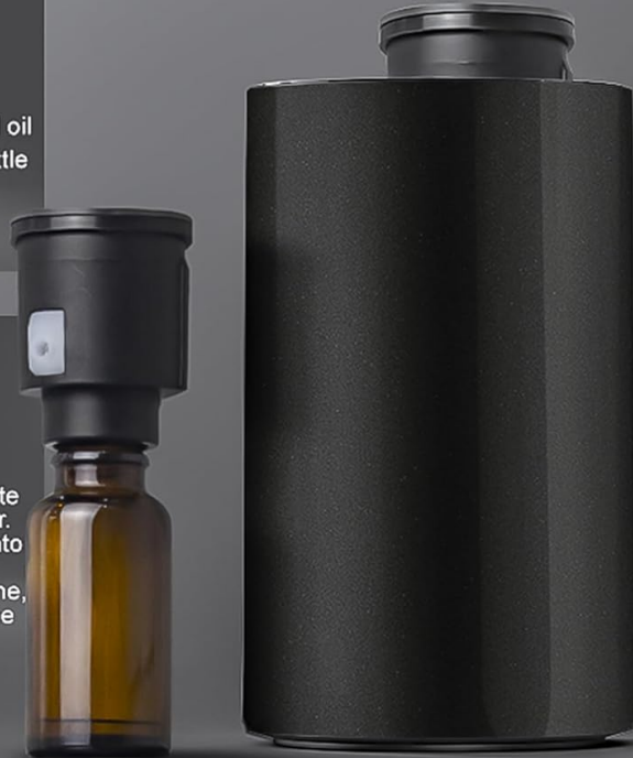
Figure 2: Essential Oil Bottle Installation Steps

Align nozzle to white orifice inside diffuser. Press the nozzle into the corresponding slot into the machine, till it is flush with the top cover.