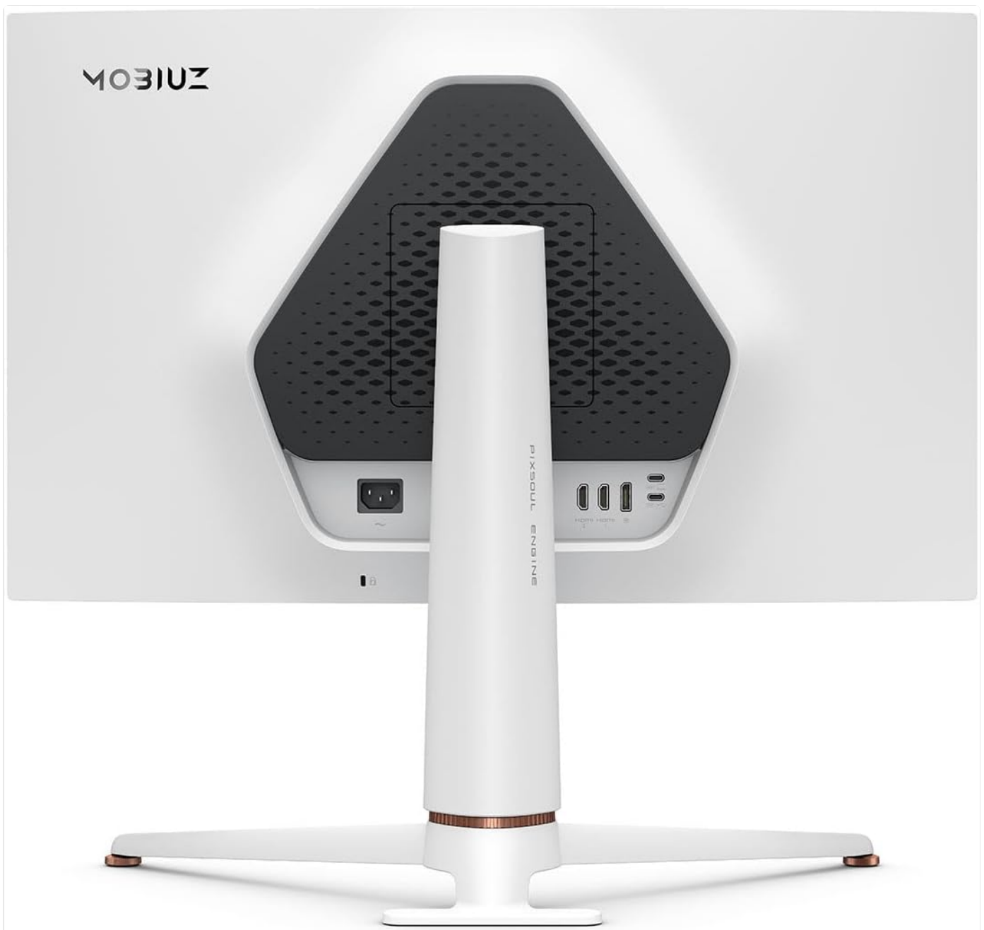
Figure 2: Rear Panel with Stand Attachment and Ports