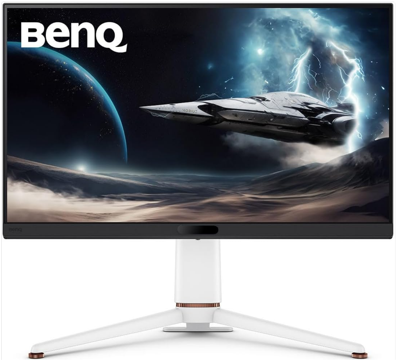
Figure 1: BenQ MOBIUZ EX271Q Gaming Monitor (Front View)