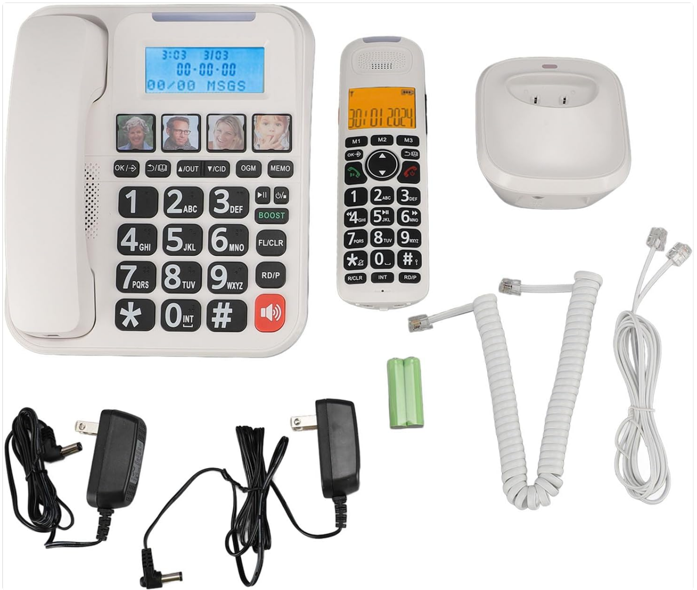
Figure 1: Complete package contents of the Yoidesu Cordless Phone System.