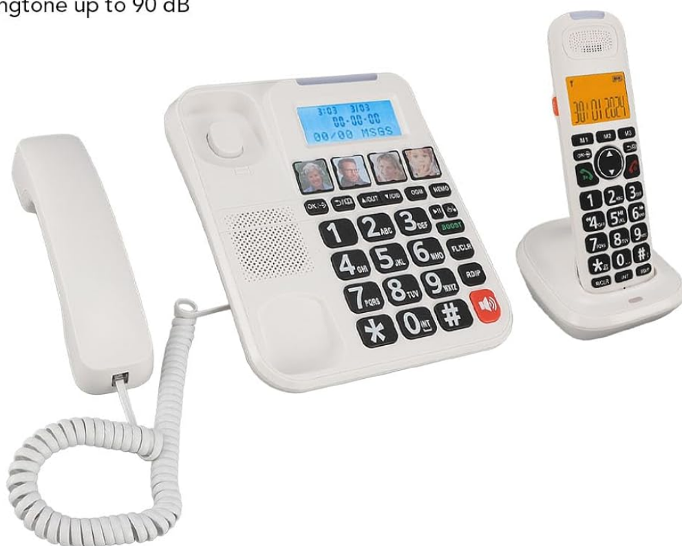
Figure 6: Using the Photo Dialing feature.