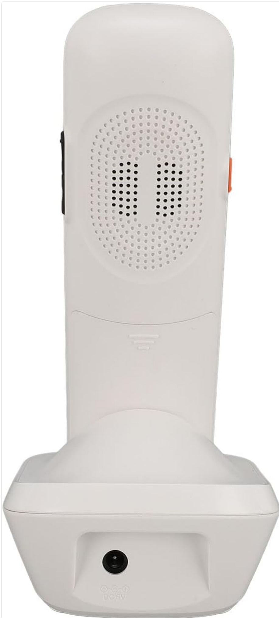
Figure 4: Rear connections of the Base Unit.