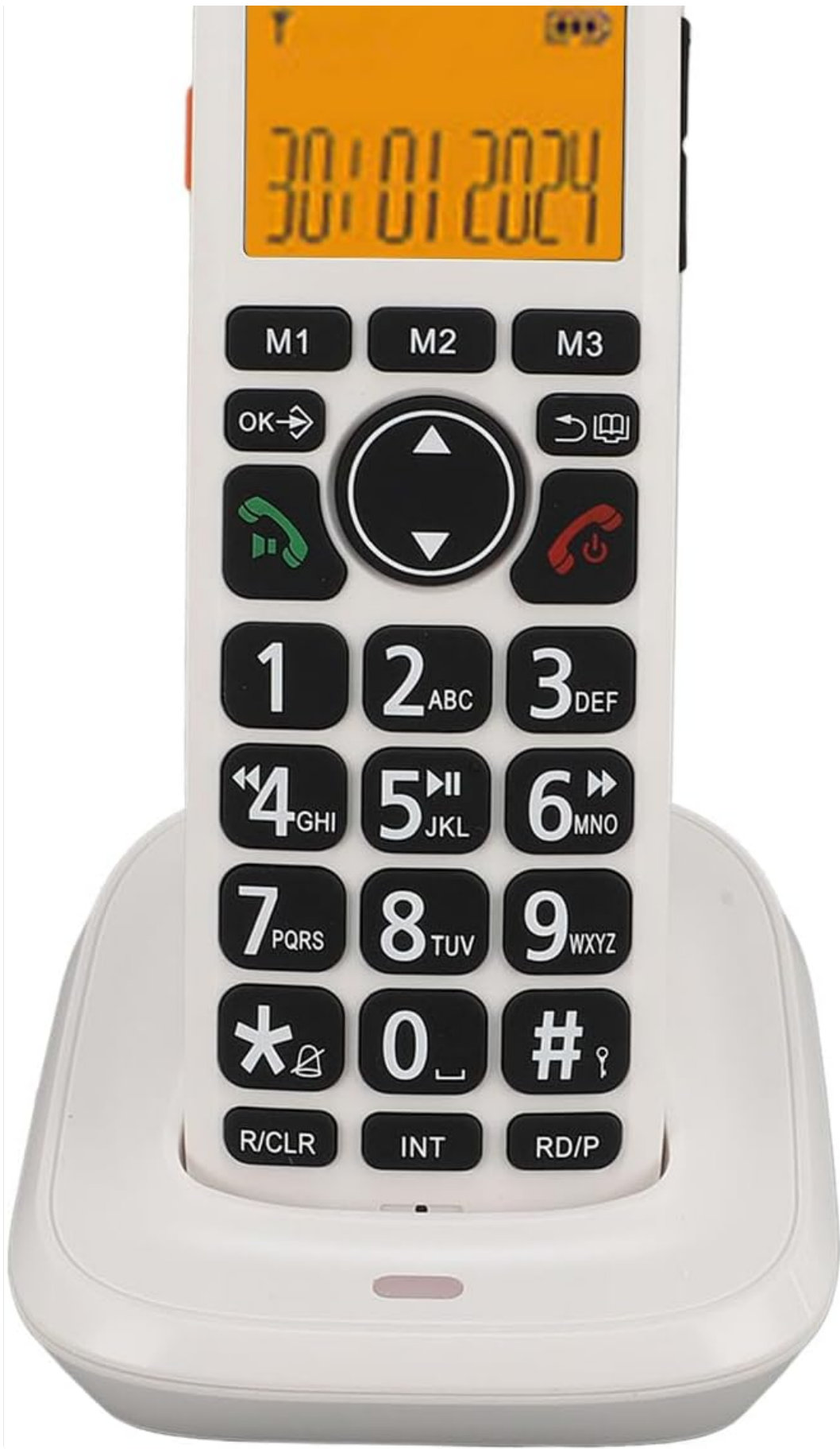
Figure 3: Front view of the Cordless Handset.