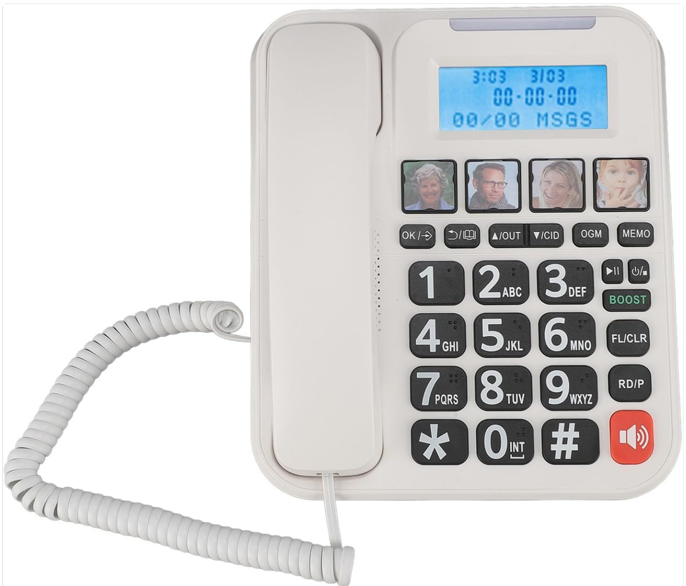
Figure 2: Front view of the Corded Base Unit.